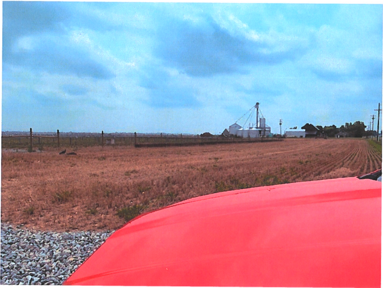
Hay growing between fence and road. Not solar panels.