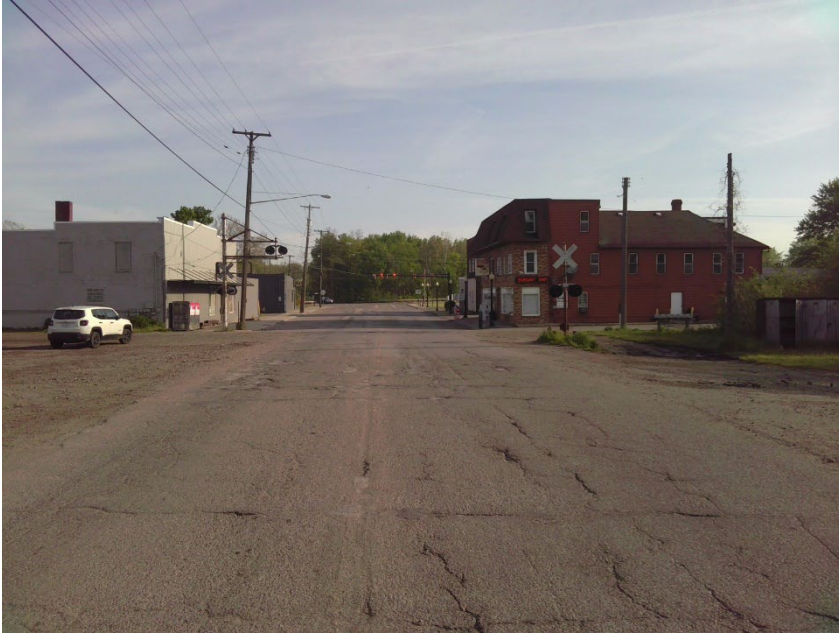
S. Leavitt Road (DOT#262-604C) South of Crossing looking North.