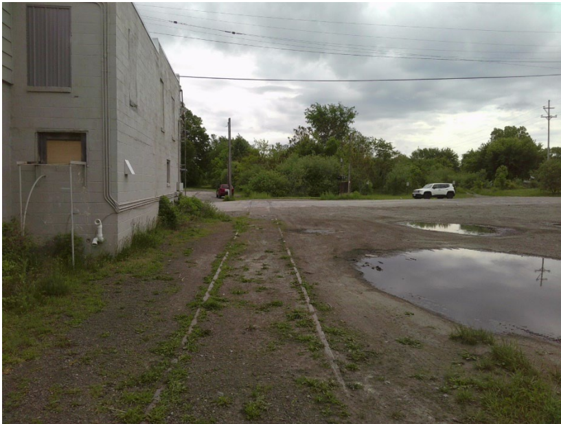
S. Leavitt Road (DOT#262-604C) West of Crossing looking East.