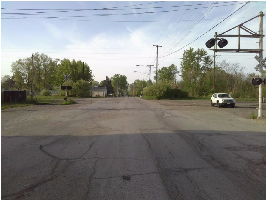
S. Leavitt Road (DOT#262-604C) North of Crossing looking South.