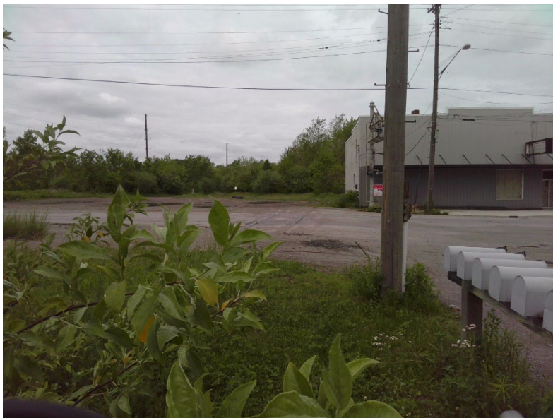
S. Leavitt Road (DOT#262-604C) East of Crossing looking West.