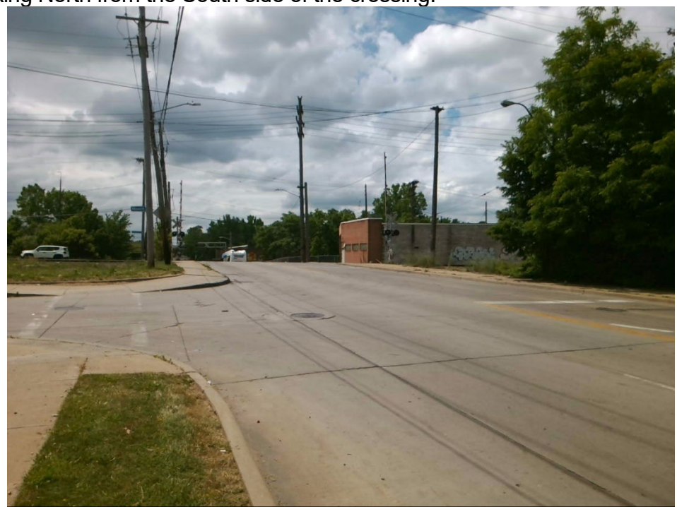
Looking South from the North side of the crossing.

Looking North from the South side of the crossing.