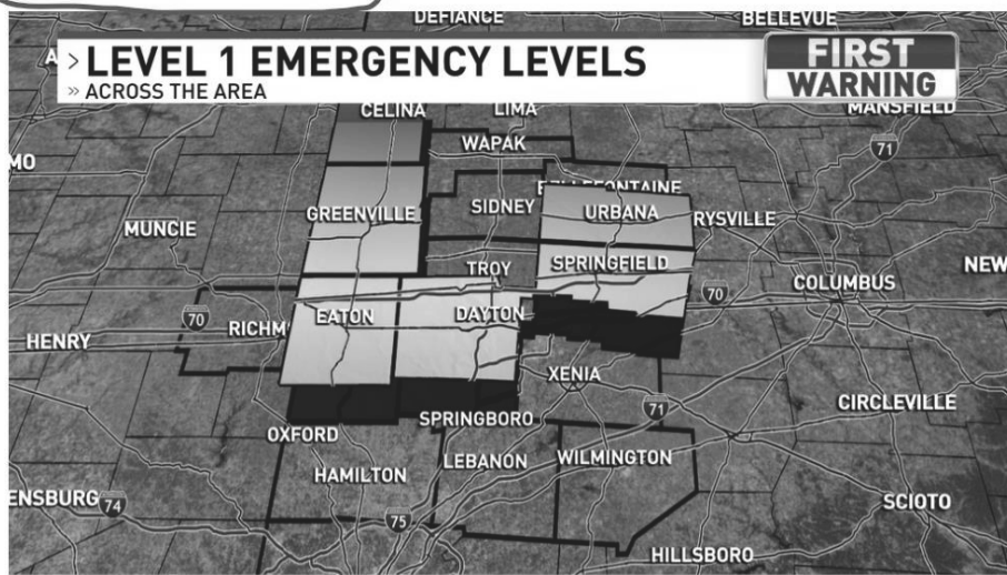
Dayton 24/7 Now

by Dayton 24/7 Now | Wed, January 25th 2023, 4:55 AM EST