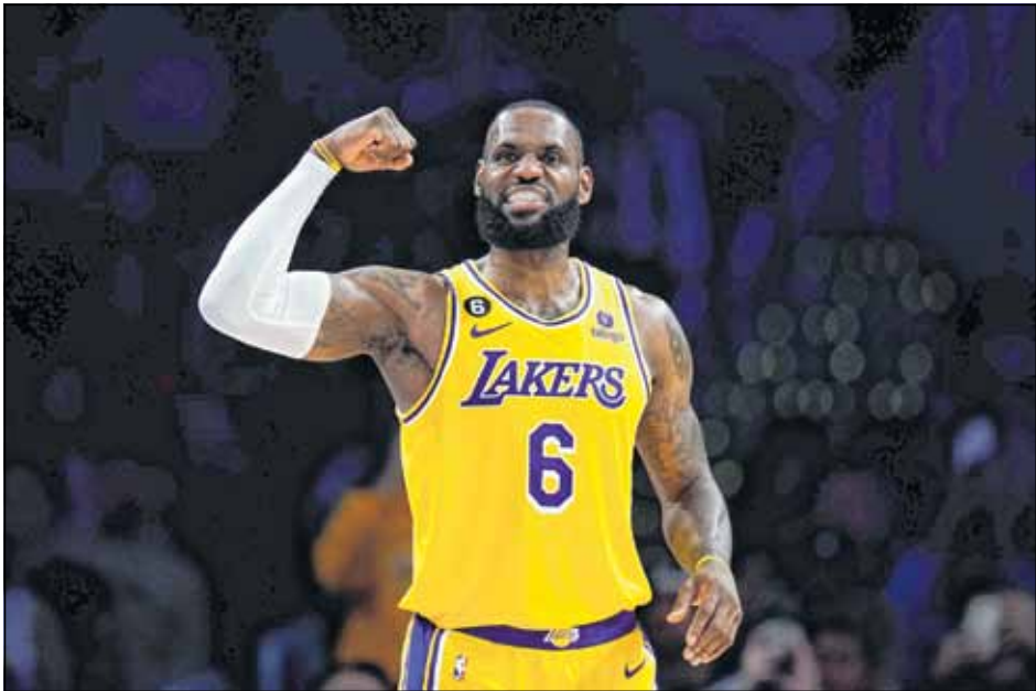
Los Angeles Lakers’ LeBron James (6) flexes his arm during the second half of a game against the Houston Rockets on Monday in Los Angeles. The Lakers won 140-132.

LOS ANGELES — At a time in life when all but the world’s greatest athletes are slowing down, LeBron James has picked up speed. James turned 38 years old on Dec. 30, deep in his 20th season in the NBA. He celebrated by scoring 47 points on his birthday, and the second-leading scorer in league history has been on a vintage roll ever since. James is averaging 37.0 points, 9.7 rebounds and 8.6 assists for the Los Angeles Lakers in his seven games since turning 38. He has three 40-point performances in that stretch, including a season-high 48-point effort in a 140-132 victory over Houston on Monday night. Older golfers take pride in shooting their age. James is nearly scoring his age against the best basketball players in the world — and even amid everything else James has done to redefine the parameters of greatness, his current surge is something special. “He’s just been in an