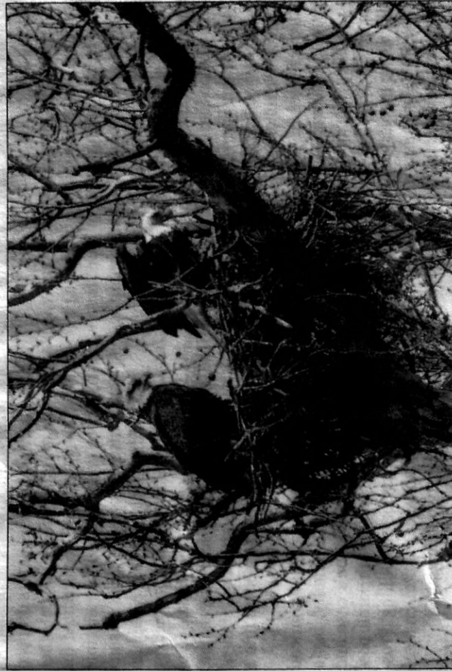
Division of Wildlife