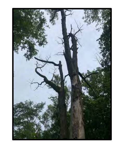
Photo 308: Example of potential summer roosting habitat within the Project Area.

Photo 307: Example of potential summer roosting habitat within the Project Area.