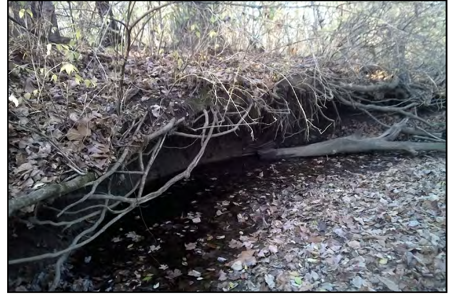
Stream s008, View Looking Downstream