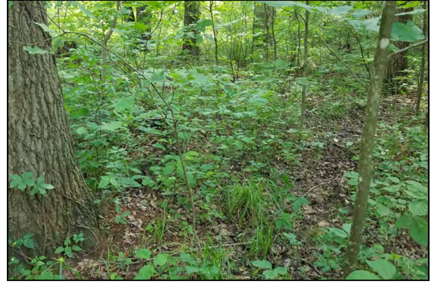
dp618, View Looking South