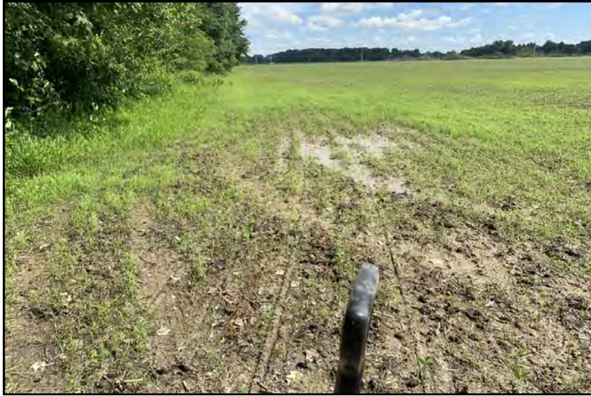
dp704, View Looking North