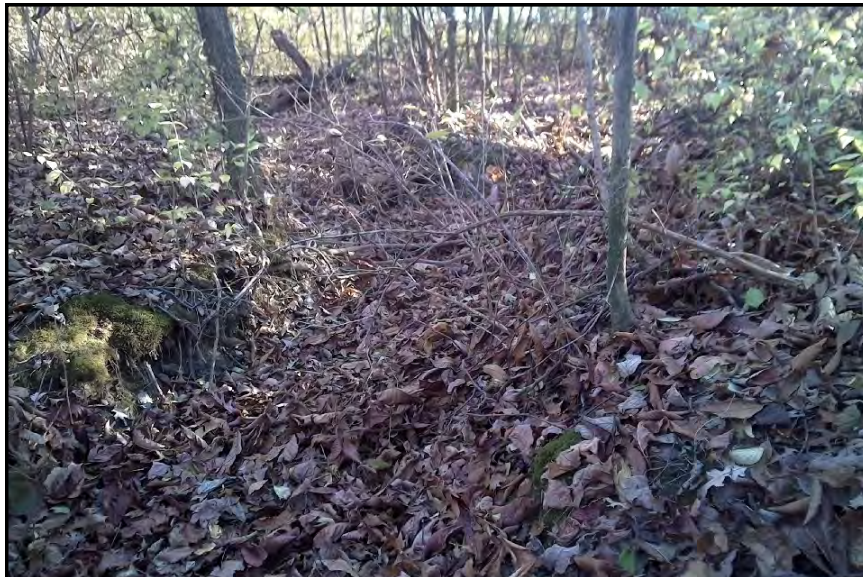
Stream s007, View Looking Upstream