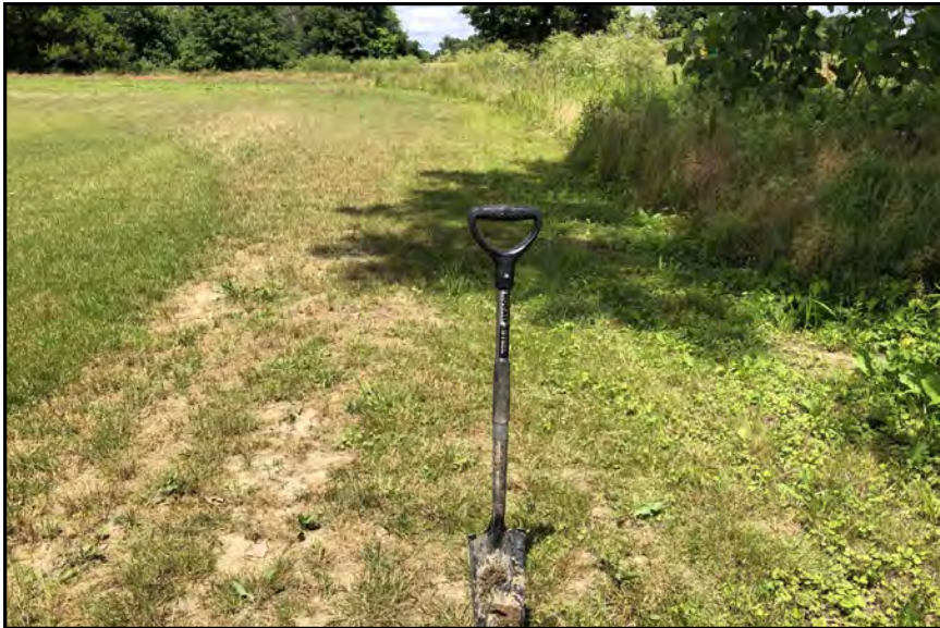
dp713, View Looking North