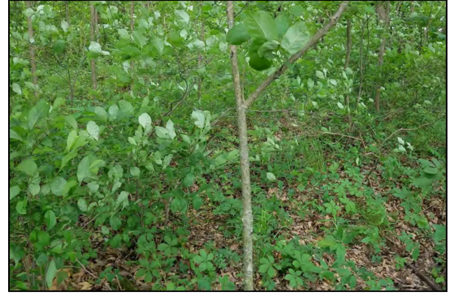
dp614, View Looking South