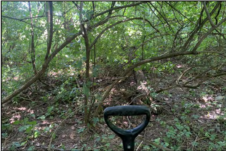
dp707, View Looking North