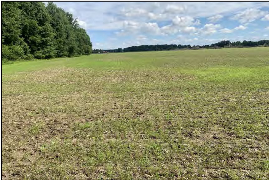
dp705, View Looking North