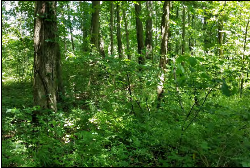
dp613, View Looking North