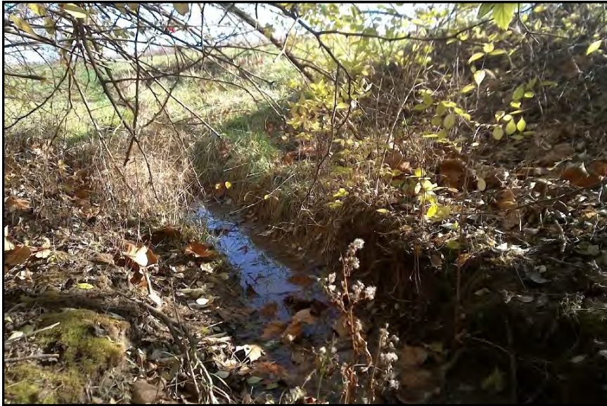
Stream s006, View Looking Upstream