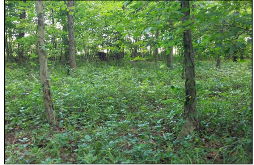
dp616, View Looking South