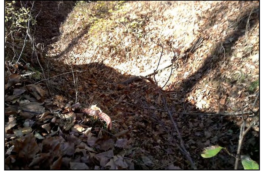
Stream s015, View Looking Downstream