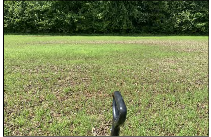
dp706, View Looking South