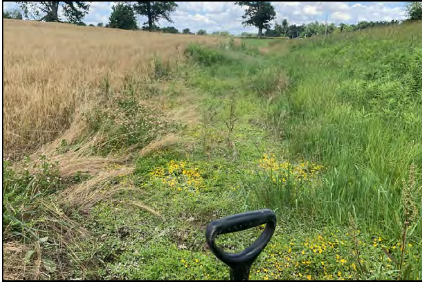
dp712, View Looking North