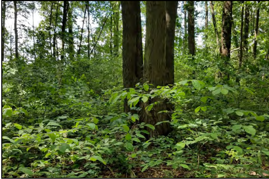
dp615, View Looking North