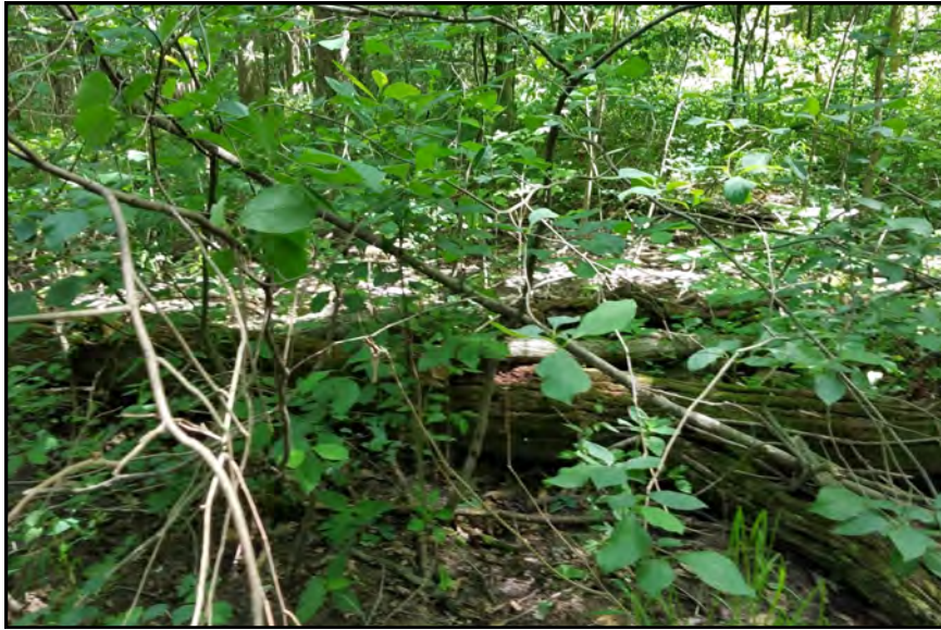
dp605, View Looking North