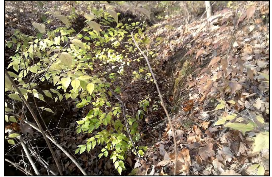
Stream s013, View Looking Downstream