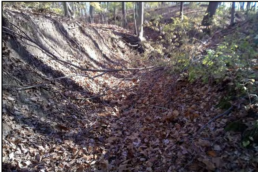
Stream s014, View Looking Upstream