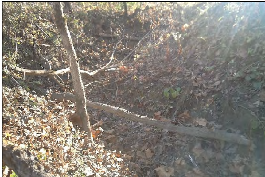
Stream s033, View Looking Upstream