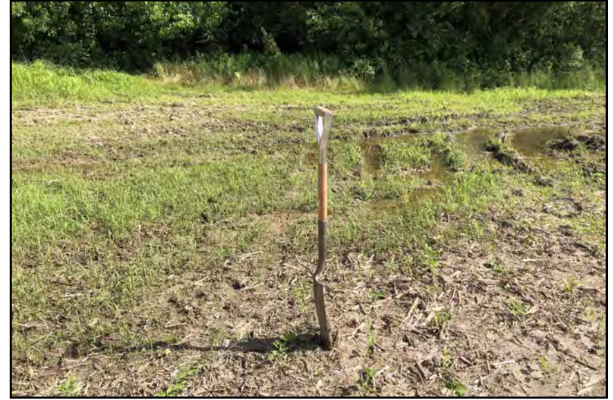
Dp718, View Looking South