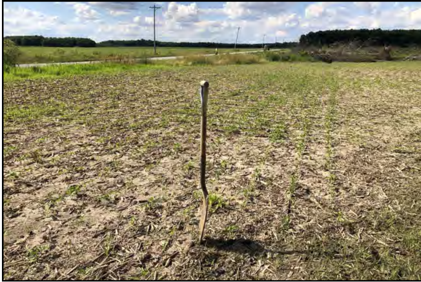
dp718, View Looking North