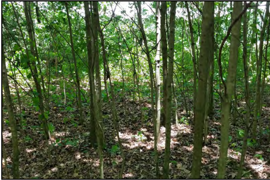
dp607, View Looking North