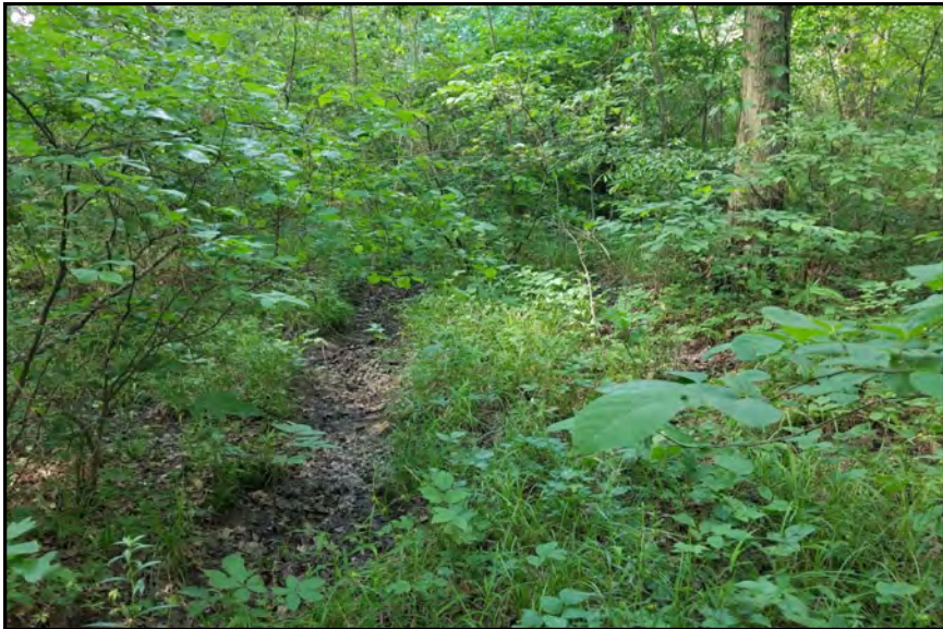
dp618, View Looking North