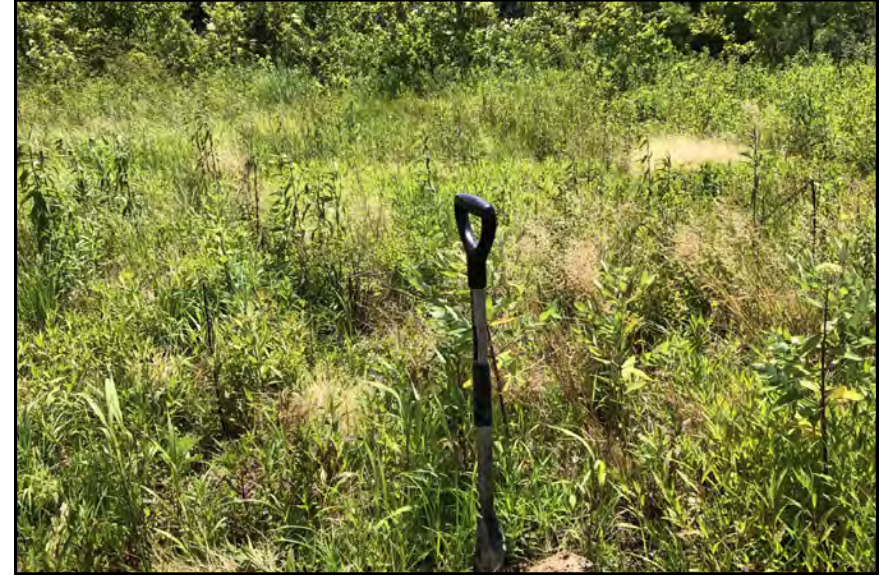
dp715, View Looking South