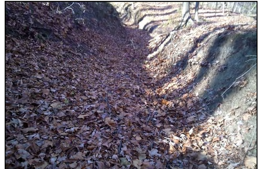
Stream s014, View Looking Downstream