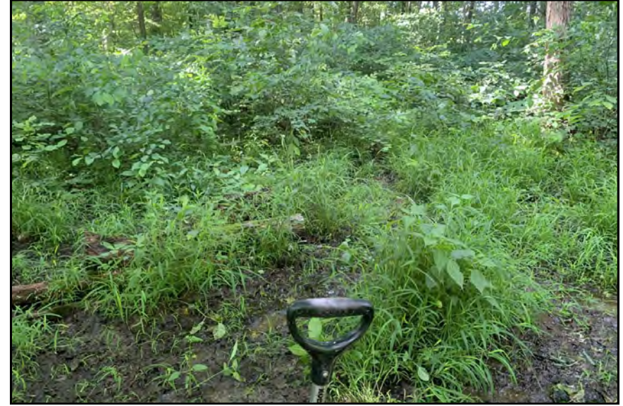
dp703, View Looking South