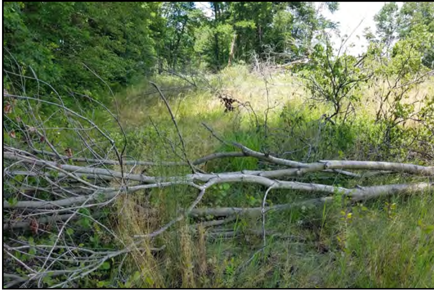
dp611, View Looking North