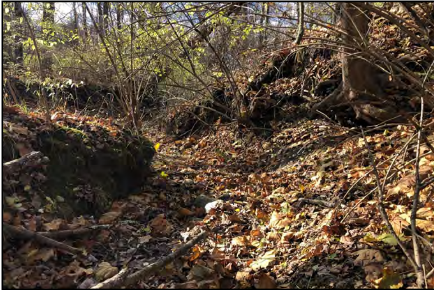
Stream s003, View Looking Upstream