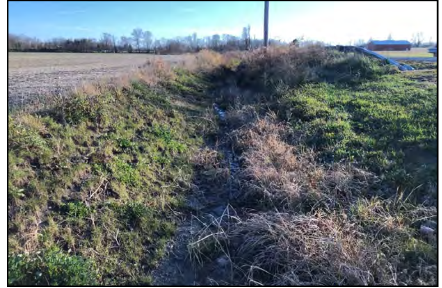
Stream s024, View Looking Downstream