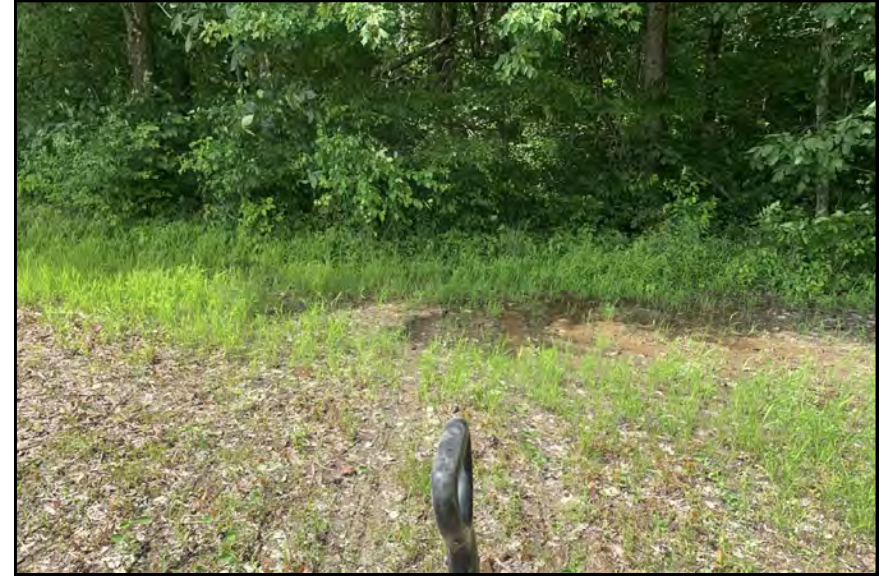
dp704, View Looking South