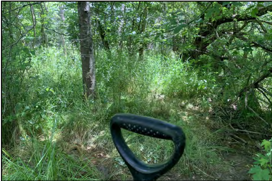
dp709, View Looking North