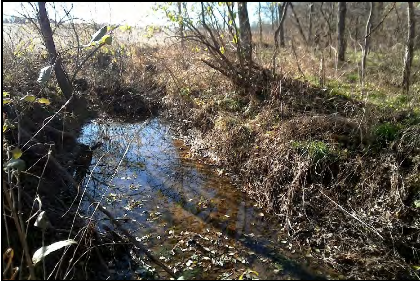
Stream s031, View Looking Upstream