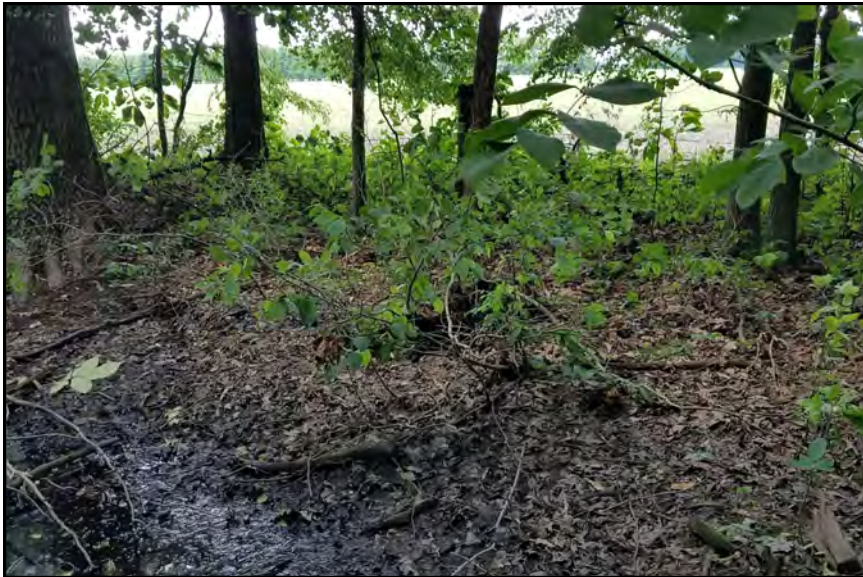
dp614, View Looking North