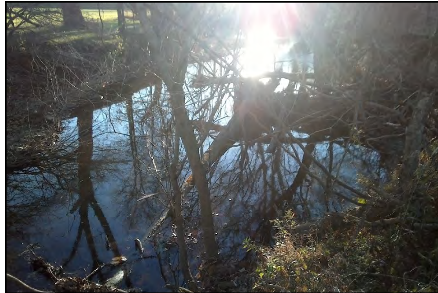
Stream s026, View Looking Downstream