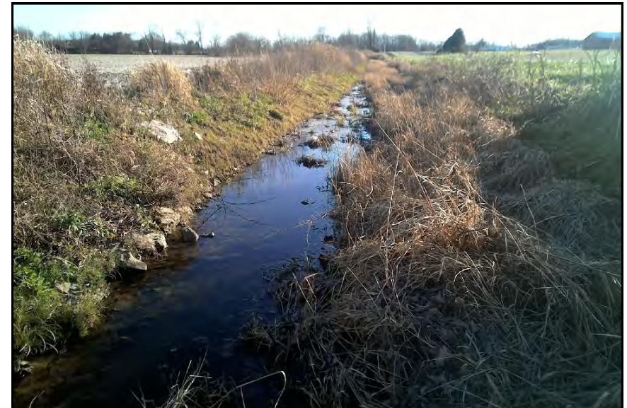
Stream s025, View Looking Downstream