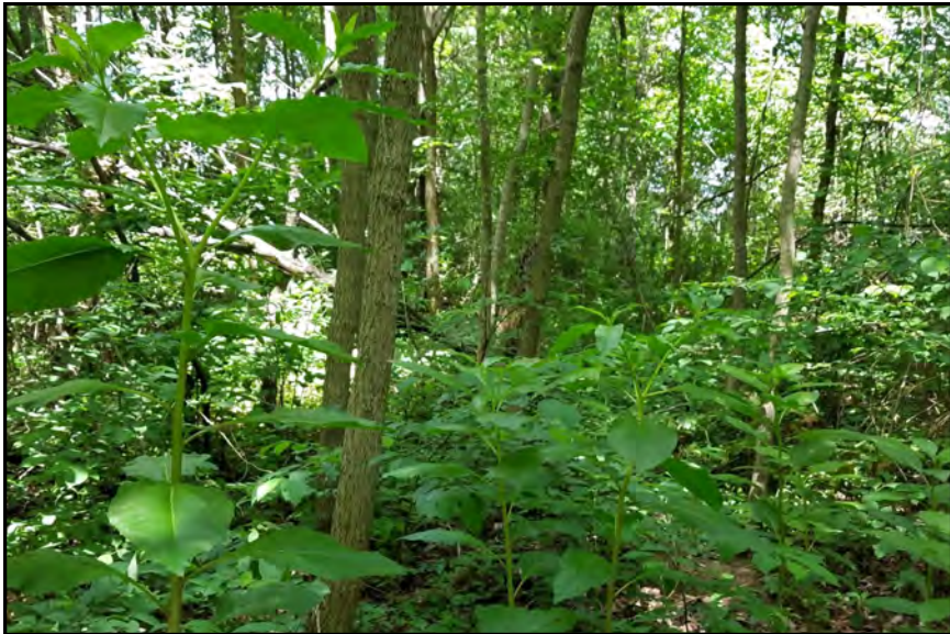
dp612, View Looking North