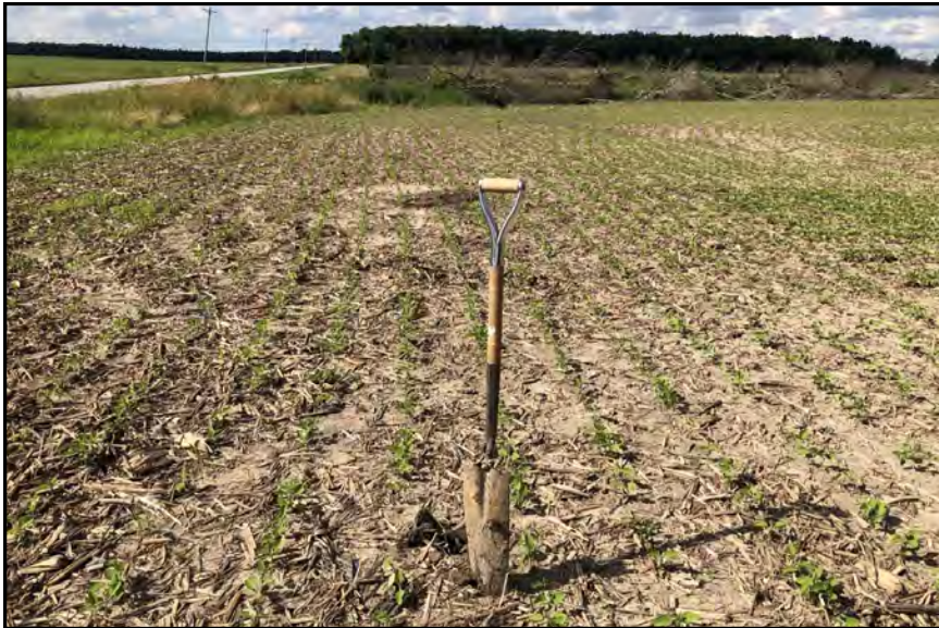
dp719, View Looking North