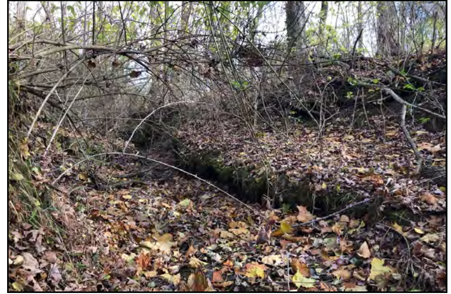
Stream s003, View Looking Downstream