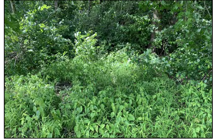
dp705, View Looking South