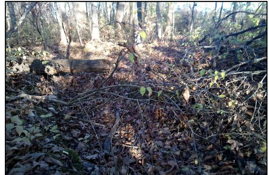
Stream s007, View Looking Downstream