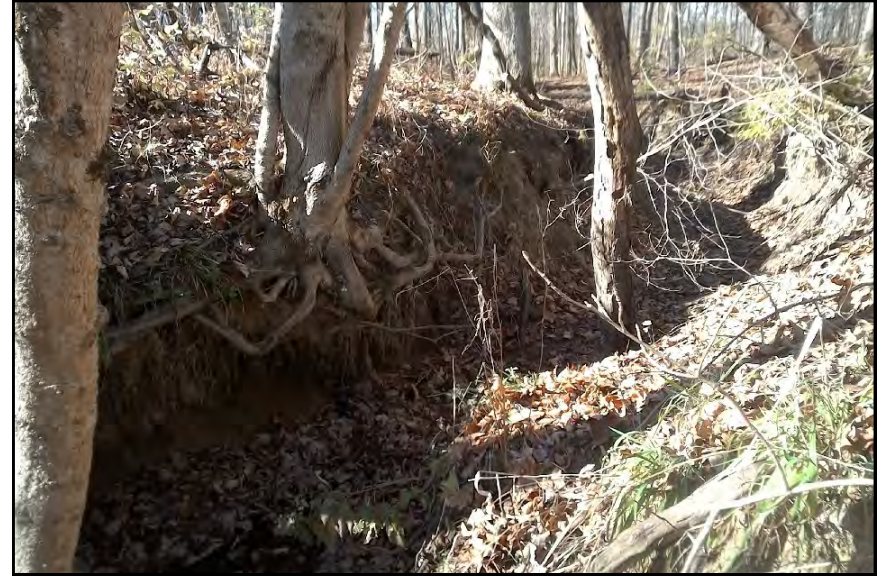
Stream s036, View Looking Downstream