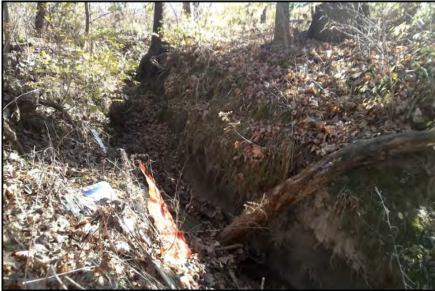
Stream s036, View Looking Upstream