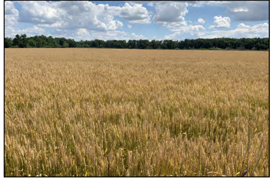
Dp714, View Looking South