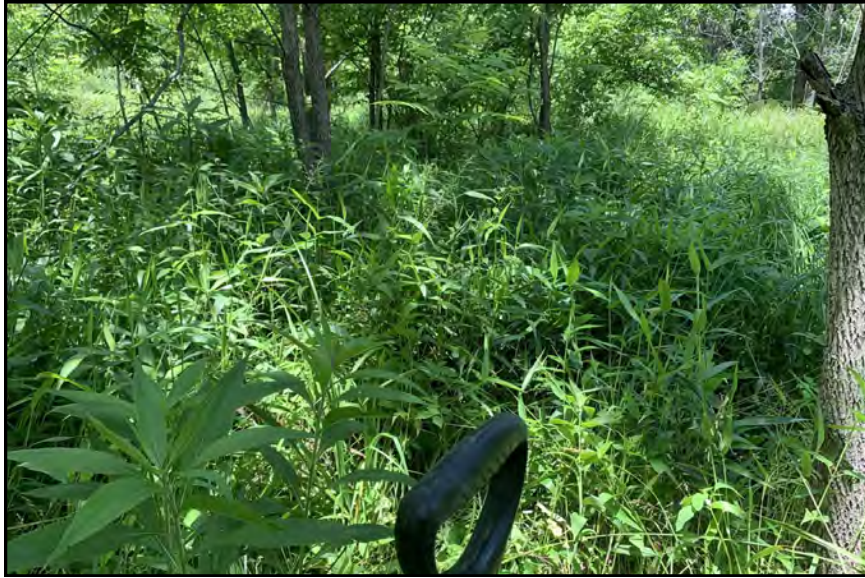
dp710, View Looking North