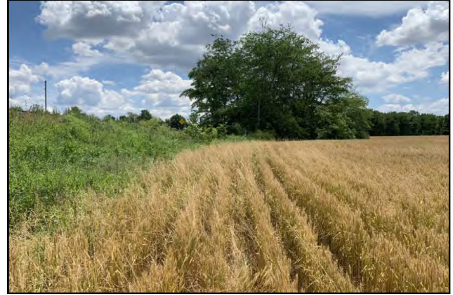
dp711, View Looking South