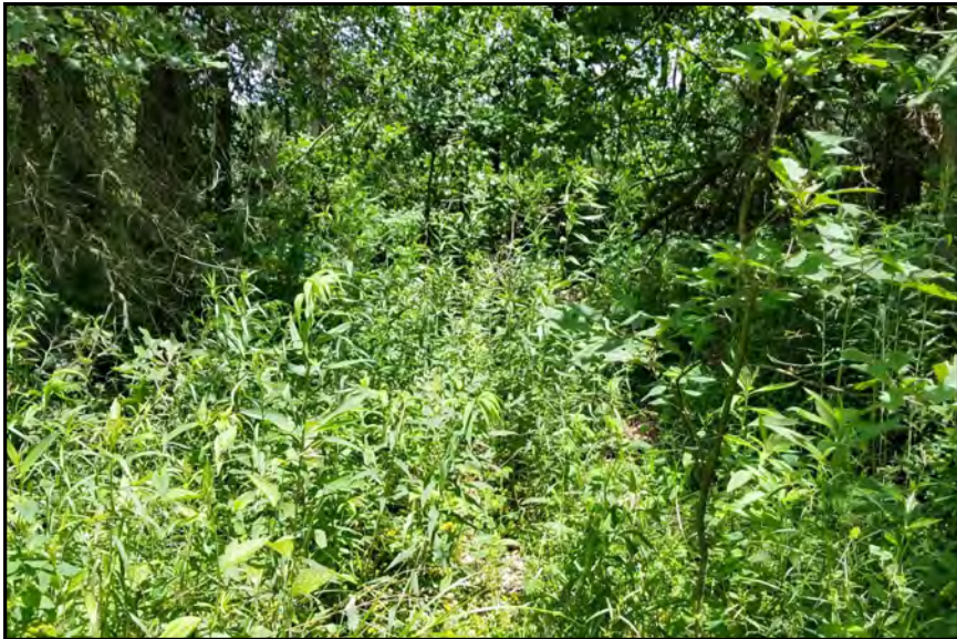
dp606, View Looking North