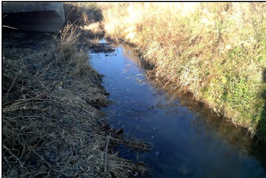
Stream s025, View Looking Upstream