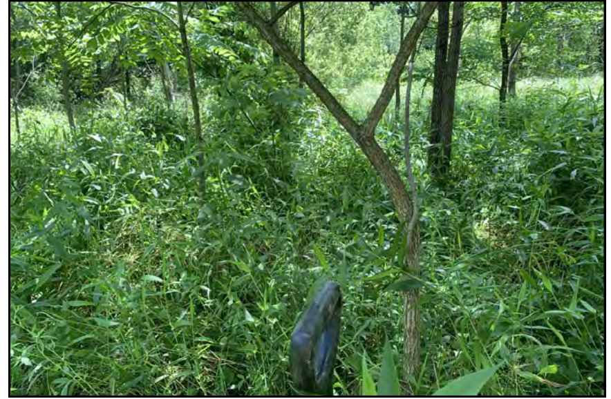
Dp710, View Looking South