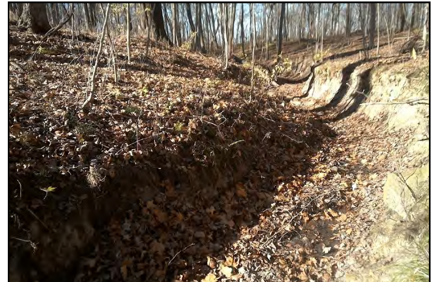
Stream s035, View Looking Downstream