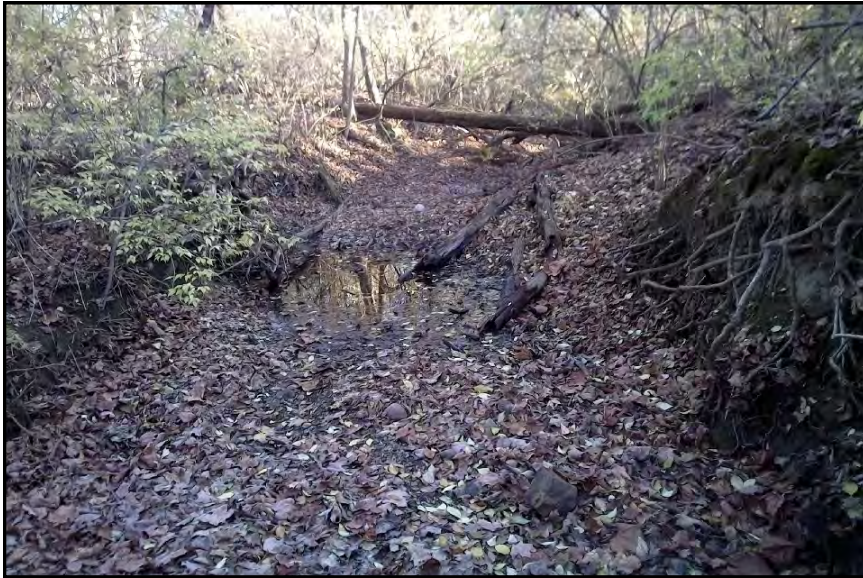
Stream s008, View Looking Upstream