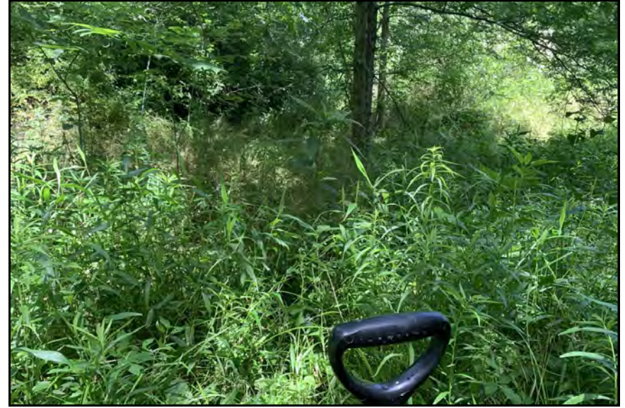
Dp708, View Looking South