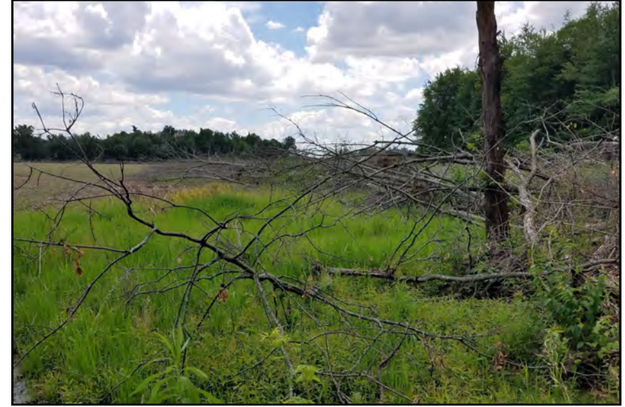
dp610, View Looking South