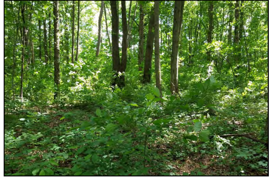
dp615, View Looking South