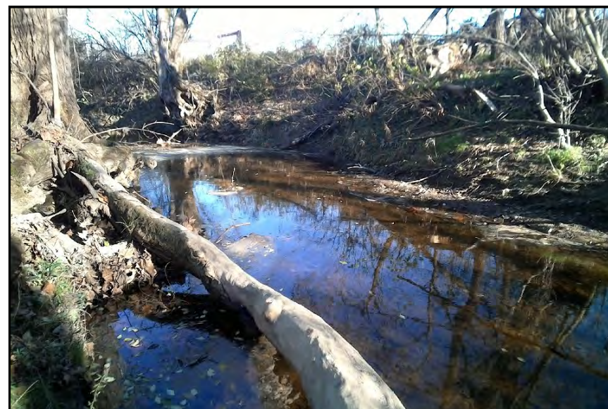
Stream s030, View Looking Downstream