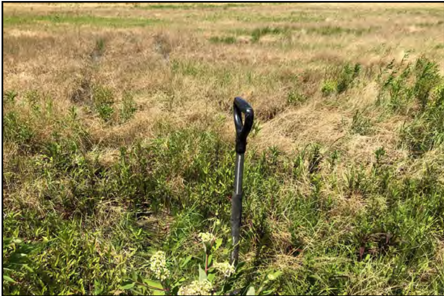
dp715, View Looking North