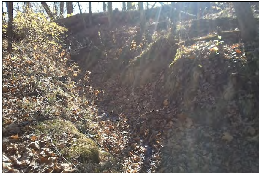
Stream s035, View Looking Upstream