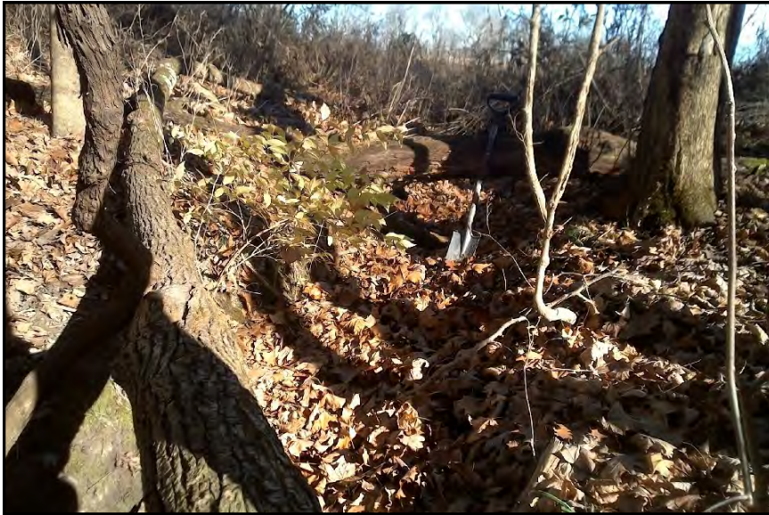
Stream s034, View Looking Upstream