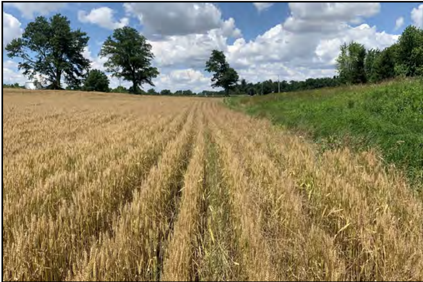
dp711, View Looking North