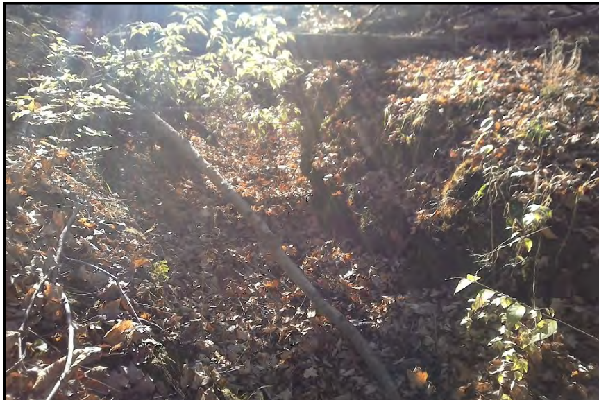
Stream s016, View Looking Upstream