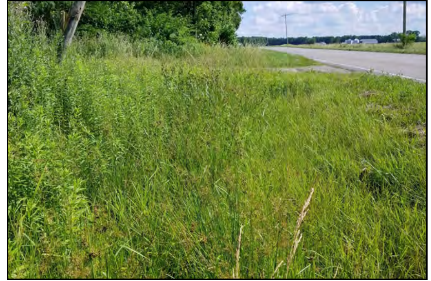
dp619, View Looking South