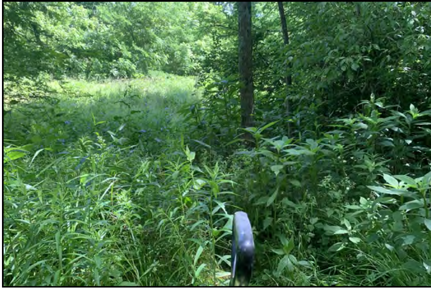
dp708, View Looking North