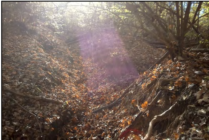
Stream s012, View Looking Upstream