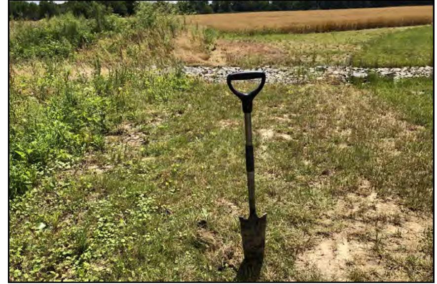
dp713, View Looking South