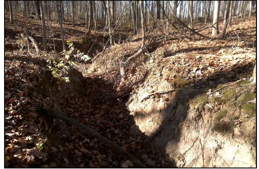
Stream s034, View Looking Downstream