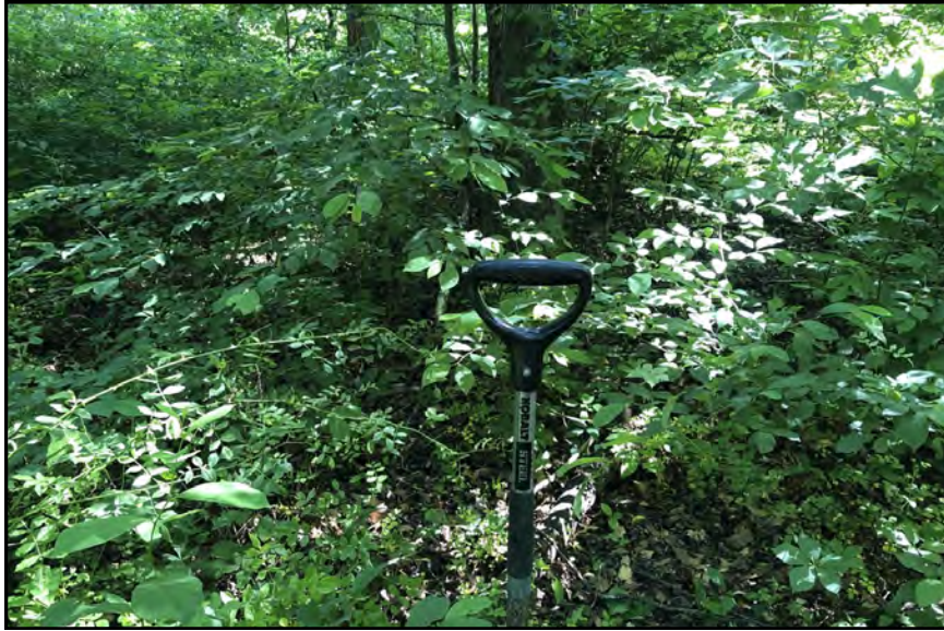
dp702, View Looking North