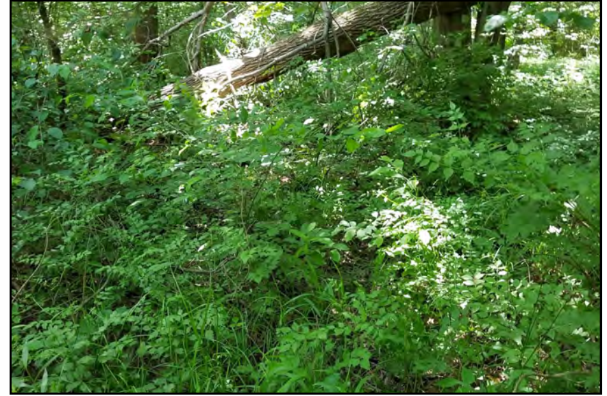
dp613, View Looking South