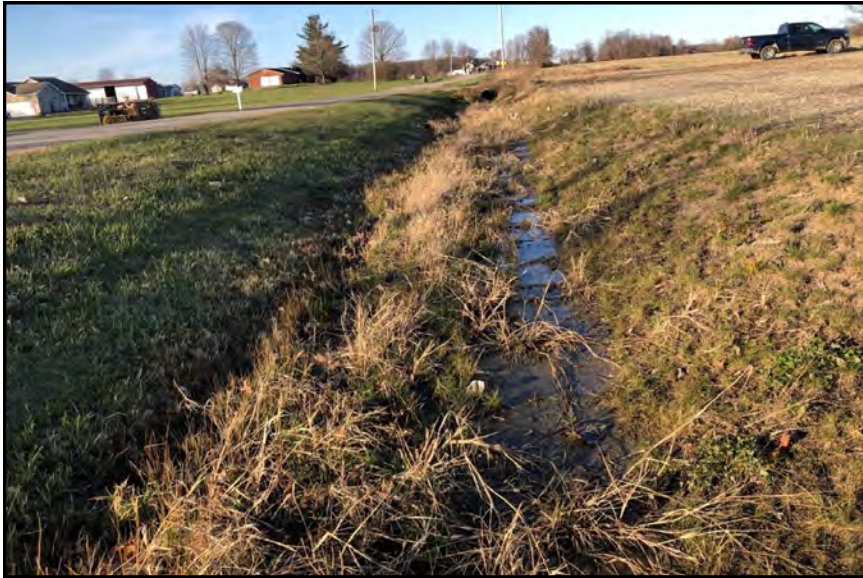
Stream s024, View Looking Upstream