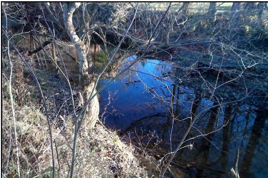
Stream s026, View Looking Upstream