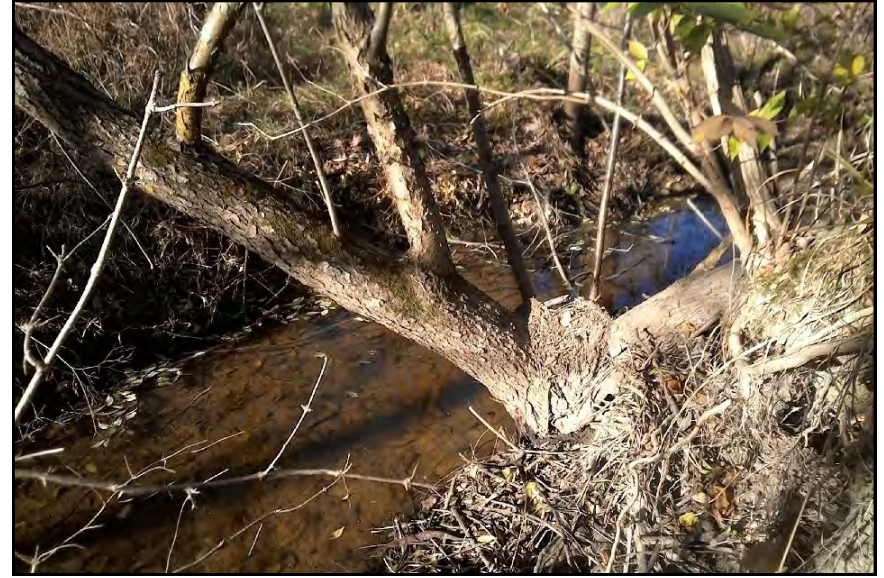
Stream s031, View Looking Downstream