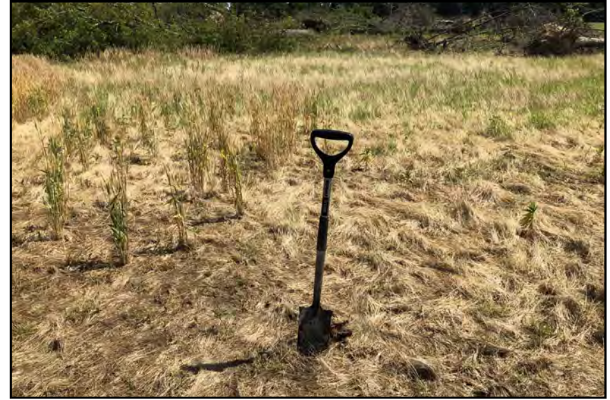
dp717, View Looking South