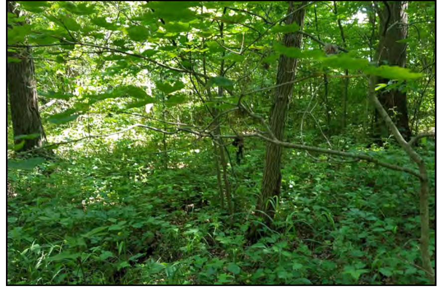
dp617, View Looking South