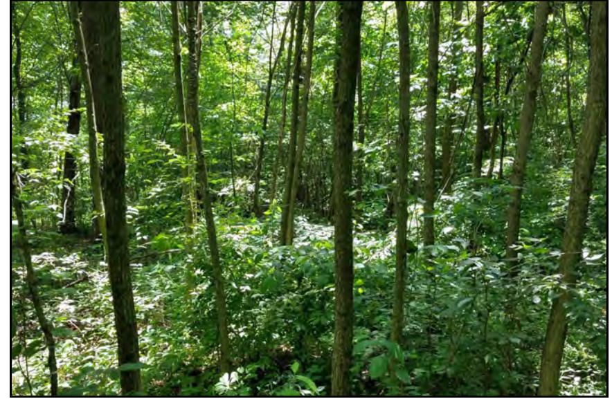
dp612, View Looking South