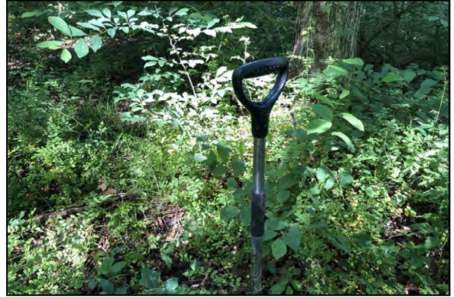
dp702, View Looking South