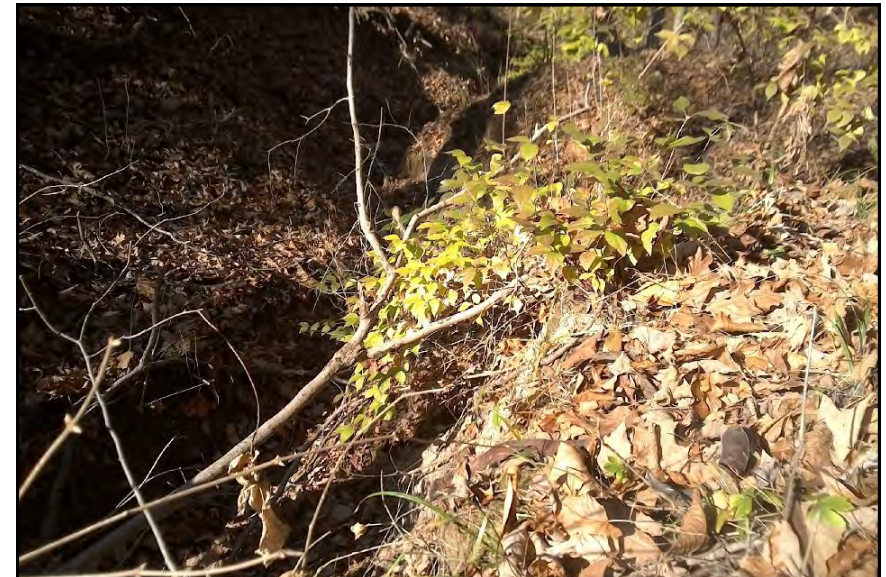
Stream s016, View Looking Downstream