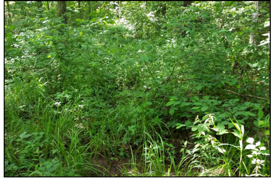
dp605, View Looking South