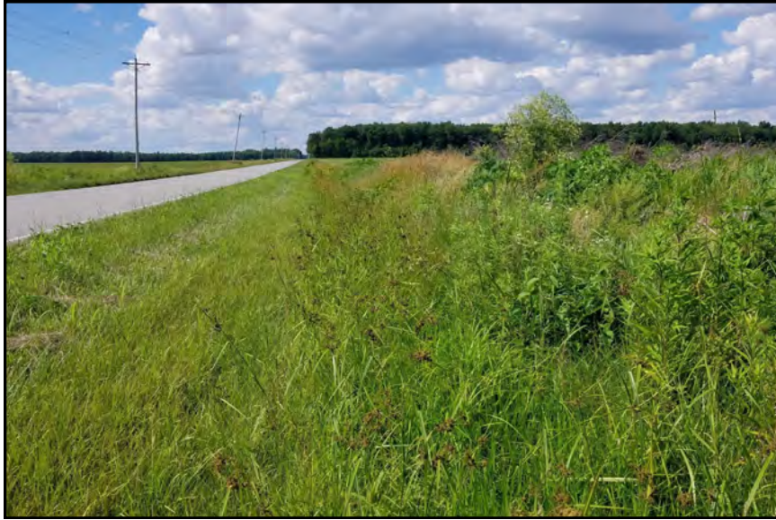
dp619, View Looking North