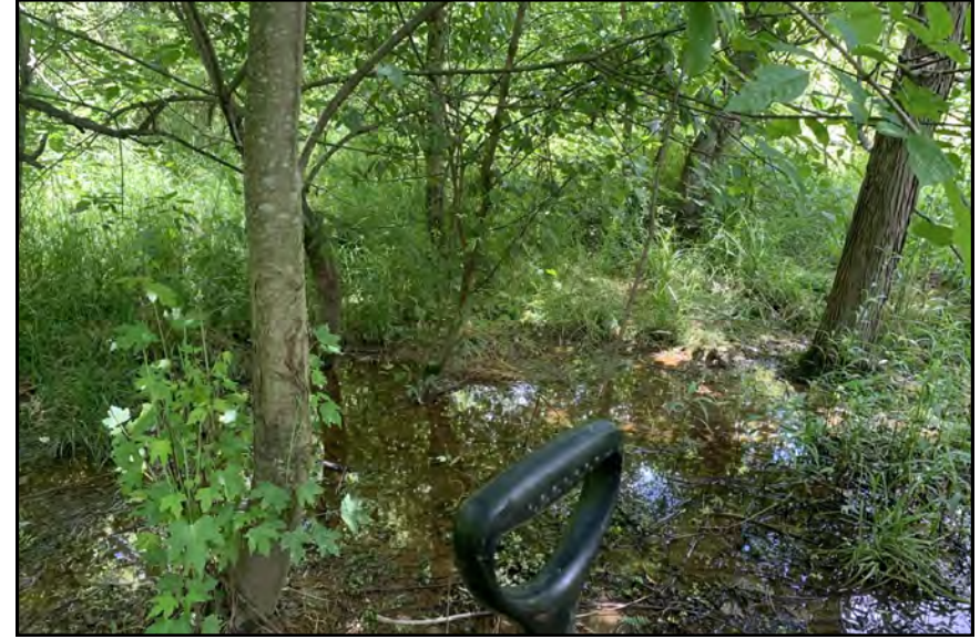
dp709, View Looking South