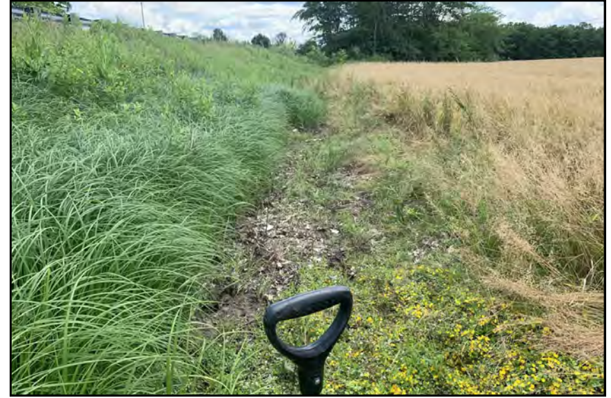
Dp712, View Looking South