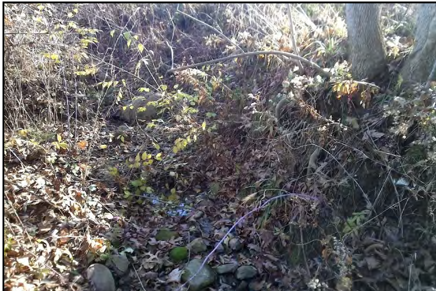
Stream s037, View Looking Upstream