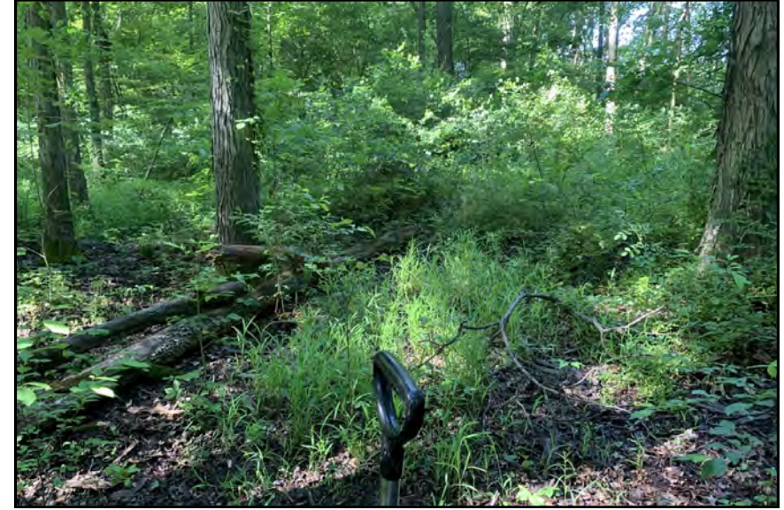
dp701, View Looking South