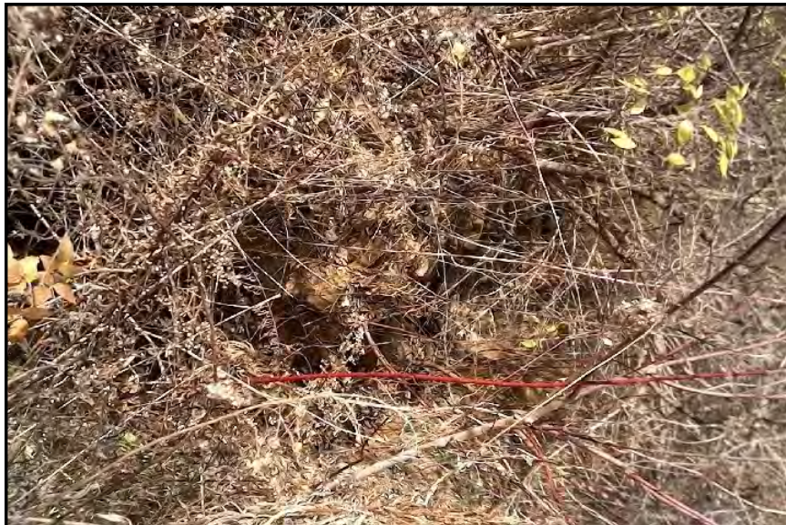
Stream s005, View Looking Upstream