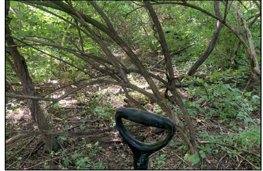
dp707, View Looking South