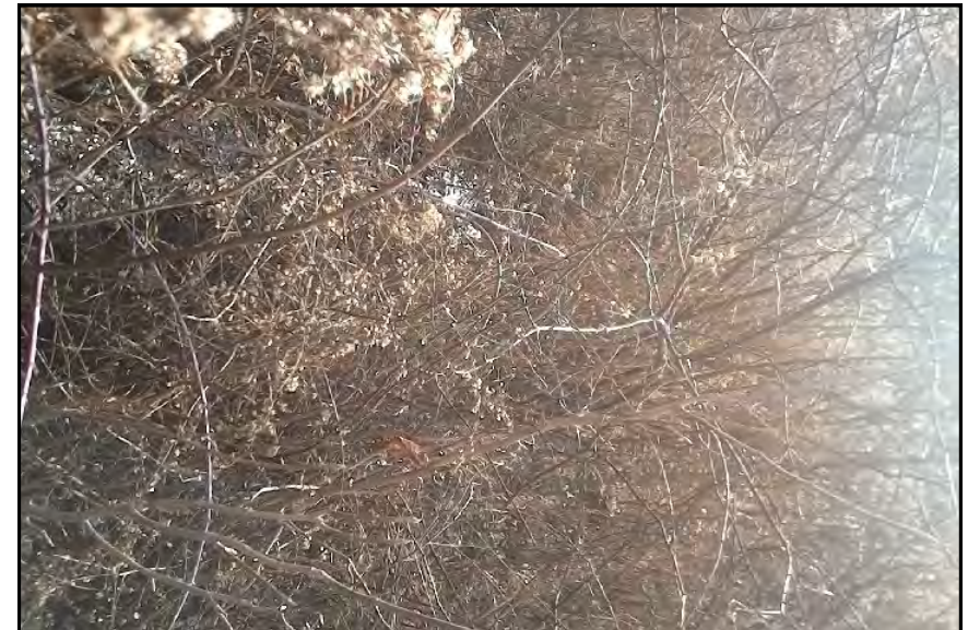
Stream s005, View Looking Downstream