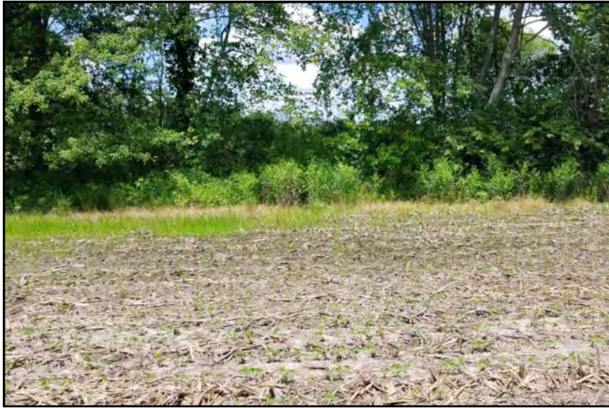
dp609, View Looking North