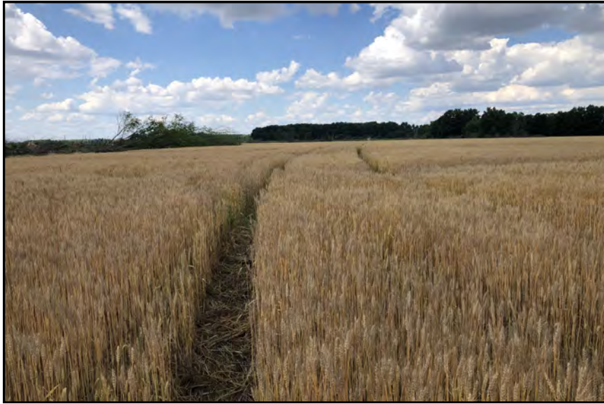
dp716, View Looking North