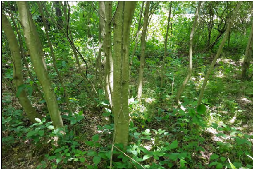
dp608, View Looking North