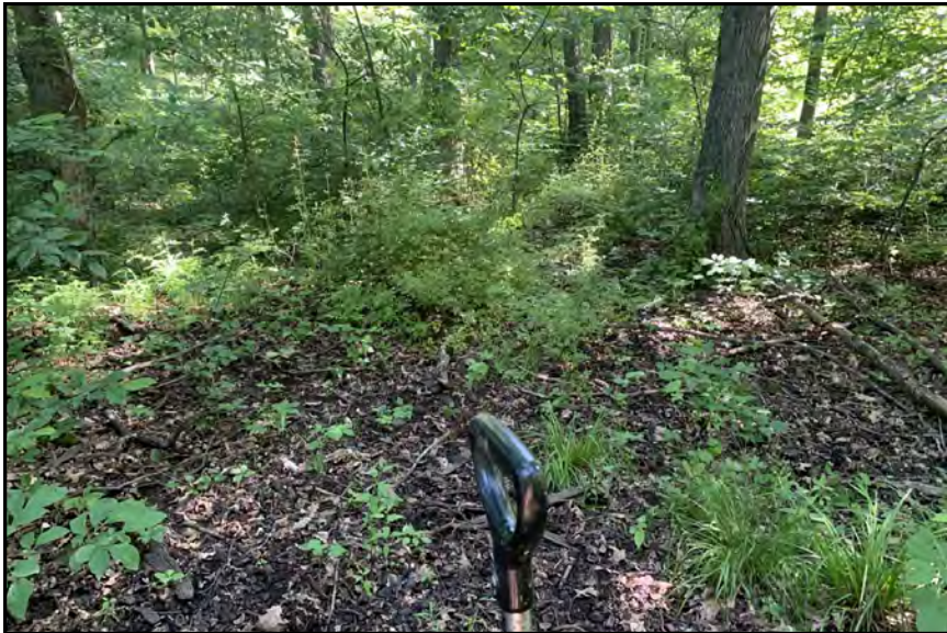
dp701, View Looking North