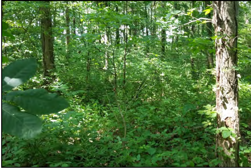
dp617, View Looking North