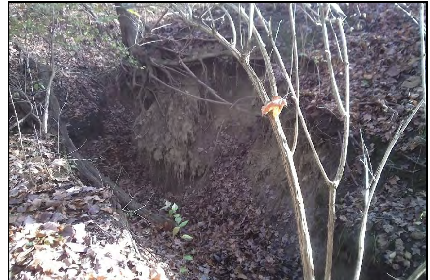
Stream s012, View Looking Downstream