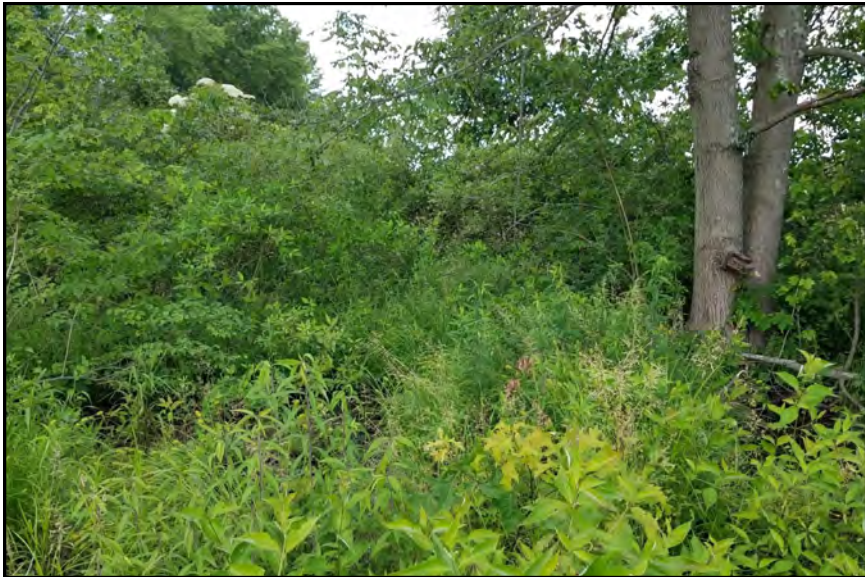
dp610, View Looking North