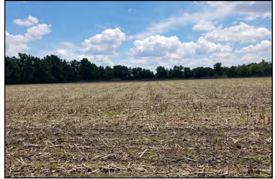
dp609, View Looking South