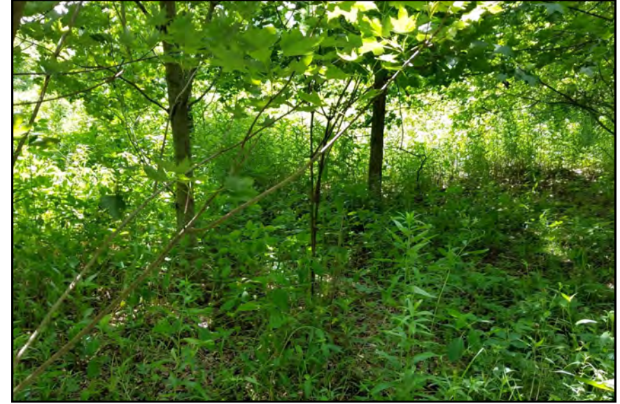
dp608, View Looking South