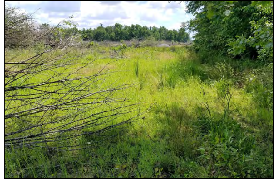
dp611, View Looking South