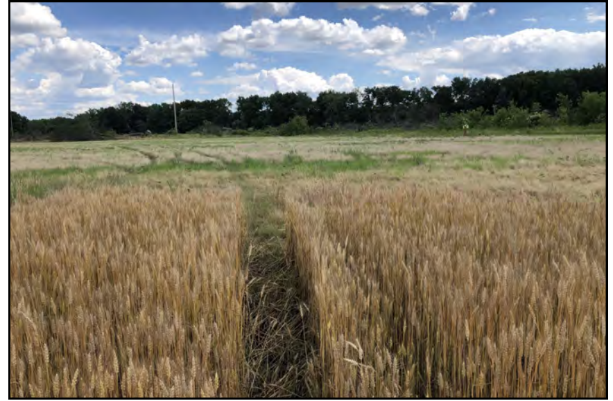
Dp716, View Looking South