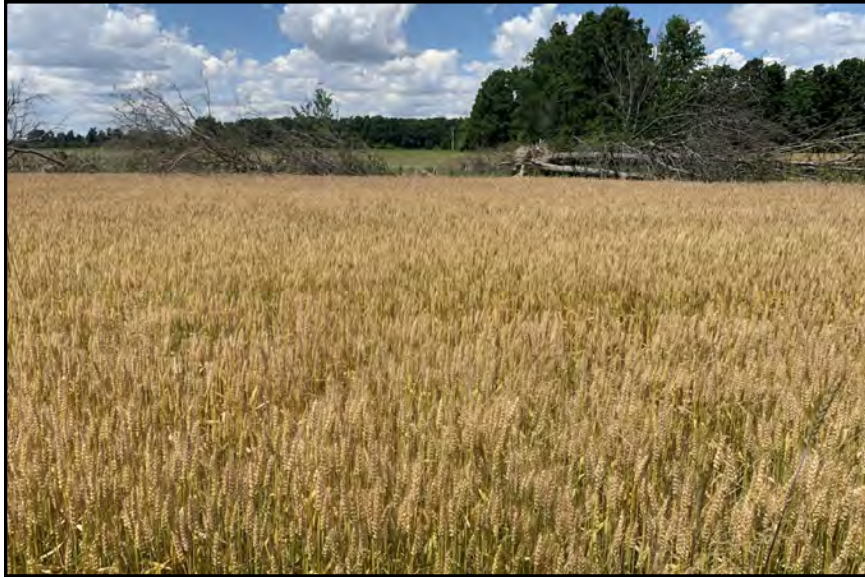
dp714, View Looking North