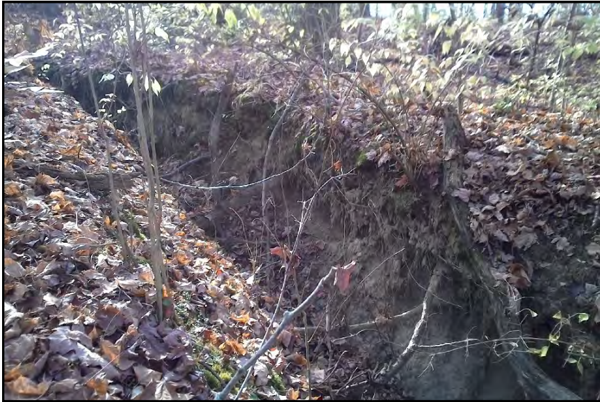
Stream s013, View Looking Upstream