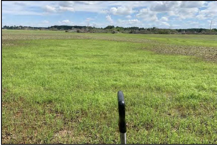
dp706, View Looking North