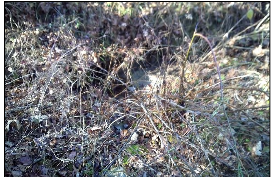
Stream s037, View Looking Downstream