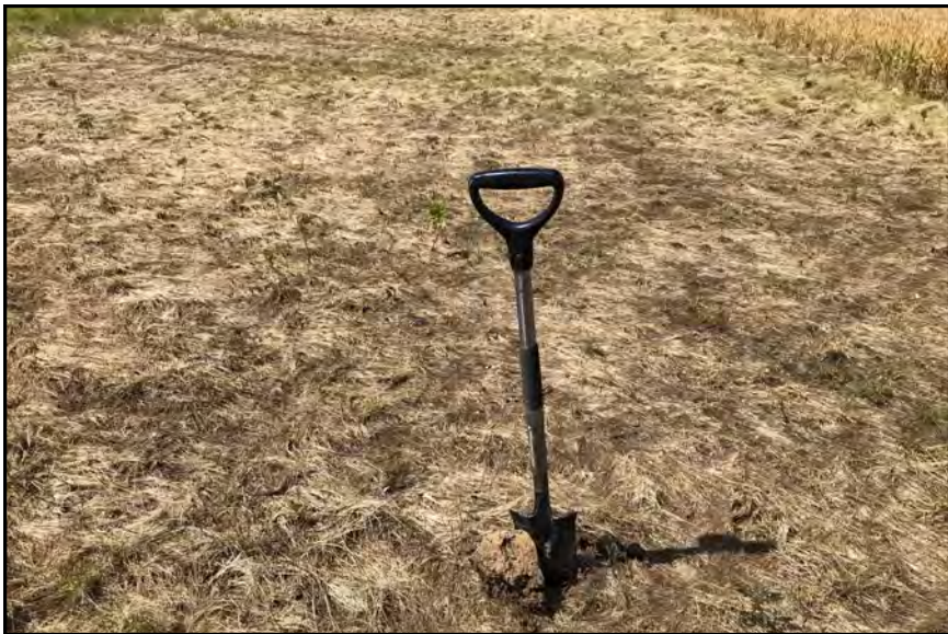
dp717, View Looking North