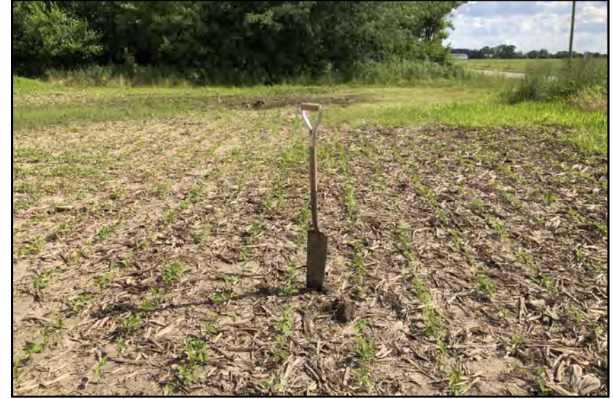
dp719, View Looking South