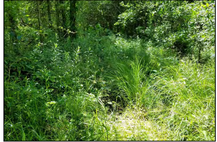
dp606, View Looking South