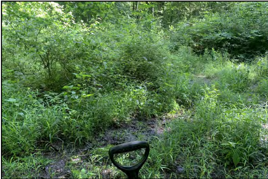
dp703, View Looking North