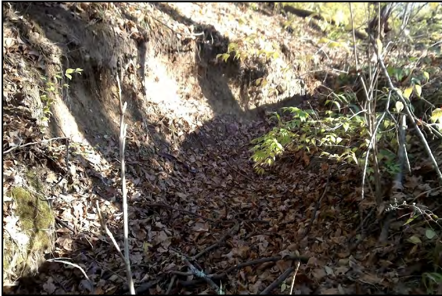
Stream s015, View Looking Upstream