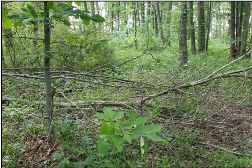
dp616, View Looking North