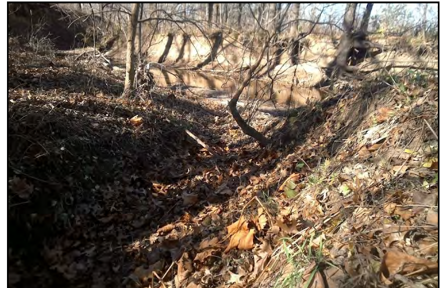
Stream s033, View Looking Downstream