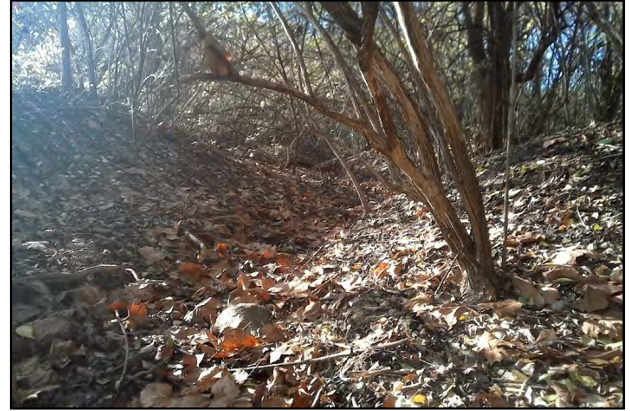
Stream s006, View Looking Downstream