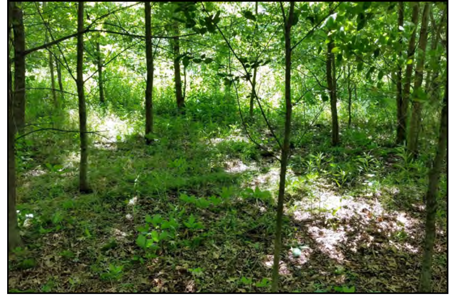
dp607, View Looking South