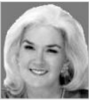
Hints From Heloise Heloise

Dear Heloise: Speaking as someone whose been in business for over 57 years, I have a suggestion if you have a problem with the product or service you received from a small business.