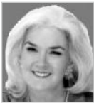
Hints From Heloise Heloise