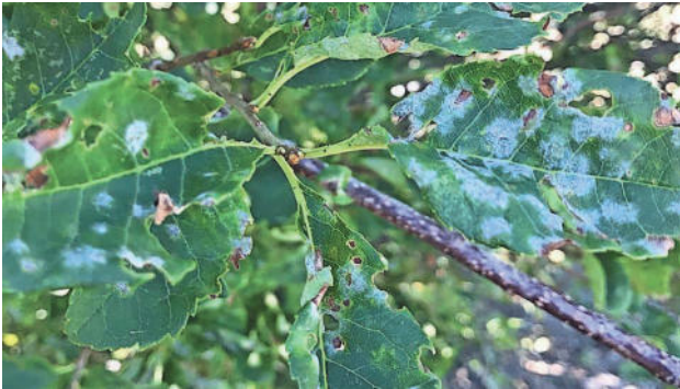
Powdery mildew symptoms on chokecherry leaves in Colfax County, New Mexico. BOE LOPEZ

Now that the growing season is coming to an end and the harvesting is in full swing, look back to correct some of the disease problems in your garden because nothing is more frustrating (for you as a vegetable gardener) than to see the fruits of your labor lost to disease. Diseases occur when environmental conditions are suitable for pathogens to develop on susceptible hosts. Some pathogens can attack all plant parts, whereas others attack only selected area tissues. Many types of organisms cause infectious diseases of plants, but the five major groups of plant pathogens are fungi, water molds, bacteria, viruses, and nematodes. Adverse conditions such as improper soil pH, nutrient deficiencies and toxicities, soil compaction, excess water, herbicide damage and more will affect the plant.