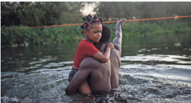
Haitian migrants wade across the Rio Grande from Del Rio, Texas, to return to Ciudad Acuña, Mexico, on Sunday to avoid deportation to Haiti from the U.S.

“We are working around the clock to expeditiously move migrants out of the heat, elements and from un-