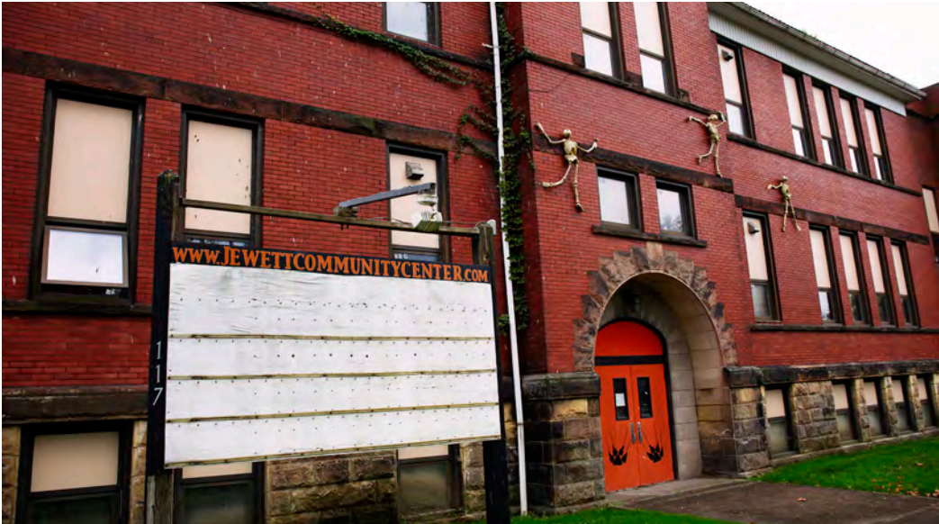
The basement is one of the spookier areas of the tour. But the boiler room specifically was alleged to be the most haunted area. It's not open for the tour, however.