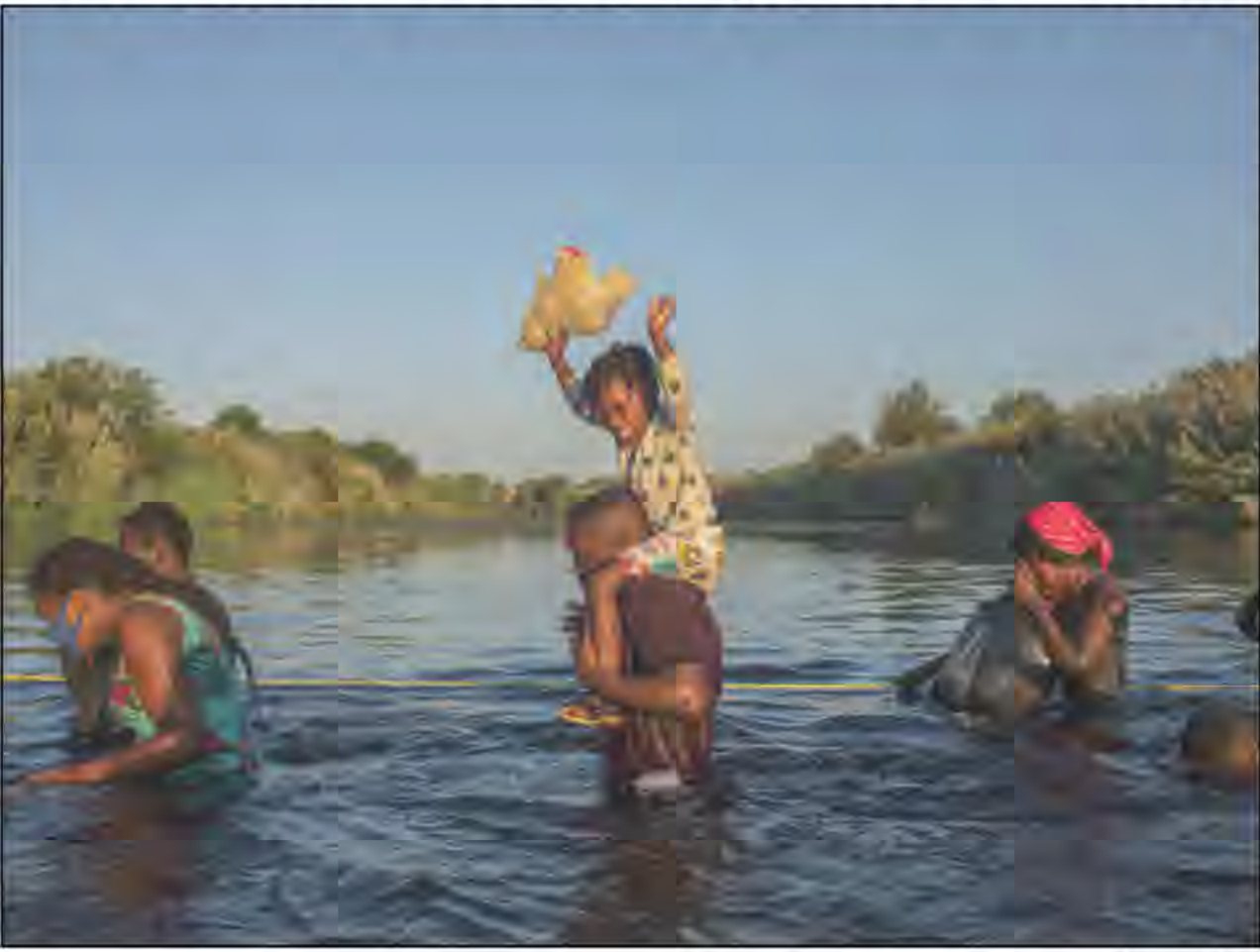
BORDER — A little girl holds her stuffed animal high above the water as migrants, many from Haiti, wade across the Rio Grande river from Del Rio, Texas, to return to Ciudad Acuña, Mexico, Monday, to avoid deportation. The U.S. is flying Haitians camped in a Texas border town back to their homeland and blocking others from crossing the border from Mexico.