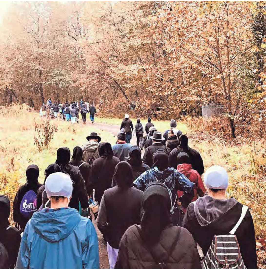
Several walkers took part in past Baby Walks along the Holmes County Trail to benefit the Memory Garden at Pomerene Hospital.