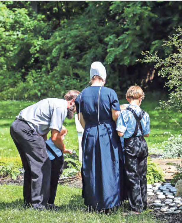
A family leaves a commemorative stone in the Memory Garden at Pomerene Hospital, where the hospital also holds its annual Butterfly Release.