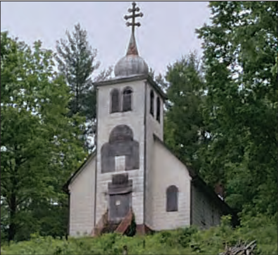
The former Greek/Catholic Church in Belle Valley recently moved up the ladder of accreditation for registration on the National Register of Historic Places. This took place on September 17 at the Ohio Historic Site Preservation Advisory Board's quarterly meeting in Columbus. The Belle Valley Historical Preservation Society should receive final notification of the National Park Service's decision within the next few months.