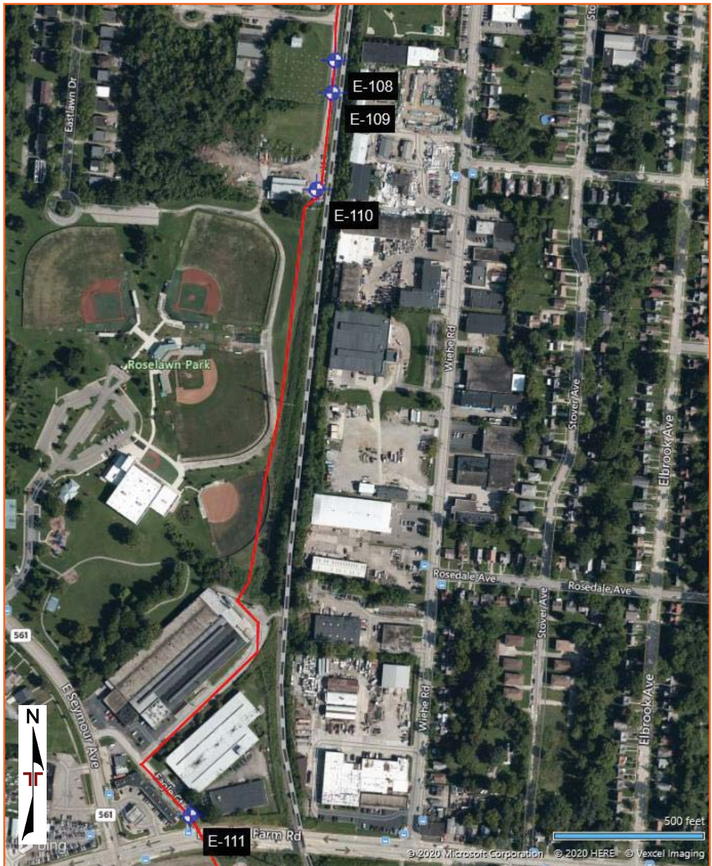
DIAGRAM IS FOR GENERAL LOCATION ONLY, AND IS NOT INTENDED FOR CONSTRUCTION PURPOSES

November 18, 2020 ■ Terracon Project No. N1175384