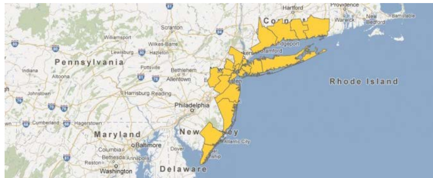
Figure 2. 7 FEMA Disaster Areas

Some commercial and industrial facilities in the area were able to power through Superstorm Sandy due to CHP. This report summarizes how CI facilities with CHP systems operated during this storm. Several examples from other storms and blackout events in other regions of the country are also included. This report also provides information on the use of CHP for reliability purposes, as well as state and local policies designed to promote CHP in CI applications.