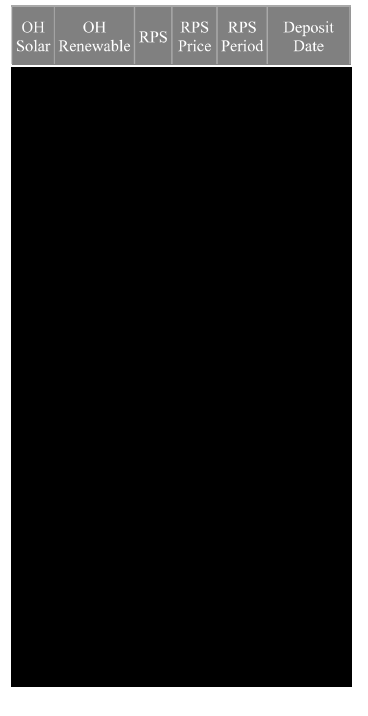
Xoom Energy, LLC - Subaccount Details - OH - Jan 2019 - Dec 2019