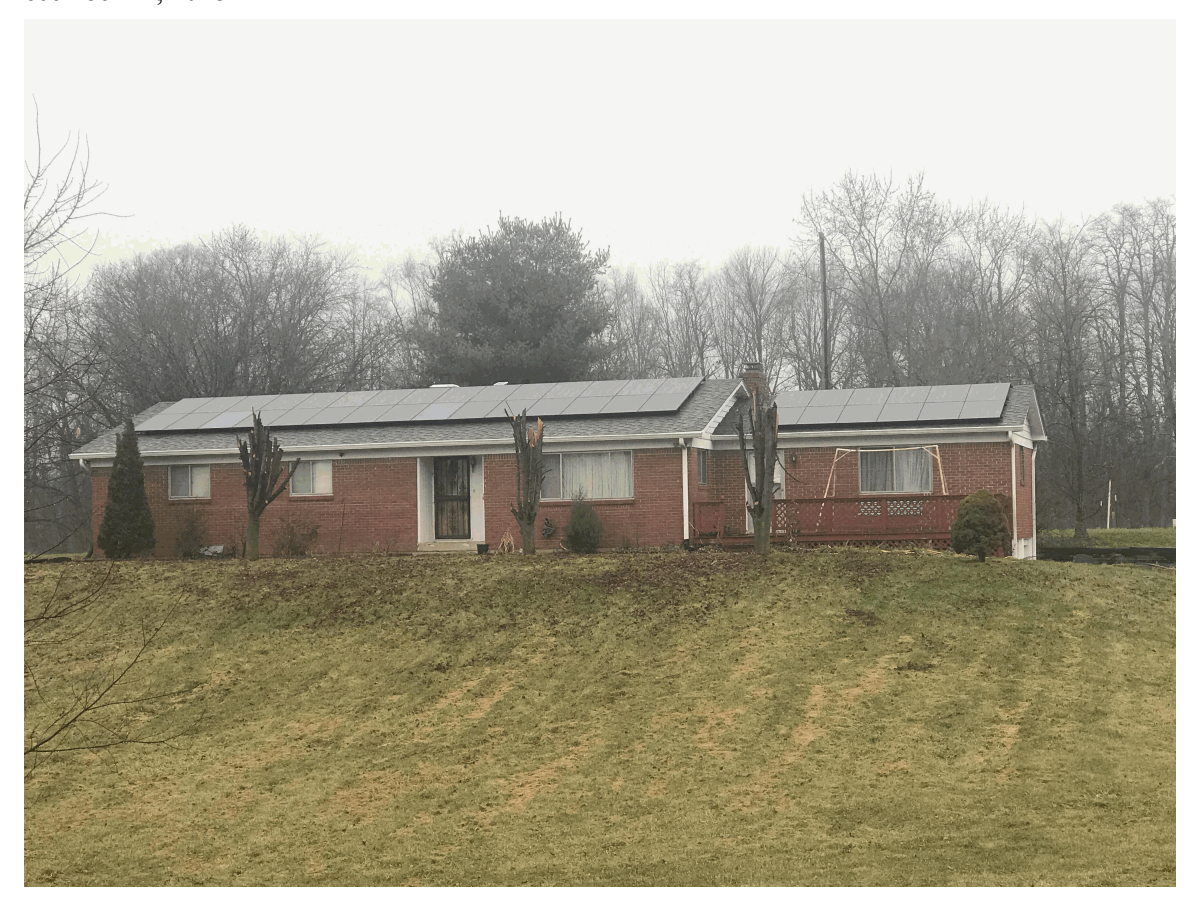
The Applicant is applying for certification in Ohio for a facility using one of the following qualified resources or technologies (Sec. 4928.01 ORC):