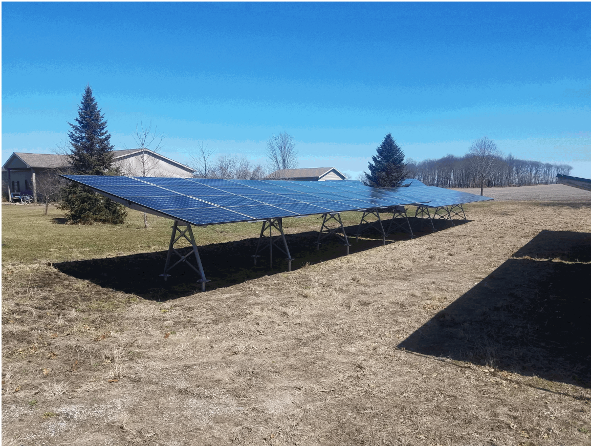
March 26, 2019