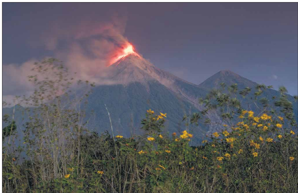
Guatemala’s Volcan de Fuego, or Volcano of Fire, spews hot molten lava from its crater early Monday. Authorities have asked several communities to evacuate. Hundreds are still missing after a deadly eruption devastated the region in June.