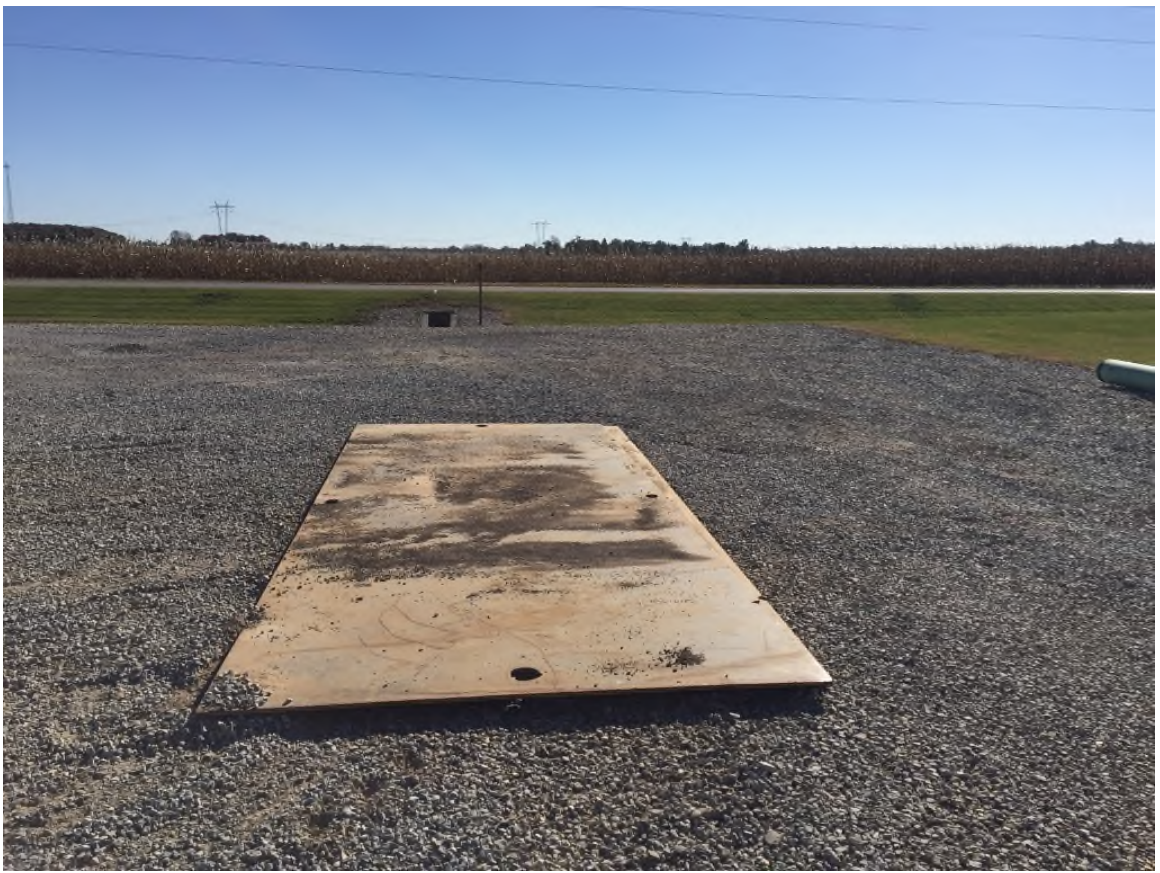
Representative view of gravel staging area facing east