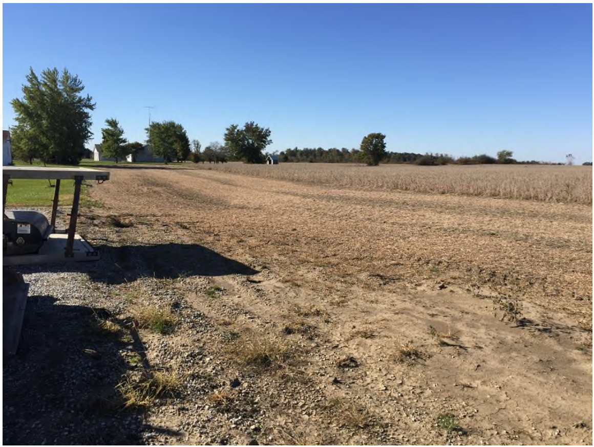
Representative view of gravel staging area facing south

No environmental resources were observed nearby. Depending on the frequency of use of this pipeyard, gravel topdressing may be needed to minimize sediment tracking throughout the duration of use. As long as typical best management practices ("BMPs") such as street cleaning/gravel topdressing and sediment control devices at stockpiled material are utilized, no environmental issues are expected.