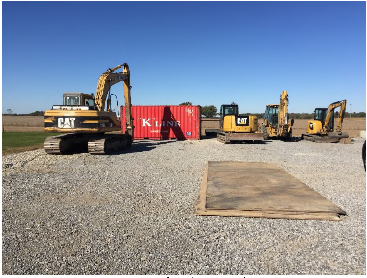
Representative view of gravel staging area facing west