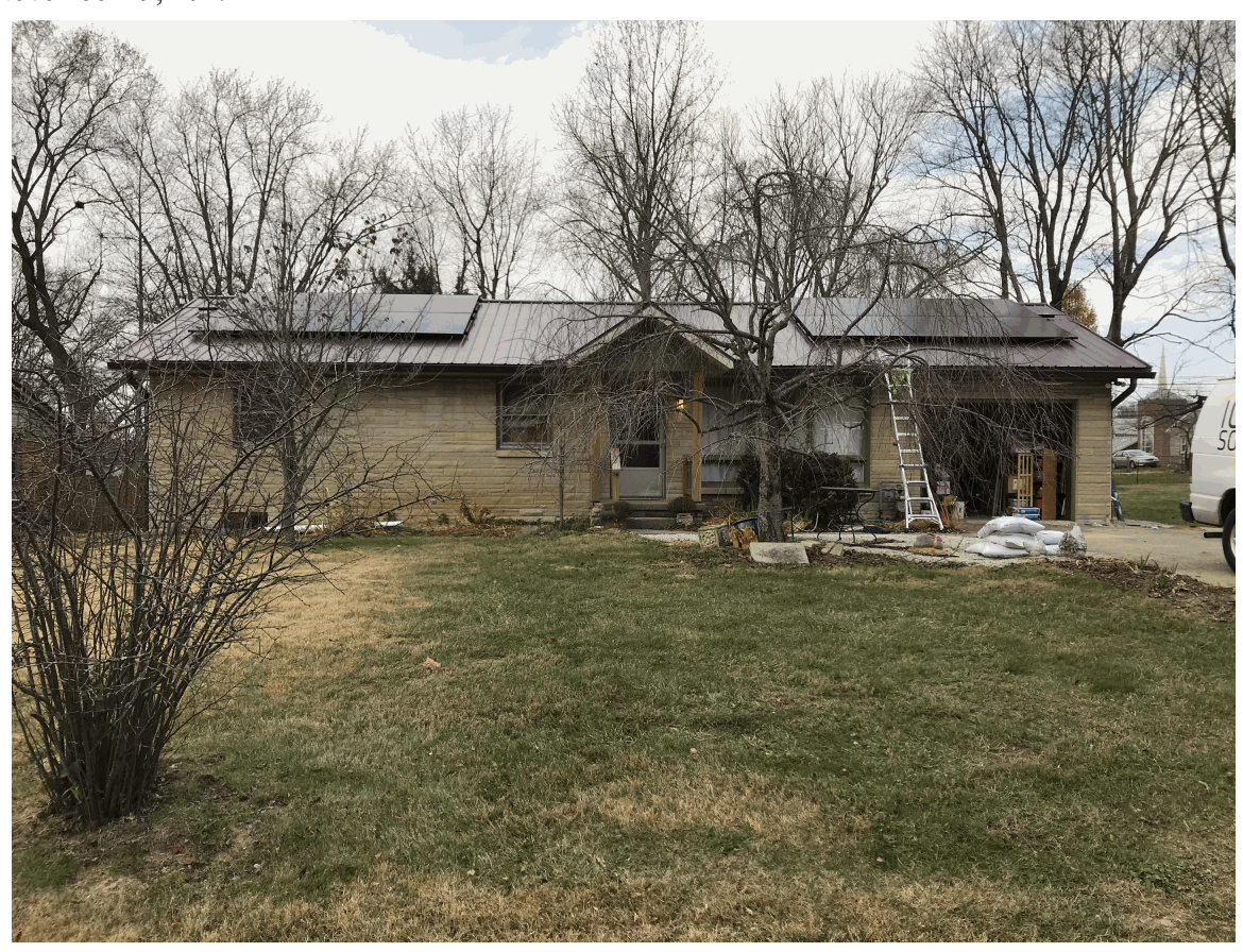
The Applicant is applying for certification in Ohio for a facility using one of the following qualified resources or technologies (Sec. 4928.01 ORC):