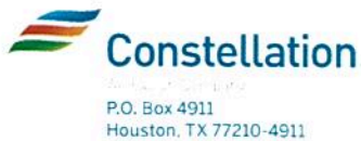
Exhibit B-4 "Opt Out Notice"