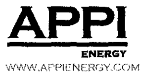
Exhibit C-1 "Annual Reports"

N/A – Affiliated Power Purchasers Int'l LLC is not a publicly traded company.