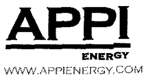
Exhibit D-1 "Operations"

Affiliated Power Purchasers Int'l LLC analyzes customer data, prepares requests for pricing proposal, and negotiates contracts with the suppliers on behalf of the customers. If the customer signs an APPI negotiated contract with a competitive retail supplier, APPI receives a fee based on customer's usage. The customer is billed by the supplier or its utility. The supplier remits APPI's fee payments to APPI. APPI never buys or sells electricity or natural gas. APPI never receives or processes customer payments for energy.