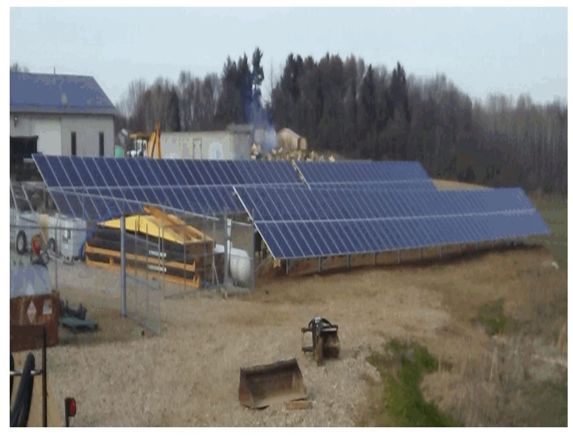
March 23, 2018

The Applicant is applying for certification in Ohio for a facility using one of the following qualified resources or technologies (Sec. 4928.01 ORC):