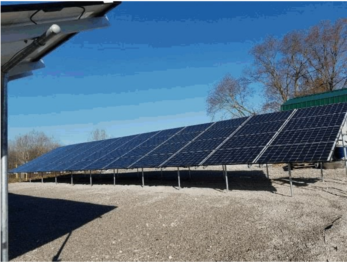
March 08, 2018