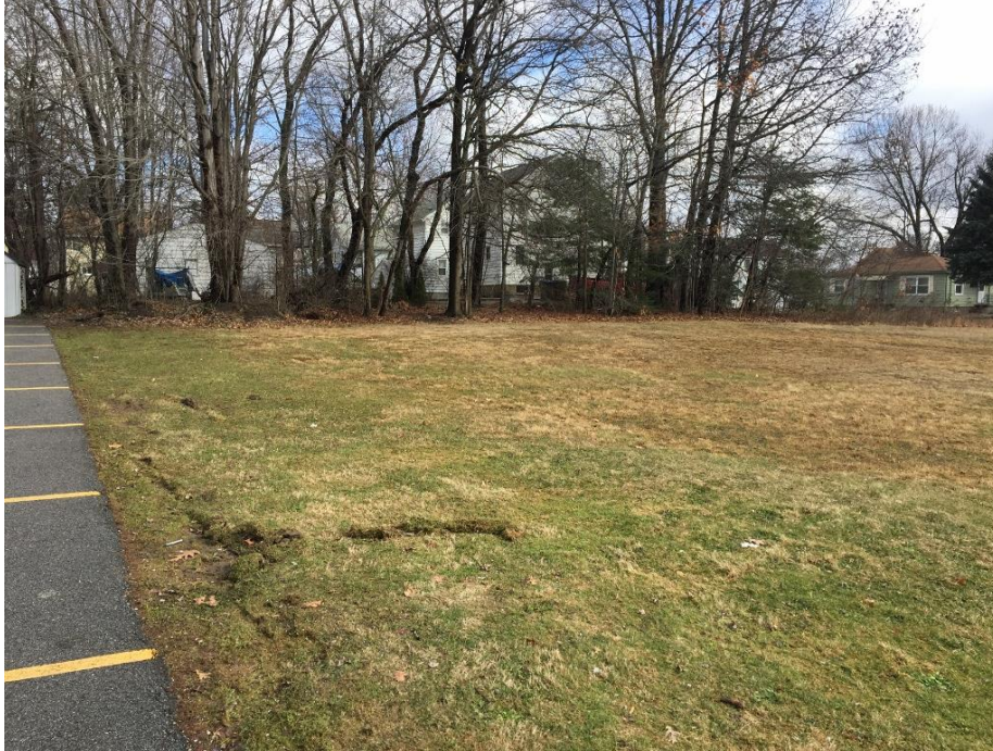
Vacant lot at Italian American Club (Facing East)