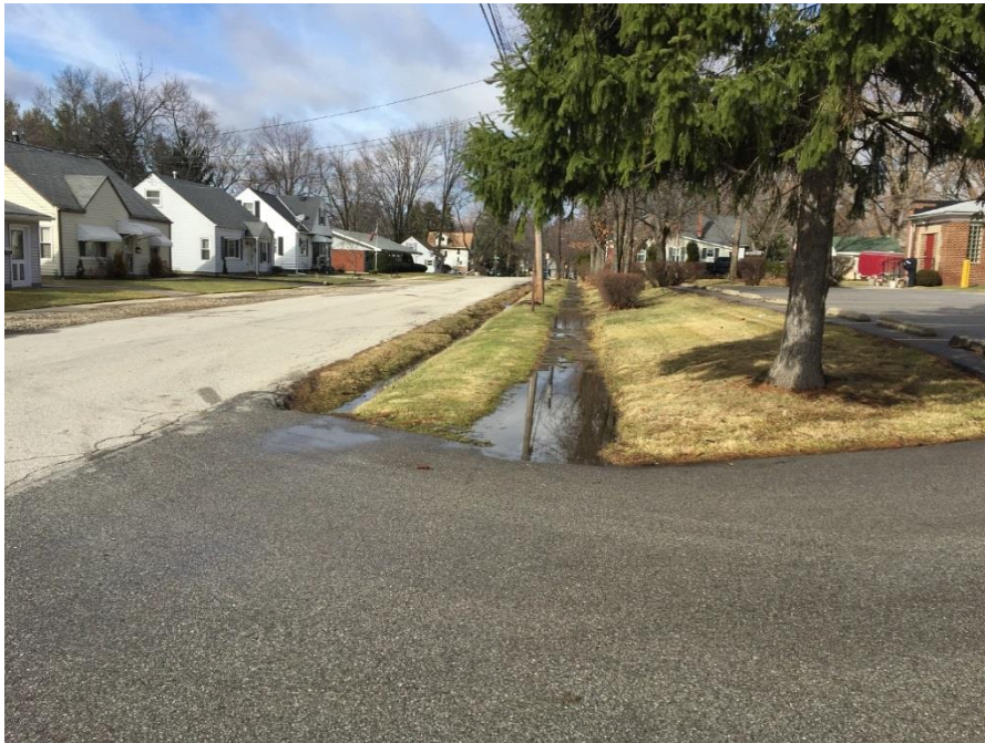
Culvert to be protected at entrance to Italian American Club (Facing North)