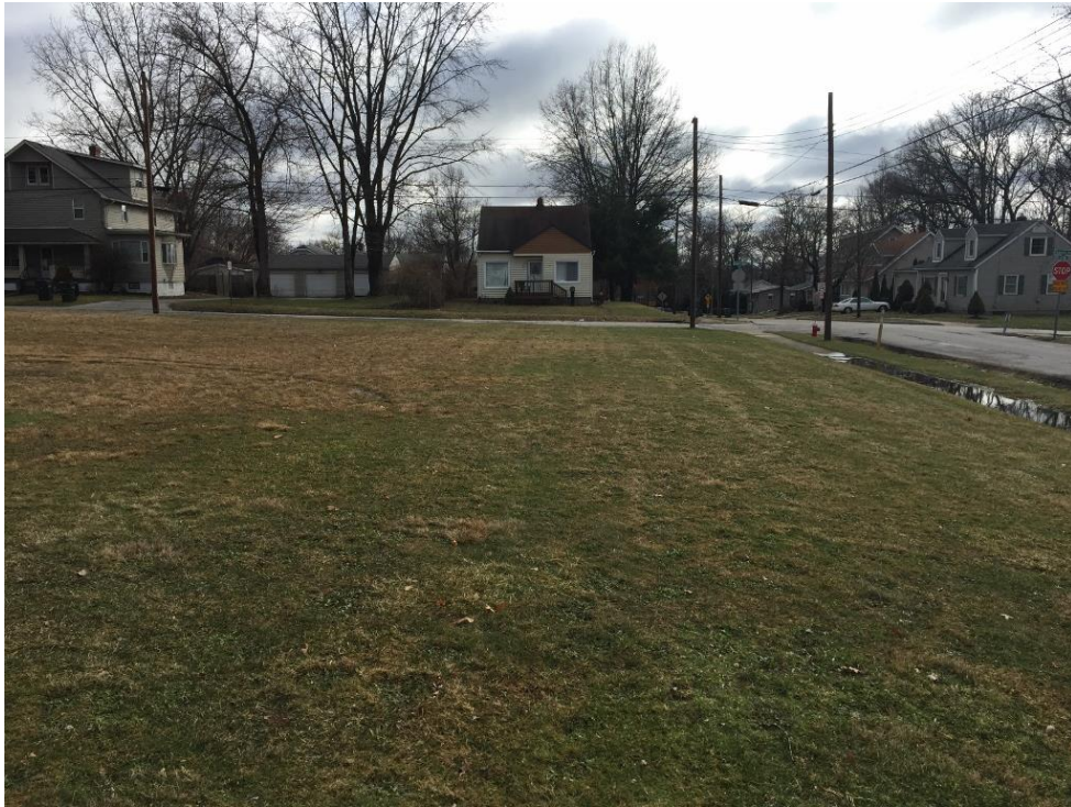
Vacant lot at Italian American Club (Facing South)