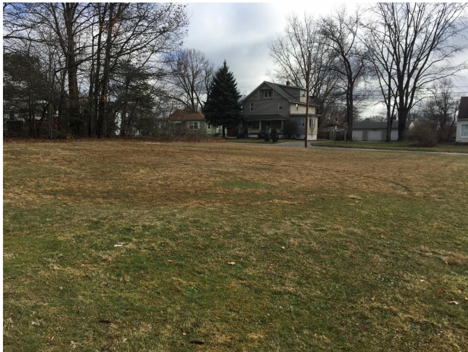
Vacant lot at Italian American Club (Facing Southeast)