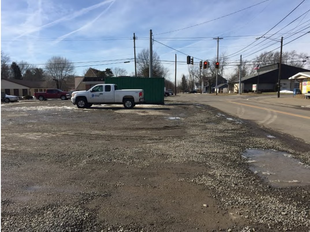
Entrance to pipeyard on 17th Street (facing west)