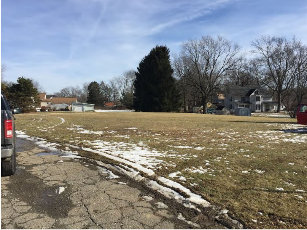
Vegetated lot surrounding pipeyard (facing SE)