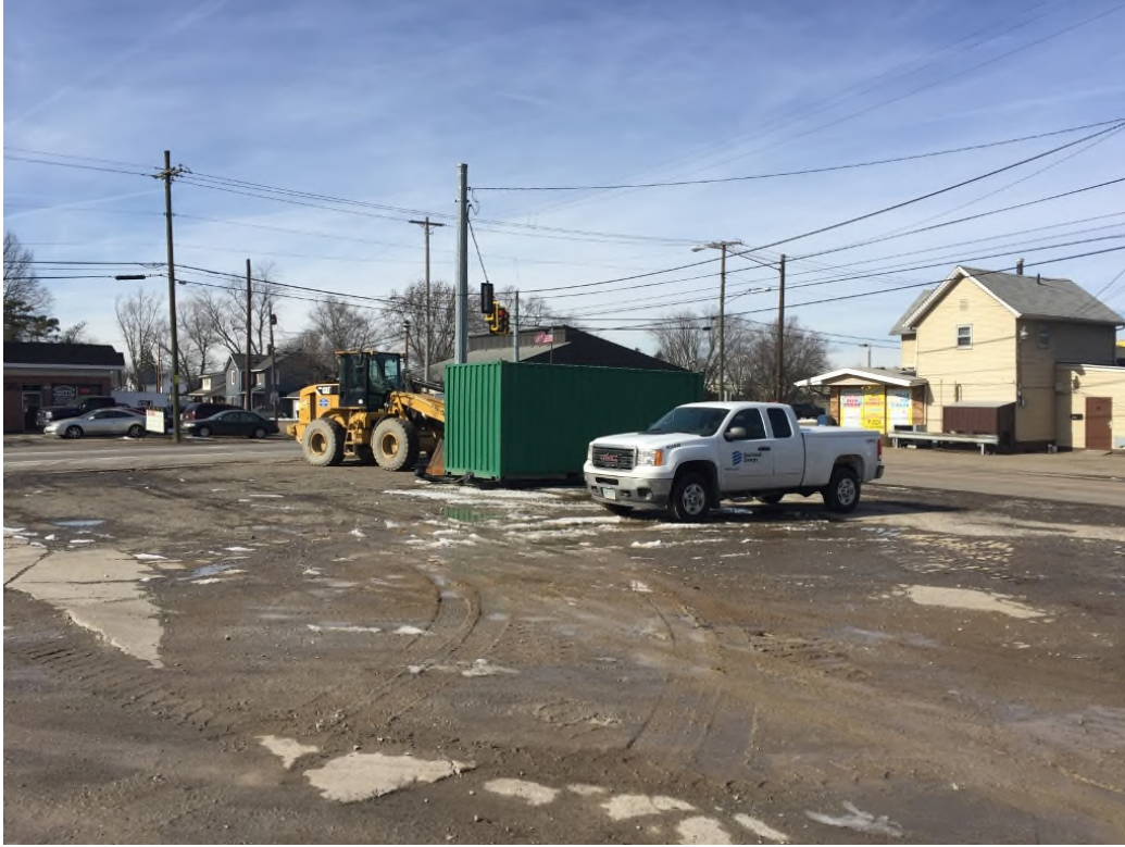
Representative photo of pipeyard location (facing NW)

Street cleaning will be recommended as needed and gravel topdressing will likely be needed throughout construction as conditions require. There are 3 inlets surrounding the pipeyard and will need protected during use of the yard if stockpiled material is stored in the yard or if the vegetated buffer adjacent to the yard is disturbed. As long as typical BMPs (street cleaning, gravel topdressing, and sediment control devices) are utilized, no environmental issues are expected.