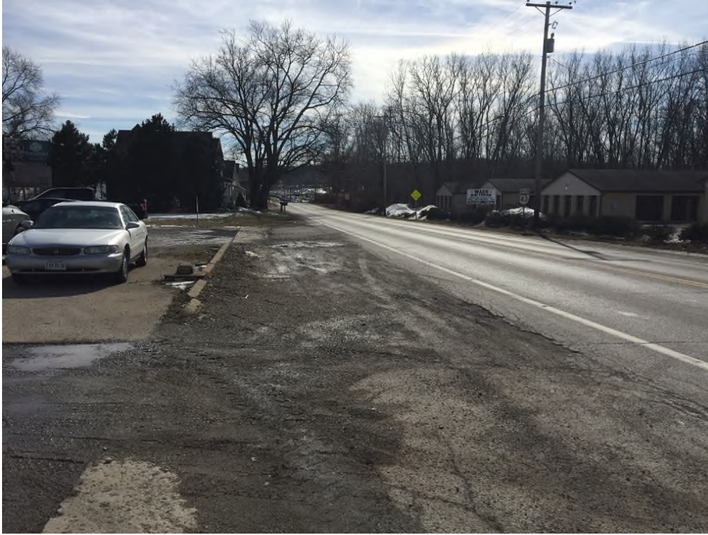
Entrance to pipeyard on S.R. 43 (facing south)