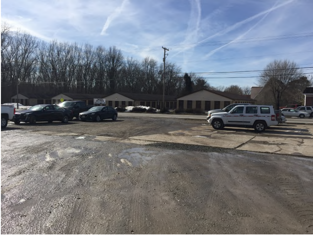
Representative photo of pre-existing gravel and cement lot (facing SW)