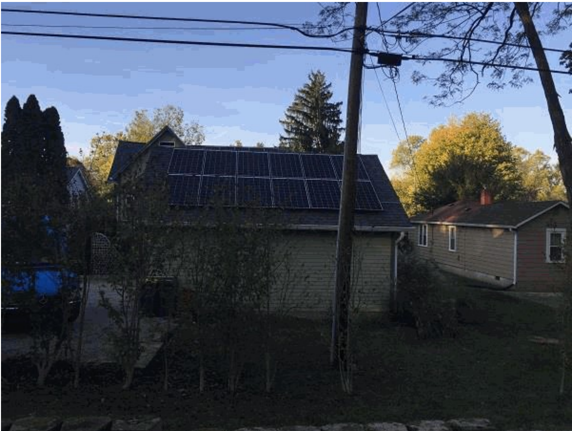
January 19, 2018