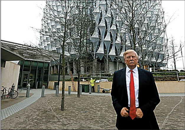
The Madame Tussauds wax figure of US President Donald Trump is seen outside the new US Embassy in Nine Elms in London, Friday, Jan. 12, 2018. President Donald Trump says he canceled upcoming trip to London because he doesn't like the choice of a new embassy.

citizens and our British neighbors," he wrote in an article for London's Evening Standard newspaper. Johnson, a Trump appointee, also said the new embassy was entirely paid for by the sale of other London properties and "did not cost the U.S. taxpayer a cent." A Trump visit has been on the cards since British Prime