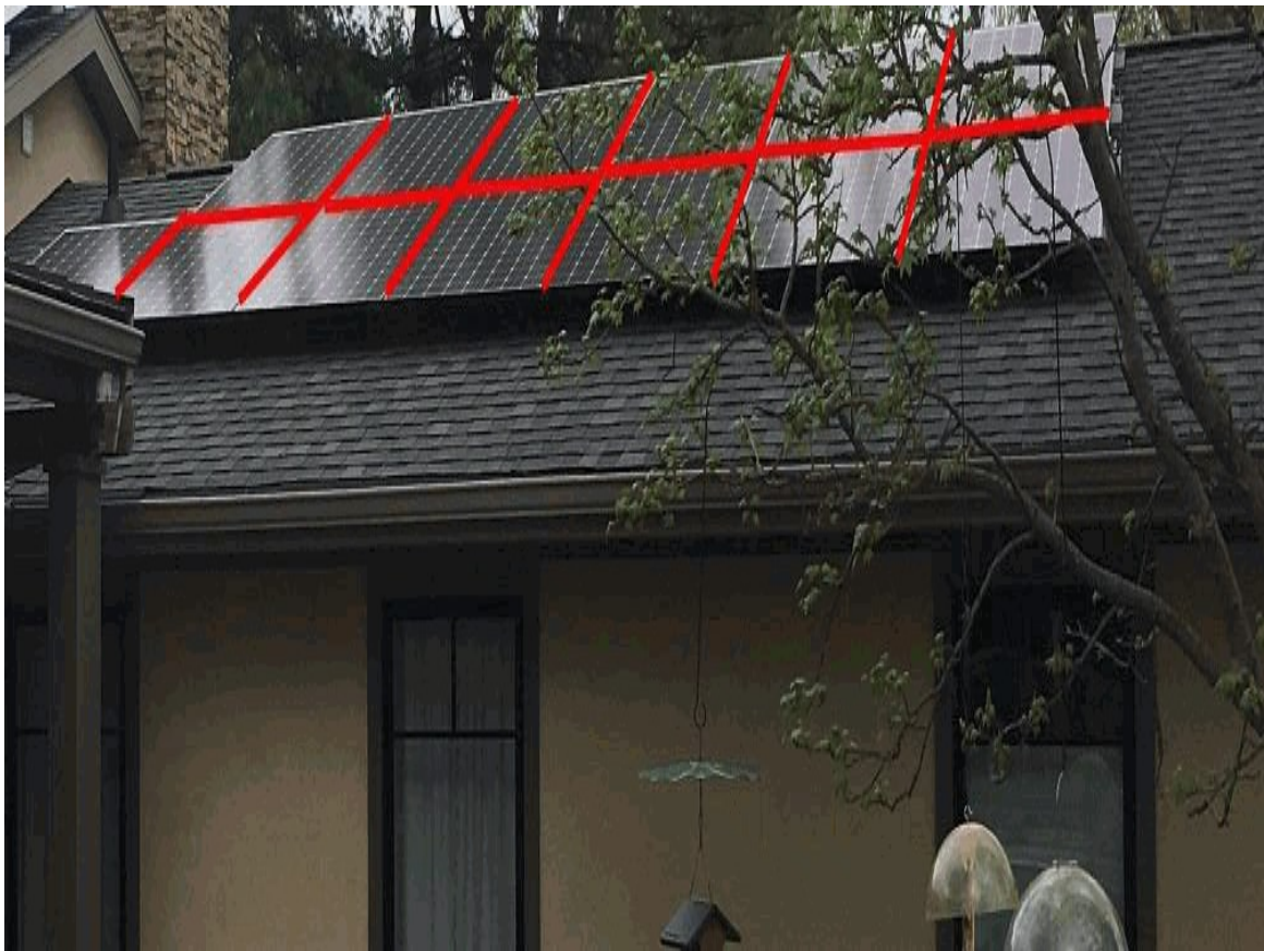
June 06, 2017