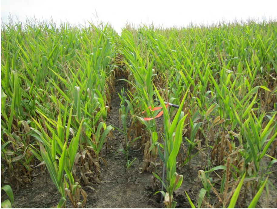
Photo Location 1: Representative agricultural row crop looking east.