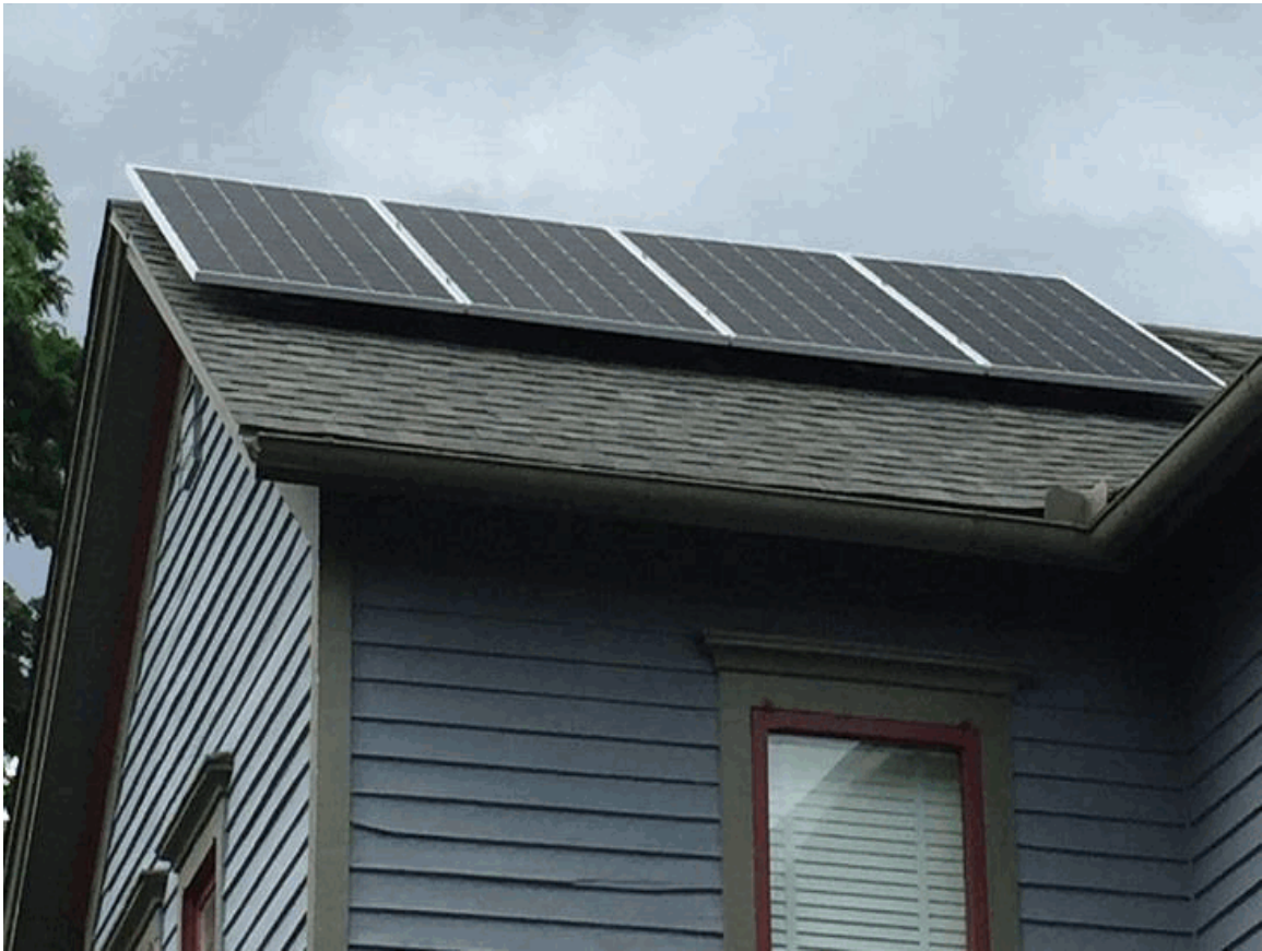
September 08, 2017