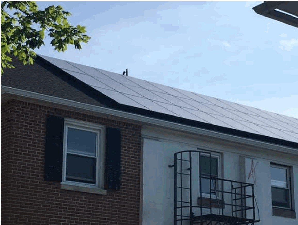
May 18, 2017