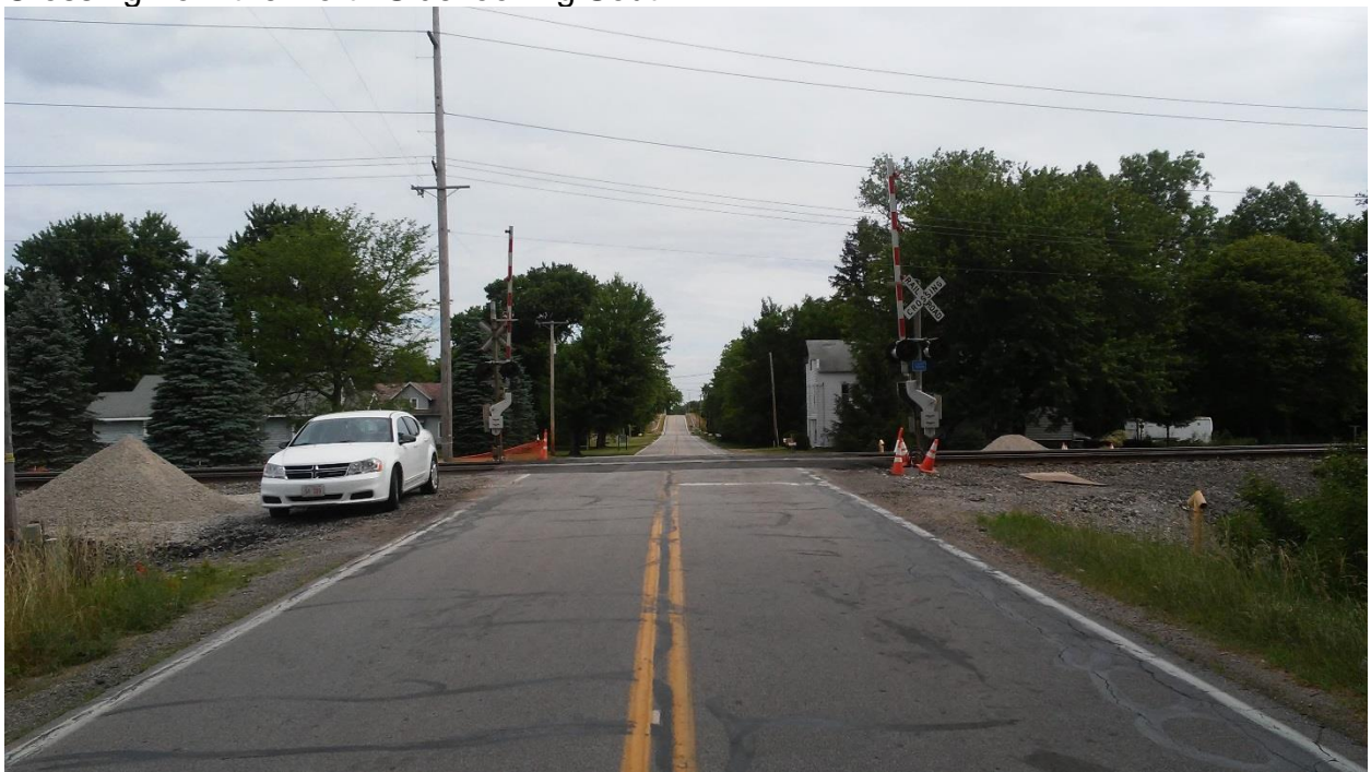
Crossing from the South Side looking North.