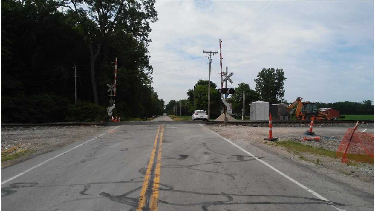
Crossing from the North Side looking South.