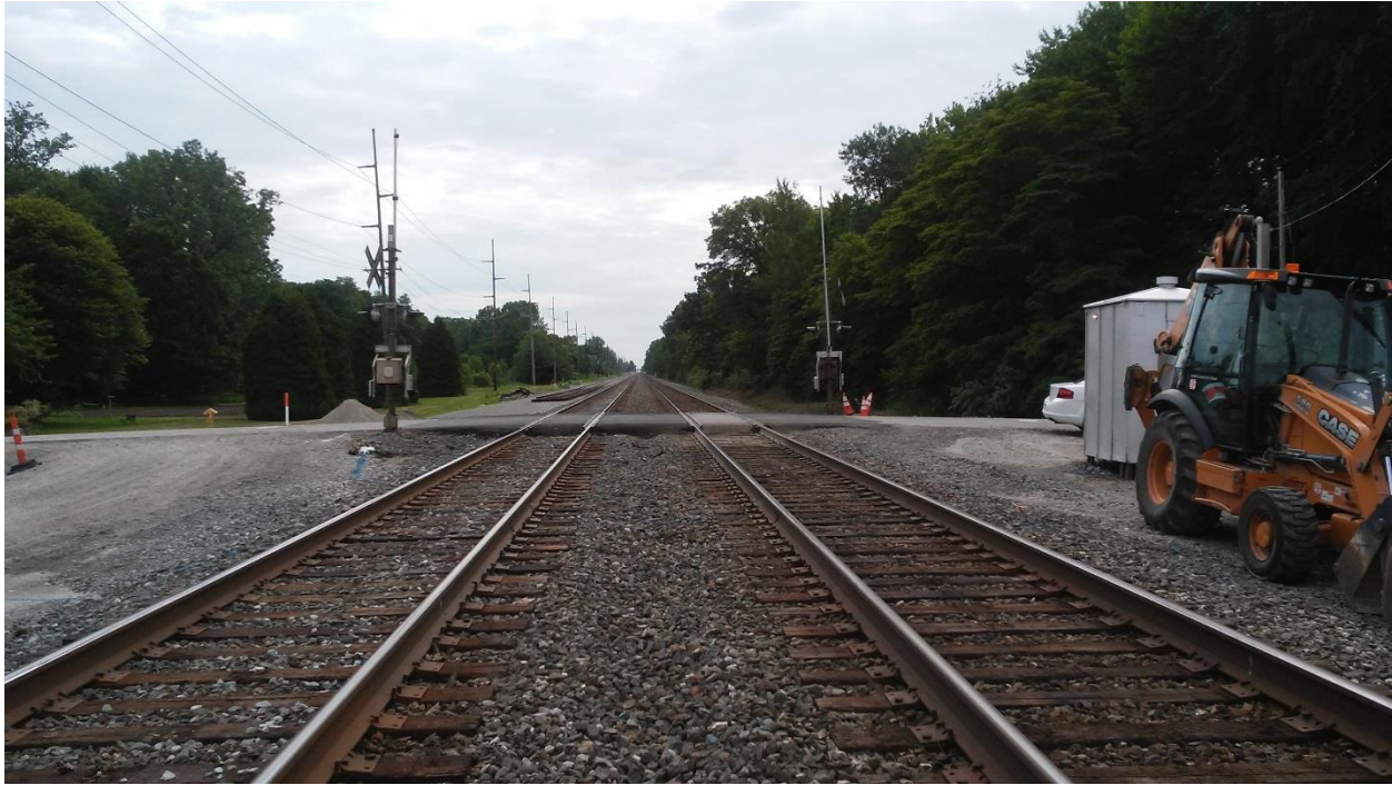
West of the crossing looking East on the tracks.