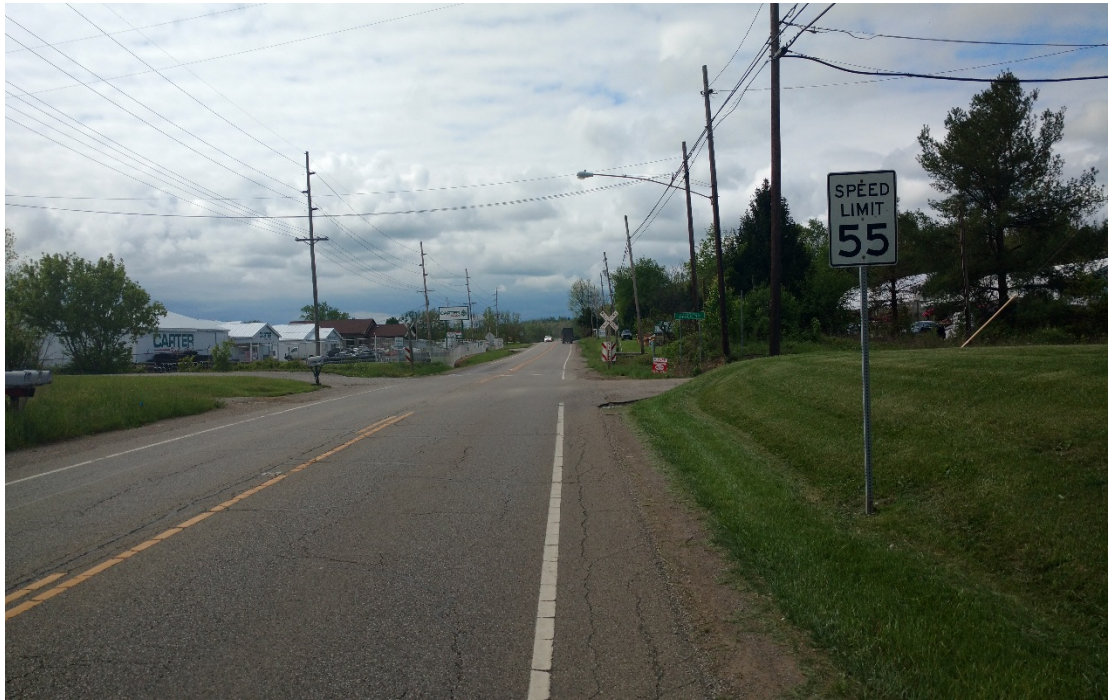
Adamsville Road/SR 93 DOT# 515-009L Crossing looking South.