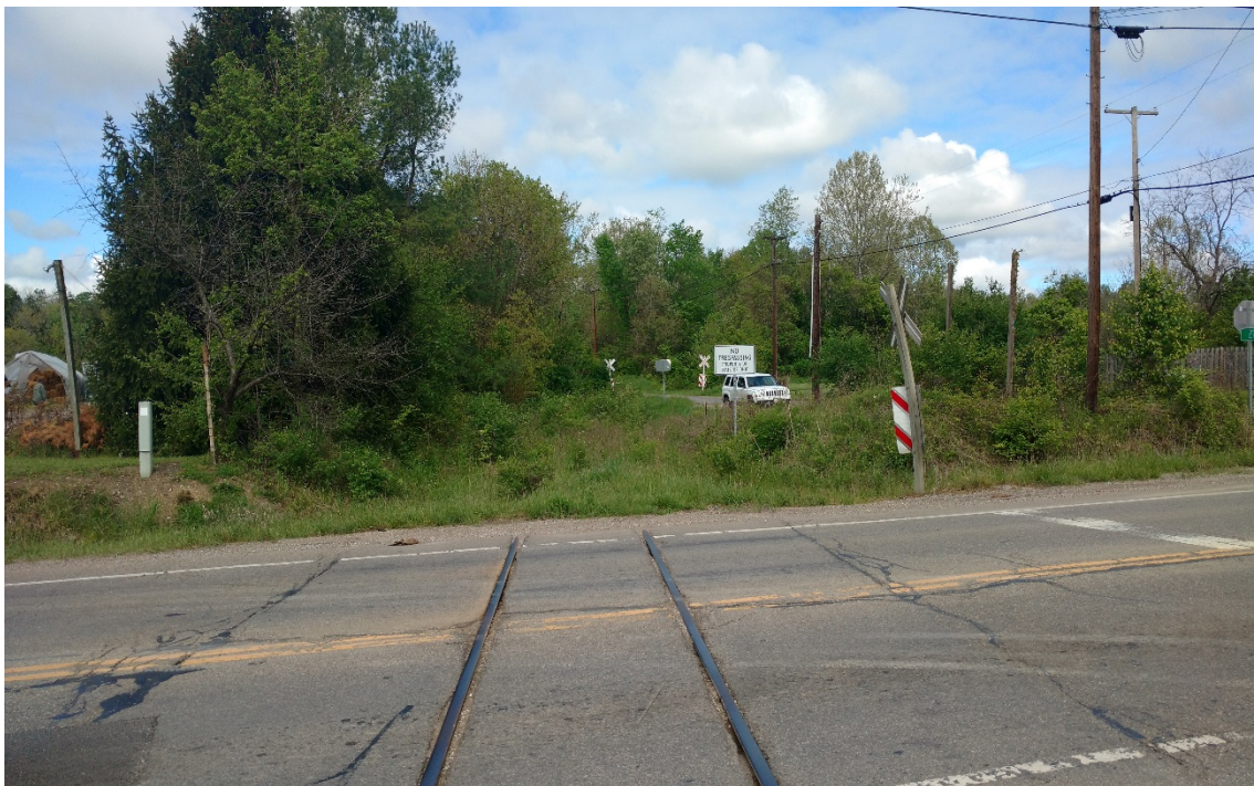
Adamsville Road/SR 93 DOT# 515-009L Crossing looking West.