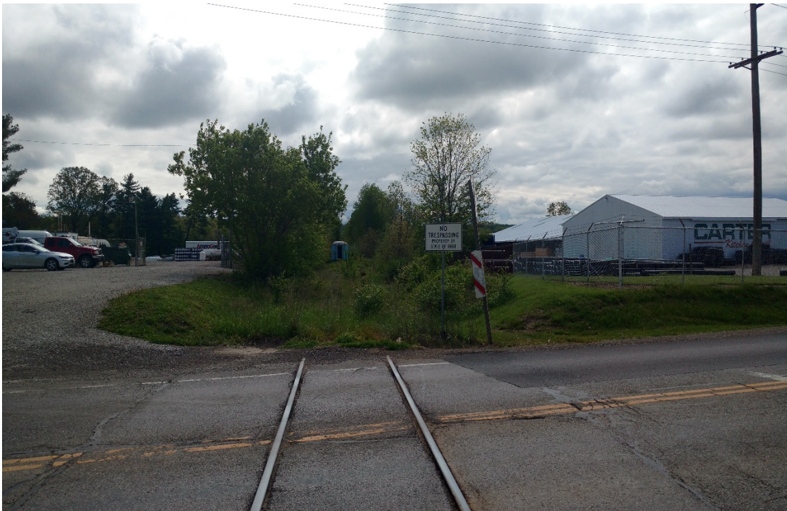
Adamsville Road/SR 93 DOT# 515-009L Crossing looking East.