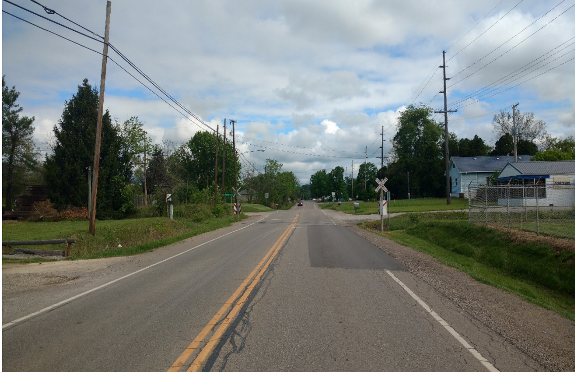
Adamsville Road/SR 93 DOT# 515-009L Crossing looking North.