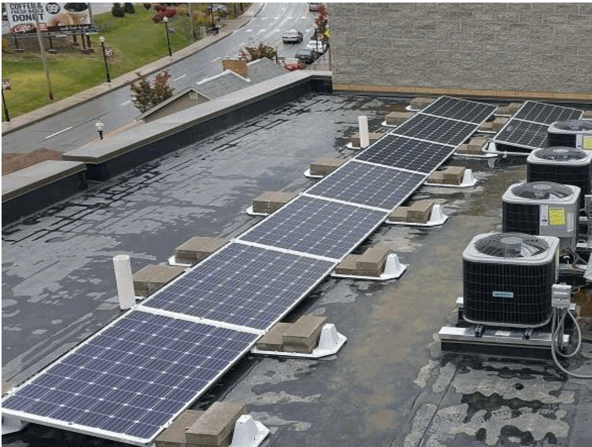
December 06, 2016