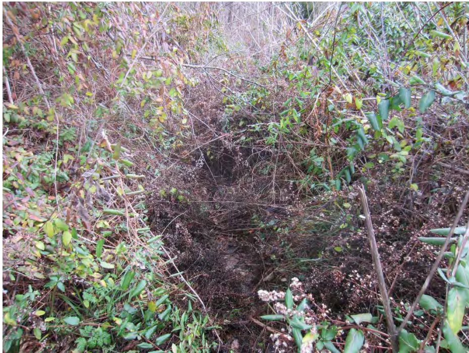
Photo Location 31. View of Stream 25. Photograph taken facing downstream/east.