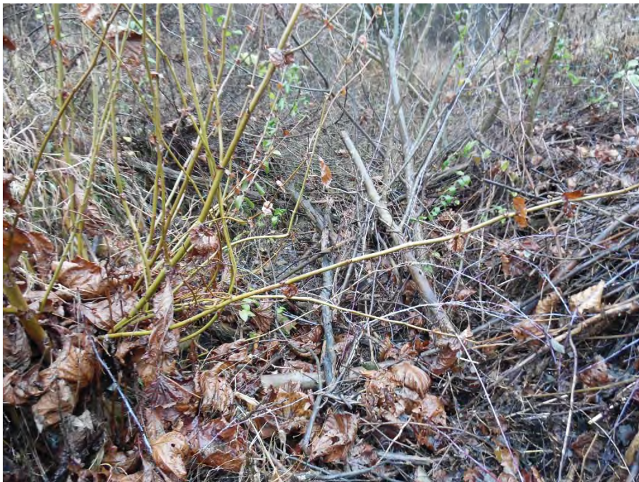
Photo Location 15. View of Stream13. Photograph taken facing downstream/north.