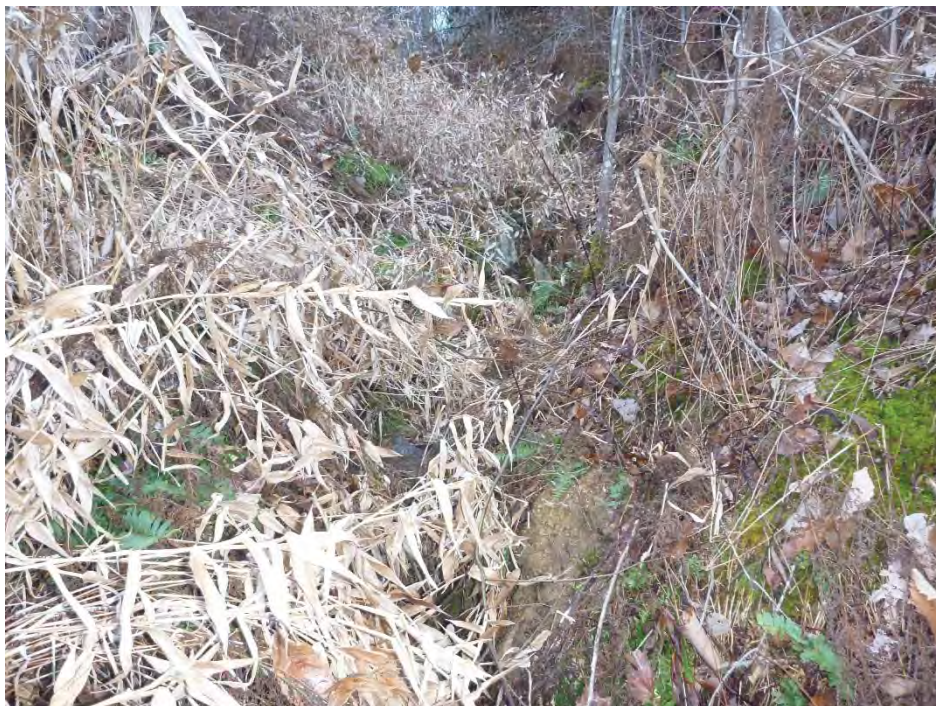
Photo Location 44. View of Stream 33. Photograph taken facing upstream/east.