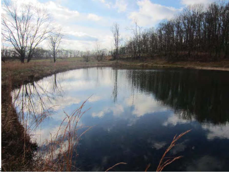
S Photo Location 1. View of Open Water 1. Photograph taken facing east.