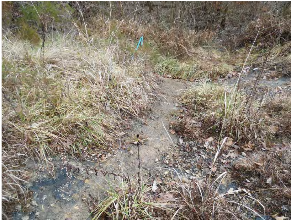
Photo Location 34. View of Stream 28. Photograph taken facing downstream/southeast.