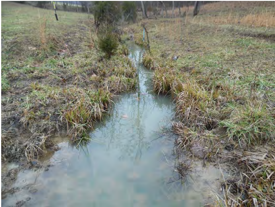
Photo Location 16. View of Stream 14. Photograph taken facing upstream/southeast.