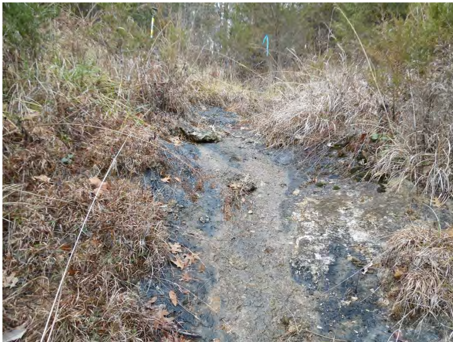
Photo Location 34. View of Stream 28. Photograph taken facing upstream/northwest.