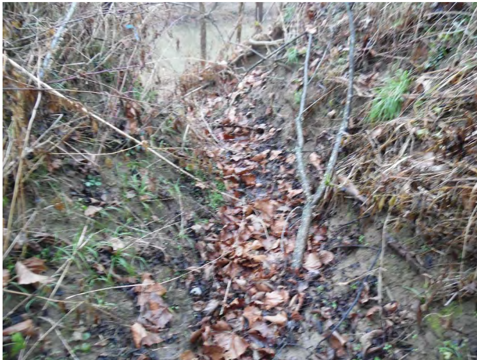
Photo Location 20. View of Stream 17. Photograph taken facing downstream/southeast.