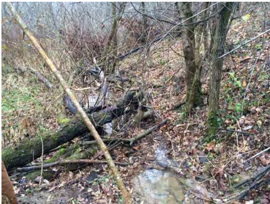
Photo Location 10. View of Stream 8. Photograph taken facing downstream/southeast.