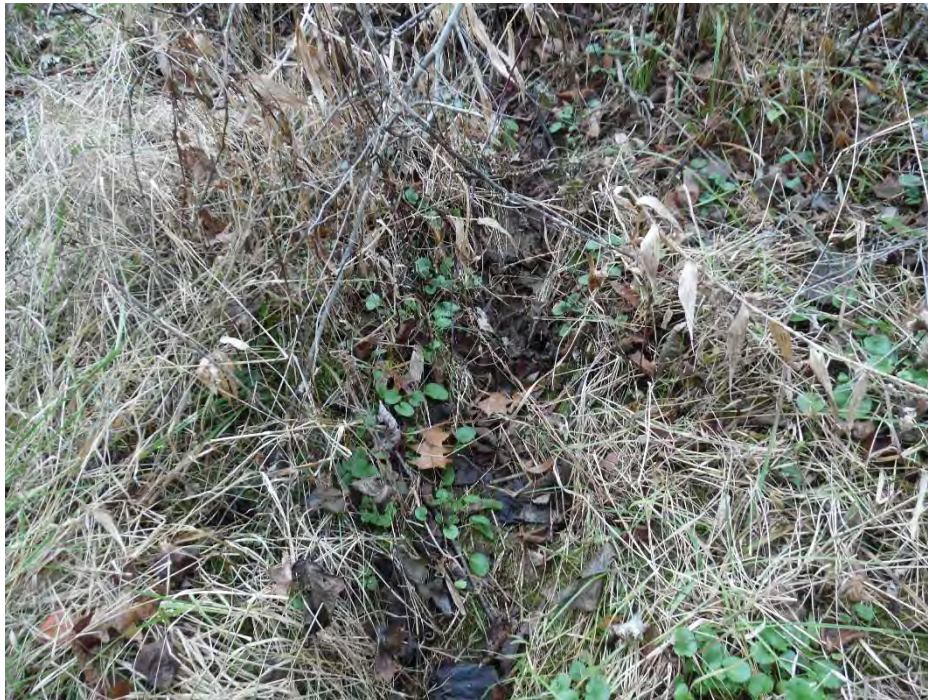
Photo Location 37. View of Stream 29. Photograph taken facing upstream/southwest.