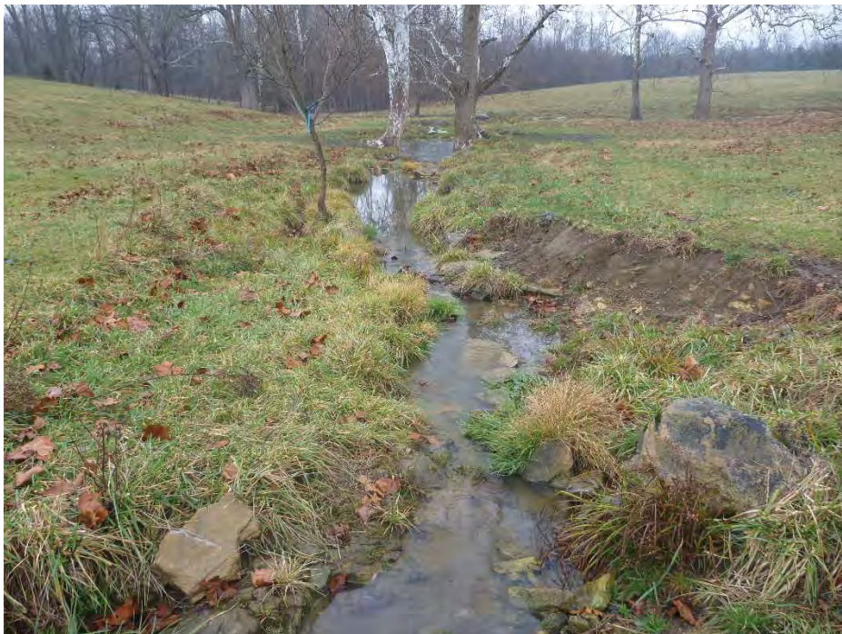
Photo Location 26. View of Stream 23. Photograph taken facing downstream/northwest.