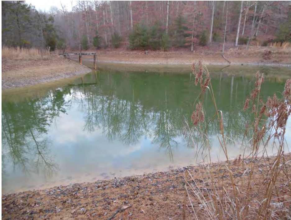
Photo Location 42. View of Open Water 3. Photograph taken facing north.