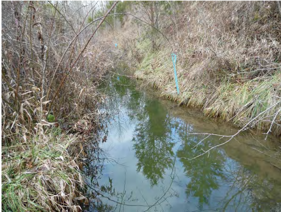
Photo Location 41. View of Stream 31. Photograph taken facing upstream/north.