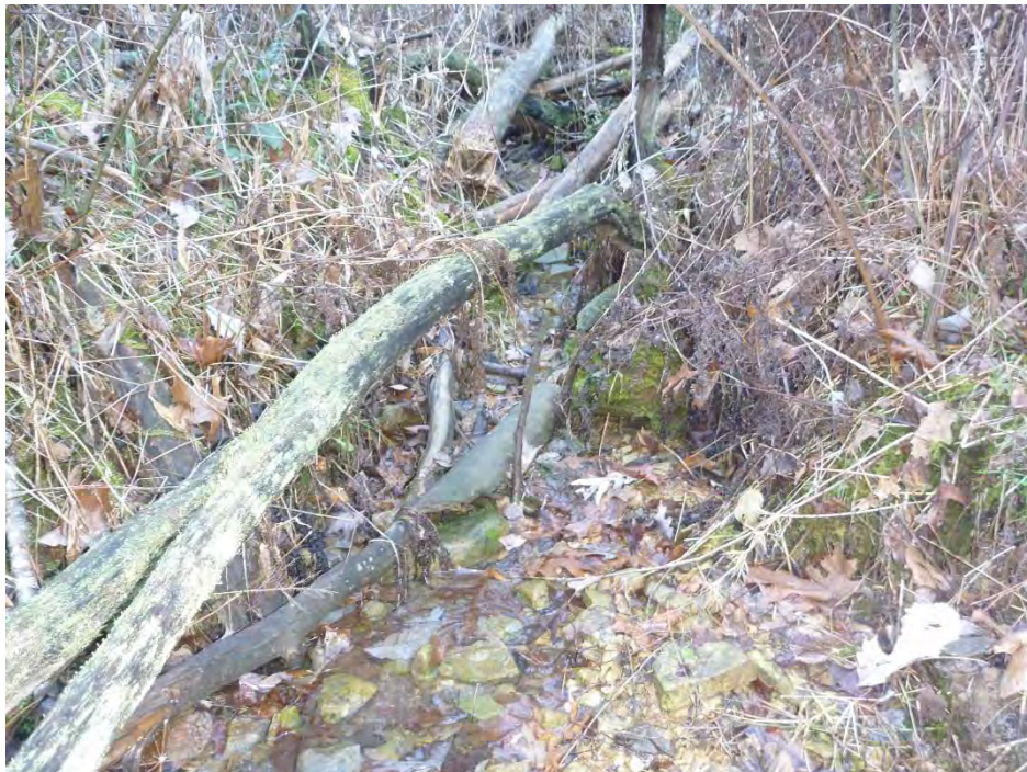
Photo Location 43. View of Stream 32. Photograph taken facing upstream/southeast.