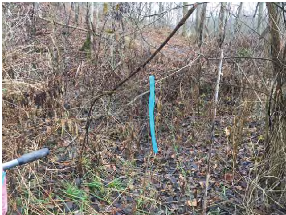
Photo Location 22. View of Stream 19. Photograph taken facing downstream/west.