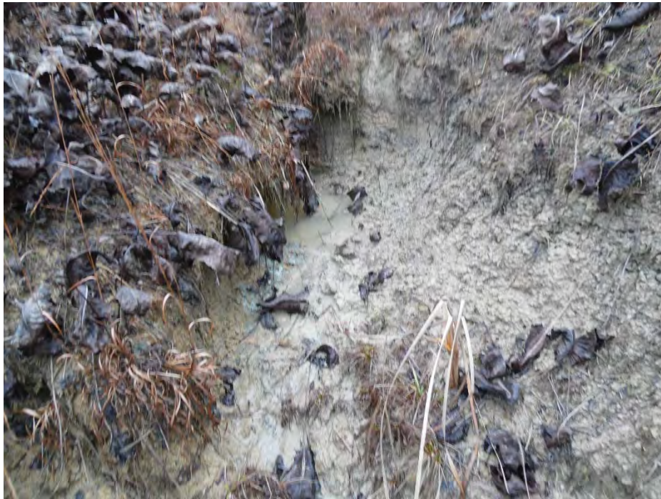
Photo Location 18. View of Stream 15. Photograph taken facing upstream/south.