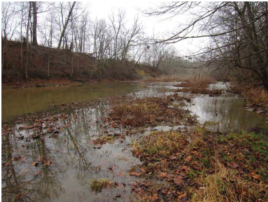
Photo Location 6. View of Stream 4. Photograph taken facing downstream/south.