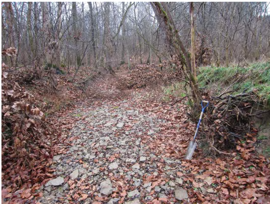
Photo Location 4. View of Stream 2. Photograph taken facing downstream/south.