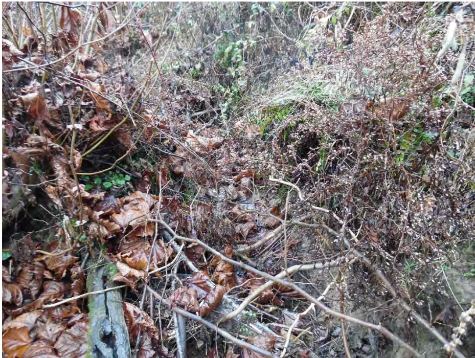
Photo Location 15. View of Stream 13. Photograph taken facing upstream/south.