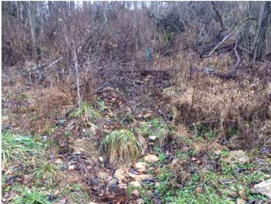
Photo Location 12. View of Stream 10. Photograph taken facing upstream/south.