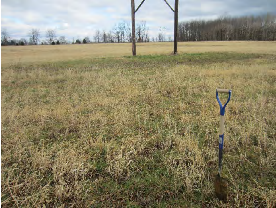
Photo Location 30. View of upland at wetland determination sample point (SP 5). Photograph taken facing northeast.