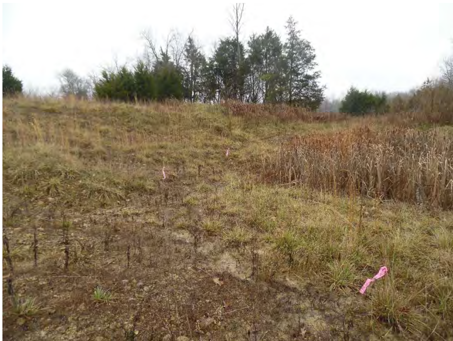
Photo Location 17. View of wetland determination sample point (SP 2) within Wetland 1. Photograph taken facing southeast.