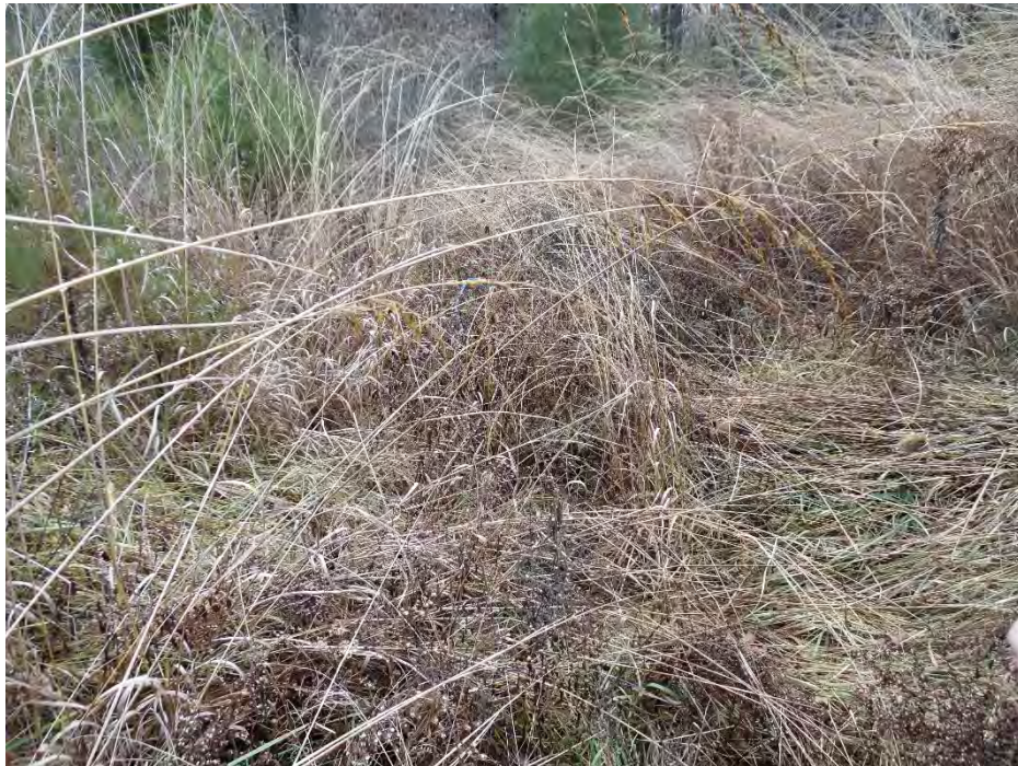
Photo Location 33. View of Stream 27. Photograph taken facing downstream/southeast.