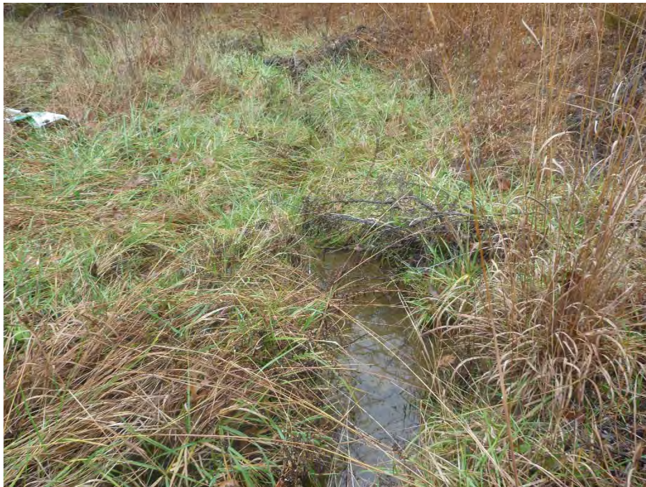
Photo Location 23. View of Stream 20. Photograph taken facing downstream/north.