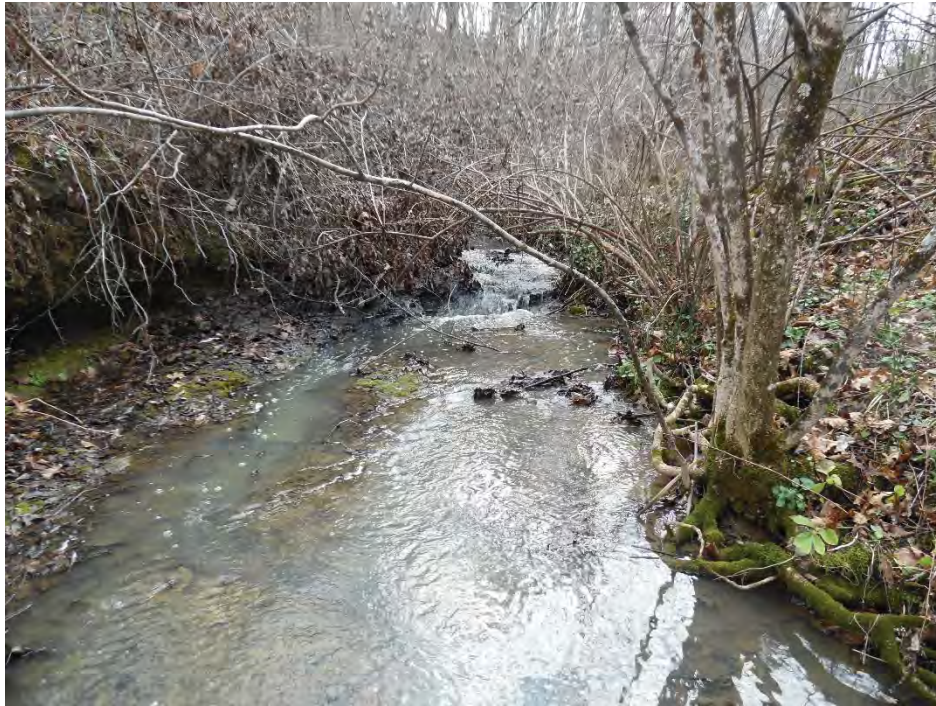
Photo Location 38. View of Stream 26. Photograph taken facing upstream/southwest.