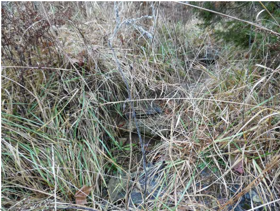
Photo Location 33. View of Stream 27. Photograph taken facing upstream/northwest.