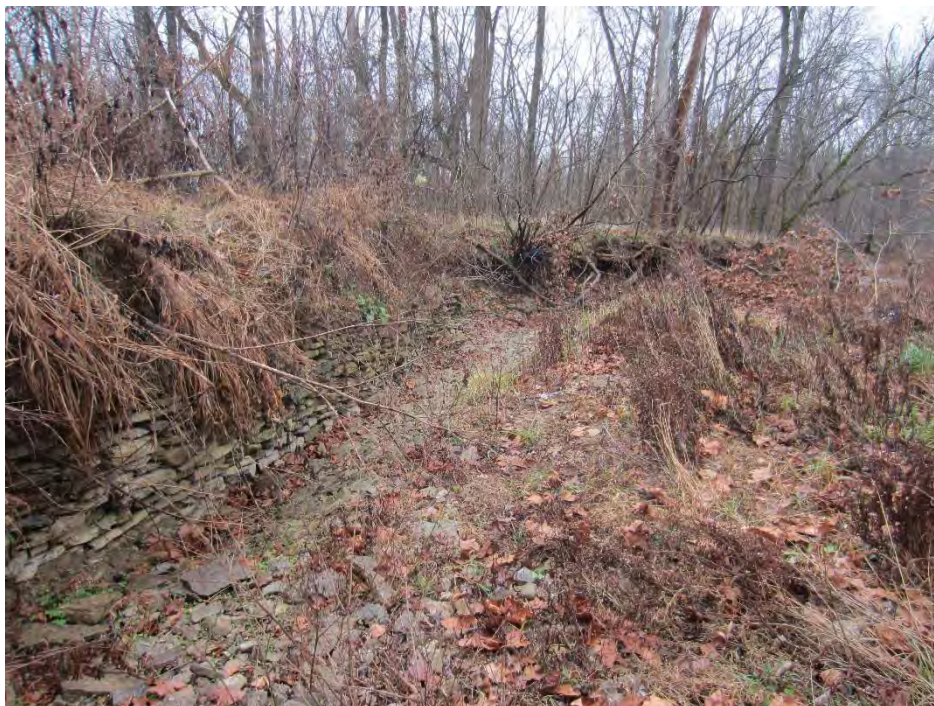
Photo Location 5. View of Stream 3. Photograph taken facing downstream/south.