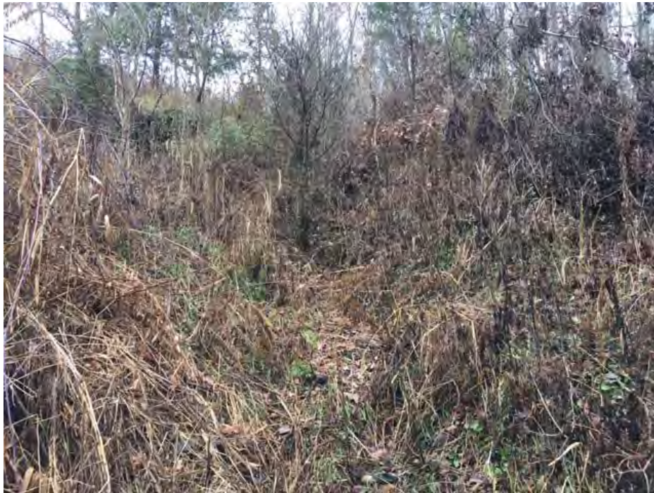
Photo Location 22. View of Stream 19. Photograph taken facing upstream/east.