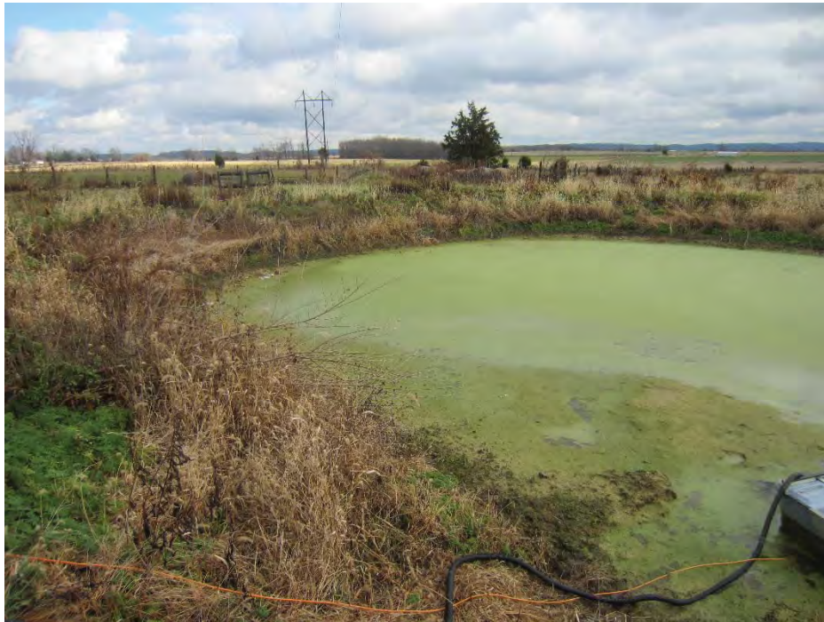
Photo Location 28. View of Open Water 2. Photograph taken facing northeast.