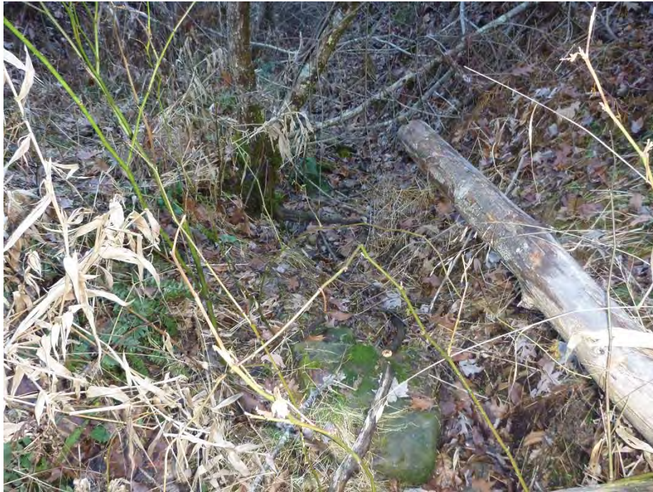
Photo Location 43. View of Stream 32. Photograph taken facing downstream/northwest.