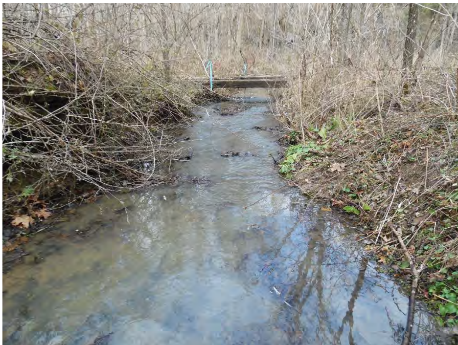
Photo Location 38. View of Stream 26. Photograph taken facing downstream/northeast.