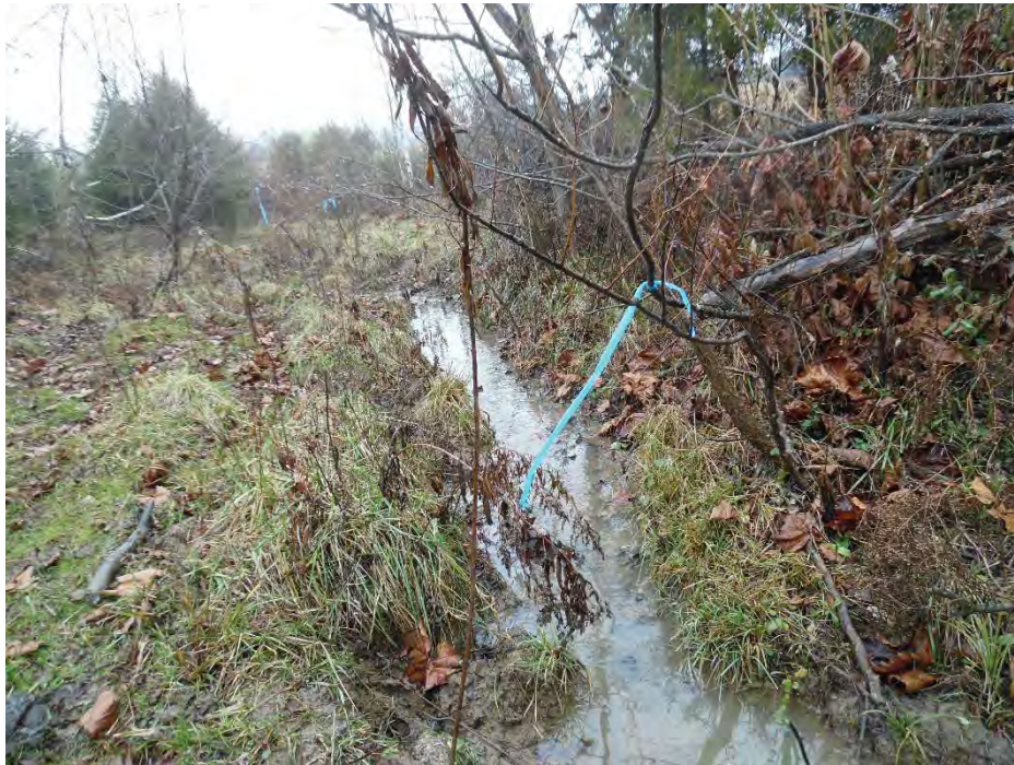
Photo Location 14. View of Stream 12. Photograph taken facing upstream/south.