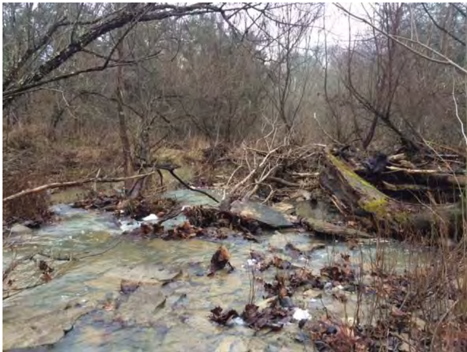
Photo Location 7. View of Stream 5. Photograph taken facing downstream/southeast.