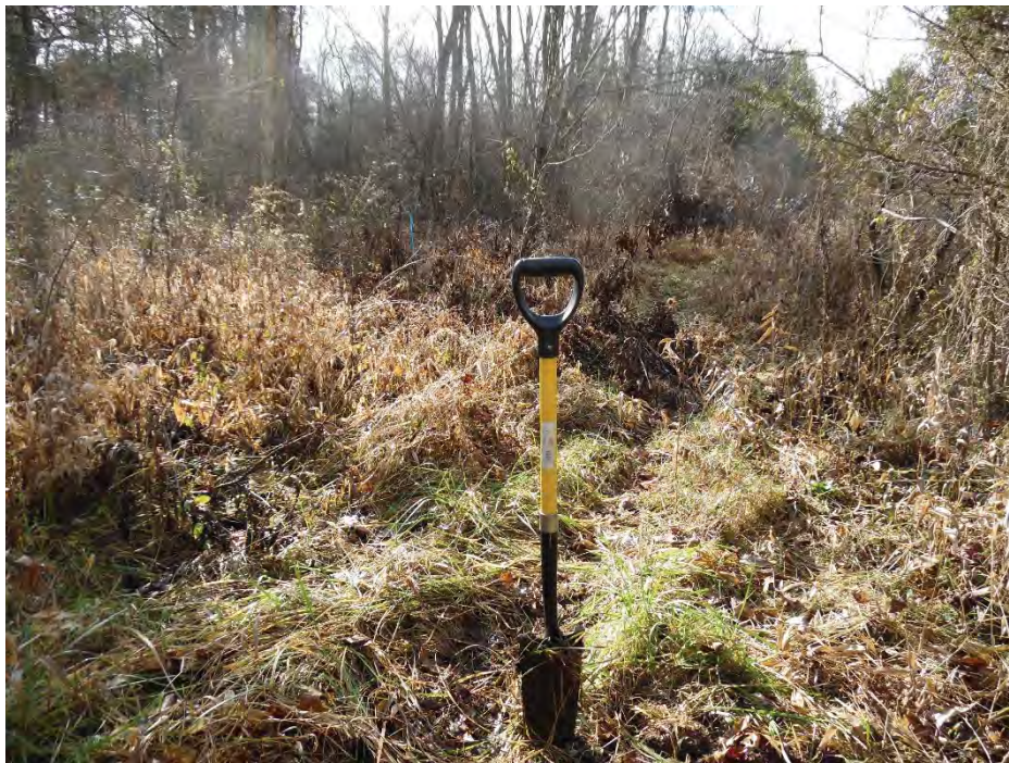
Photo Location 35. View of upland at wetland determination sample point (SP 6). Photograph taken facing southwest.