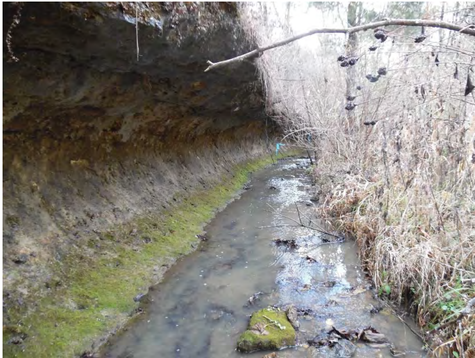
Photo Location 36. View of Stream 26. Photograph taken facing upstream/southwest.