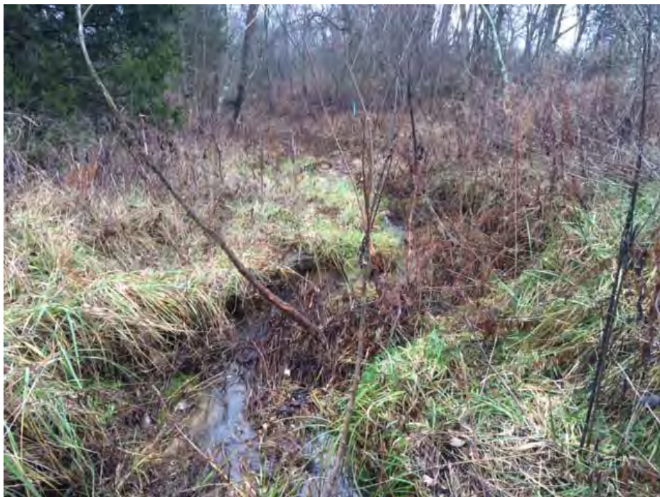
Photo Location 9. View of Stream 7. Photograph taken facing downstream/southeast.