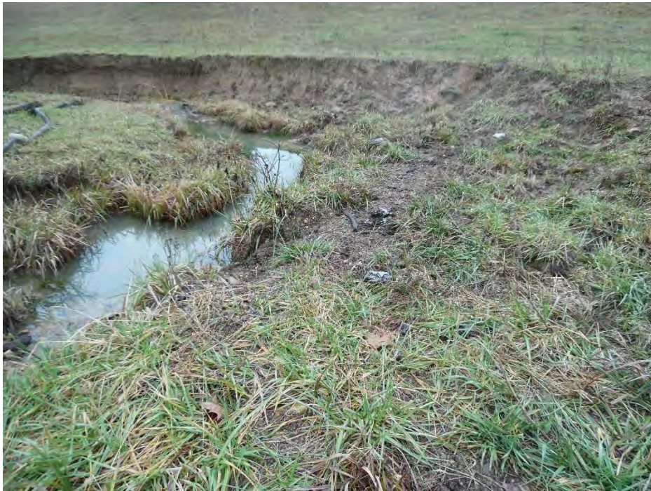
Photo Location 16. View of Stream 14. Photograph taken facing downstream/northwest.