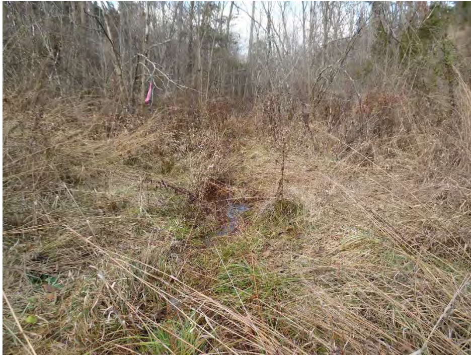
Photo Location 40. View of wetland determination sample point (SP 7) within Wetland 2. Photograph taken facing north.