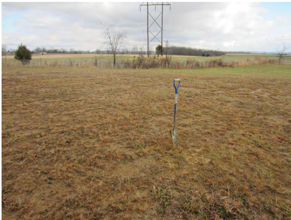
Photo Location 29. View of upland at wetland determination sample point (SP 4). Photograph taken facing northeast.