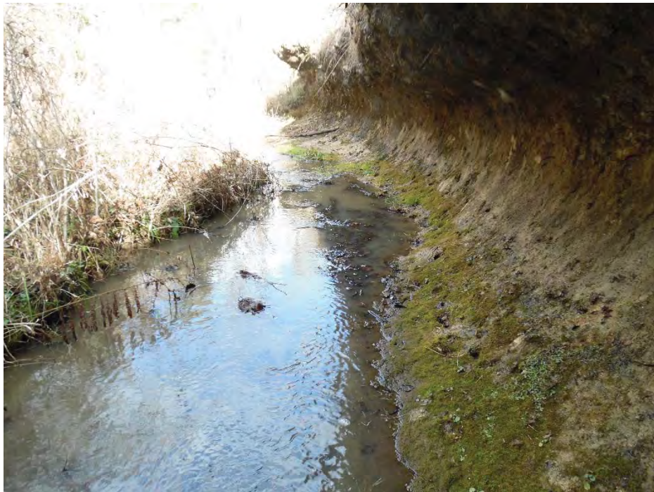
Photo Location 36. View of Stream 26. Photograph taken facing downstream/northeast.