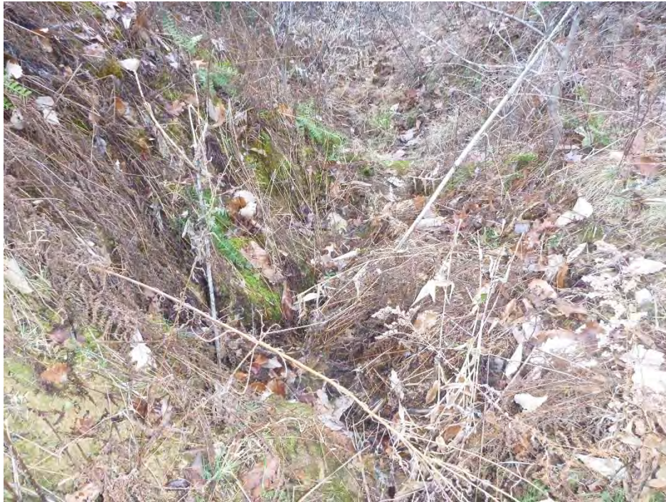
Photo Location 44. View of Stream 33. Photograph taken facing downstream/west.