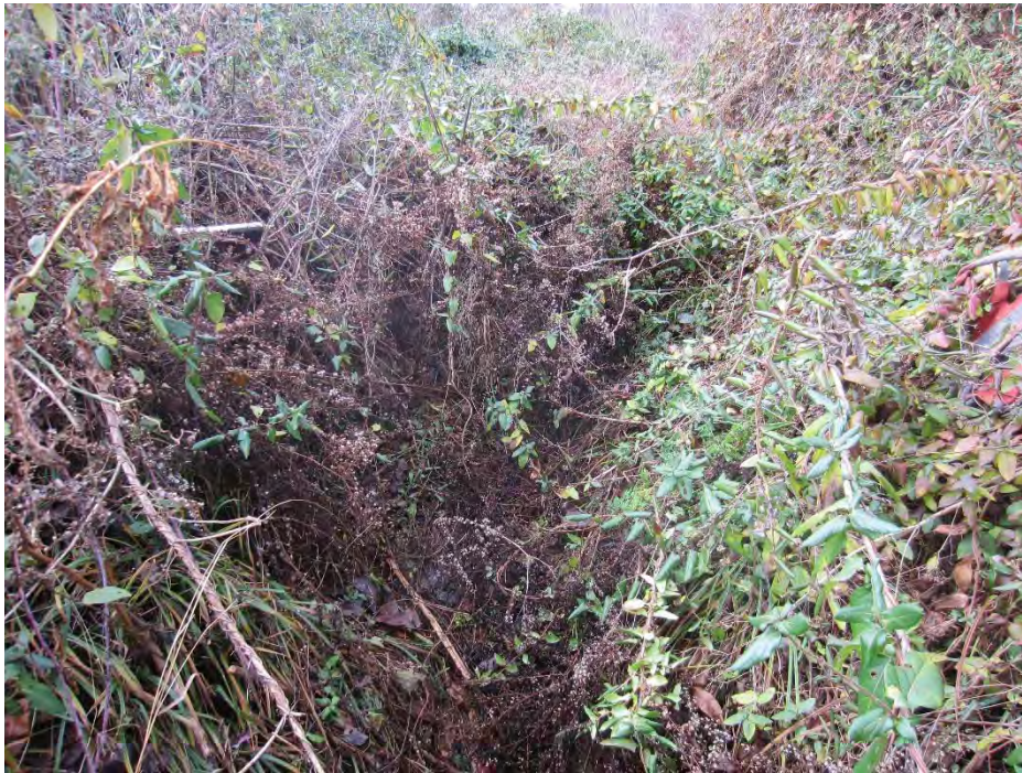
Photo Location 31. View of Stream 25. Photograph taken facing upstream/west.