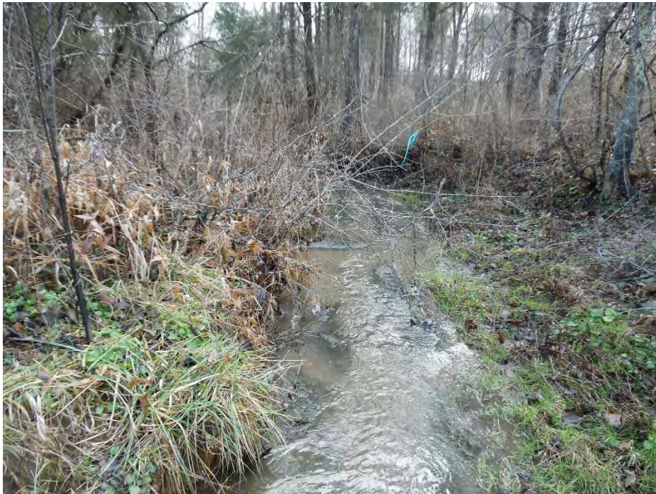
Photo Location 32. View of Stream 26. Photograph taken facing downstream/southeast.