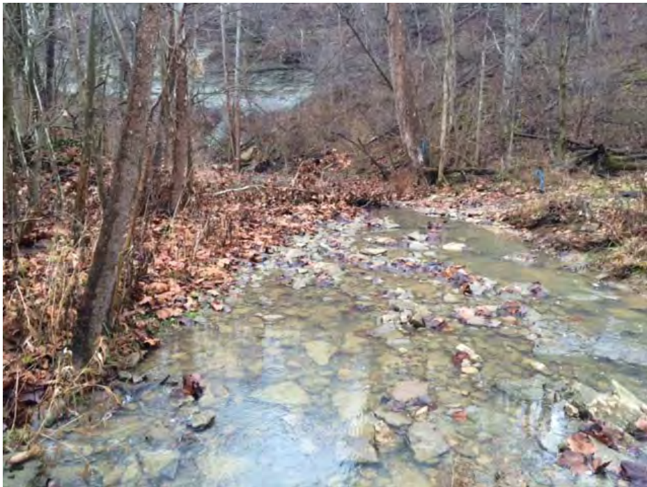
Photo Location 11. View of Stream 9. Photograph taken facing downstream/south.