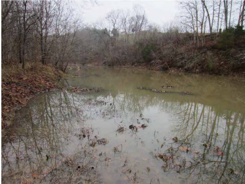
Photo Location 6. View of Stream 4. Photograph taken facing upstream/north.