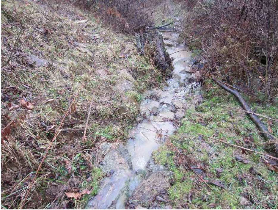
Photo Location 2. View of Stream 1. Photograph taken facing downstream/northeast.