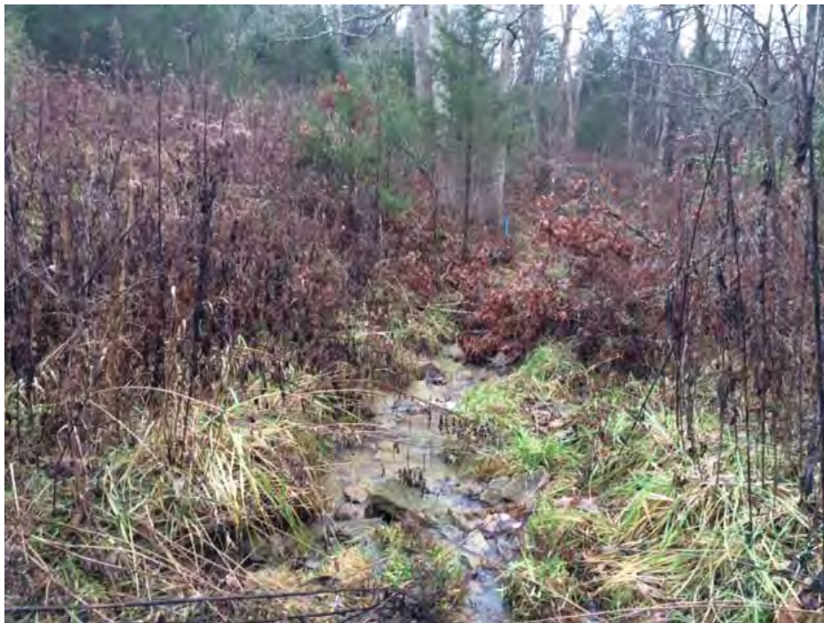
Photo Location 8. View of Stream 6. Photograph taken facing downstream/south.