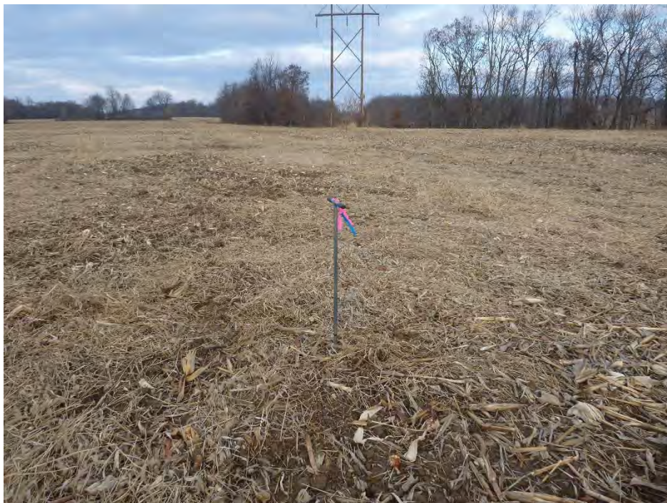
Photo Location 45. View of upland at wetland determination sample point (SP 9). Photograph taken facing northeast.