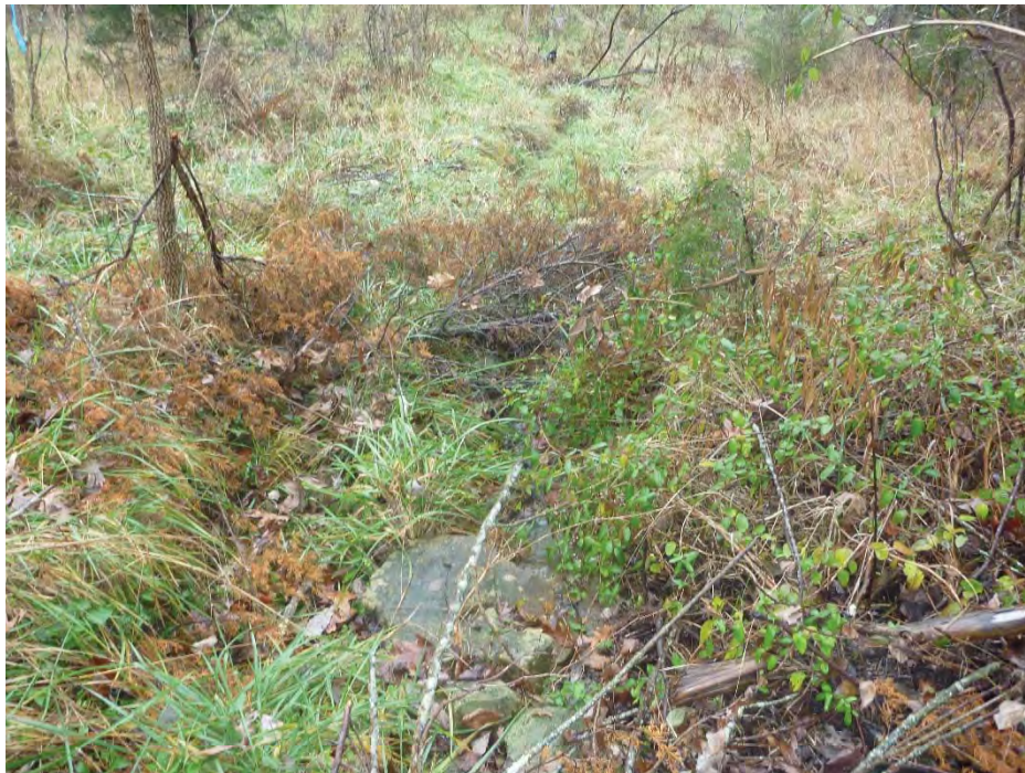
Photo Location 25. View of Stream 22. Photograph taken facing downstream/southwest.