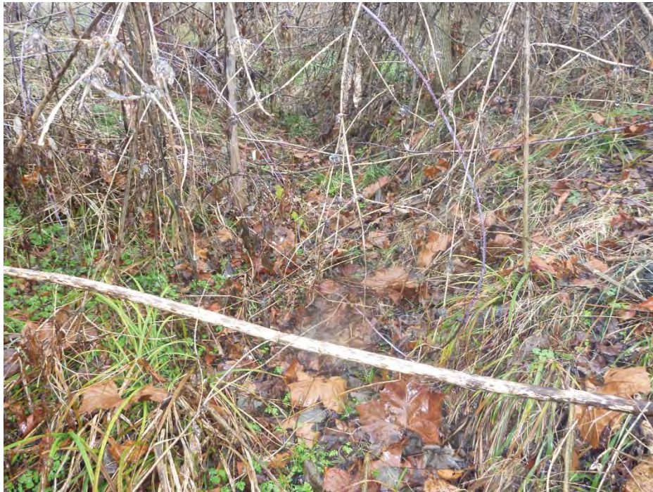
Photo Location 27. View of Stream 24. Photograph taken facing upstream/northeast.