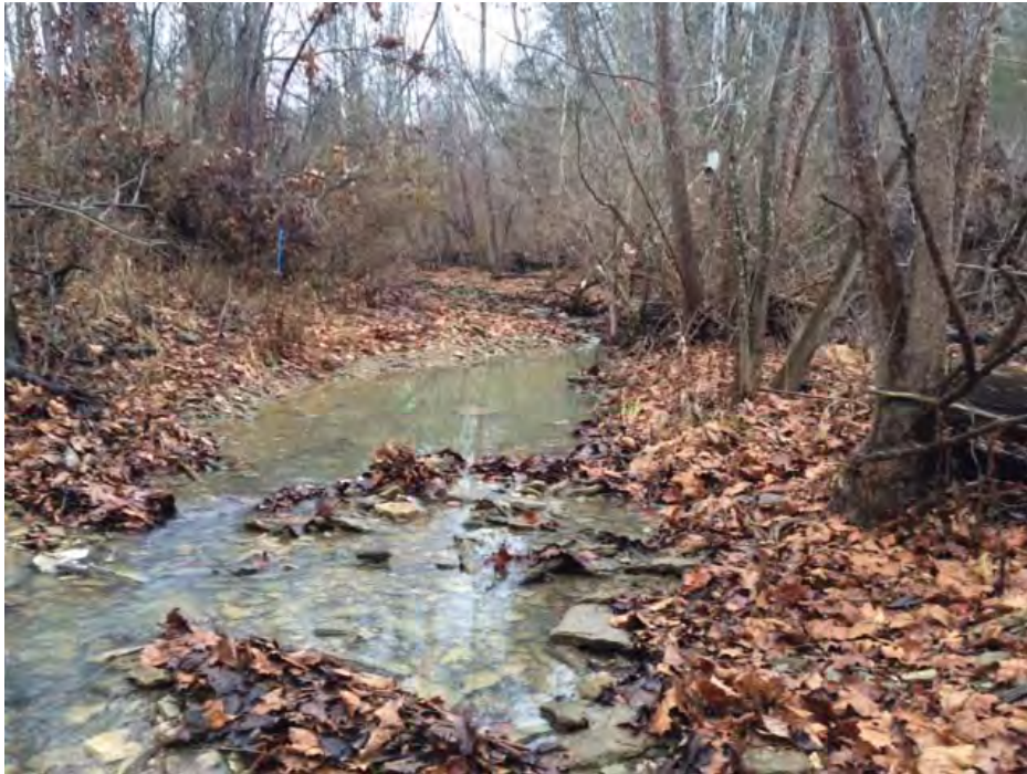
Photo Location 11. View of Stream 9. Photograph taken facing upstream/north.