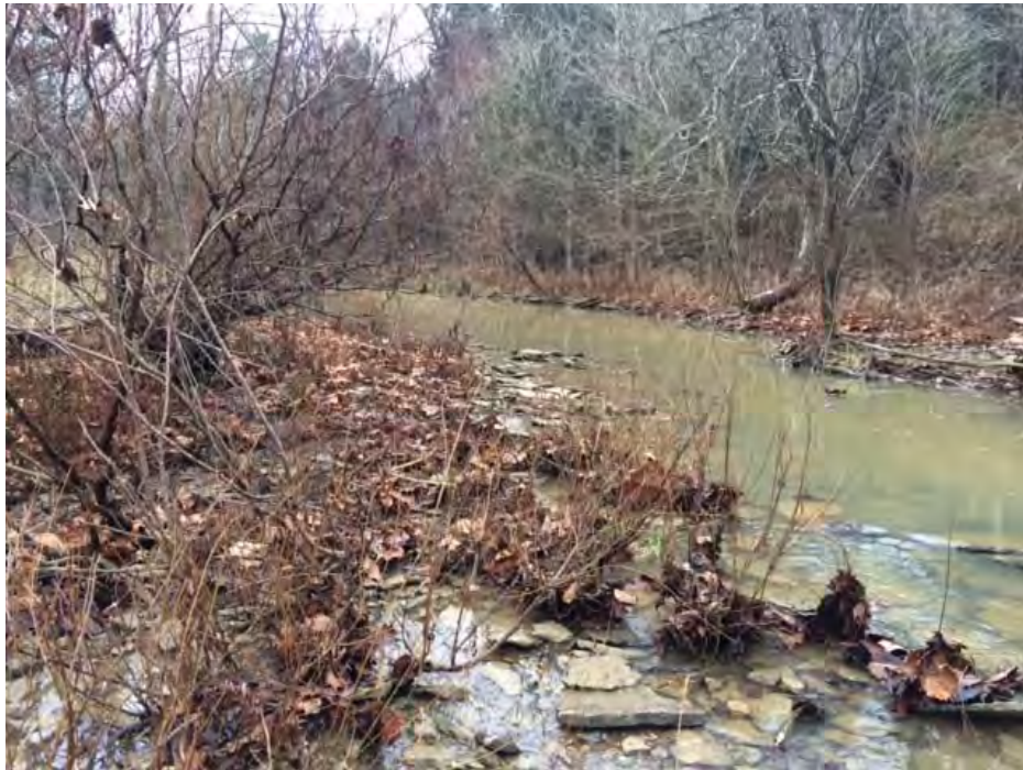
Photo Location 7. View of Stream 5. Photograph taken facing upstream/northwest.