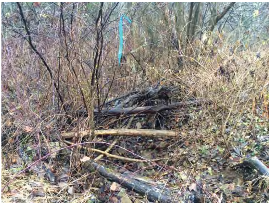
Photo Location 12. View of Stream 10. Photograph taken facing downstream/north.