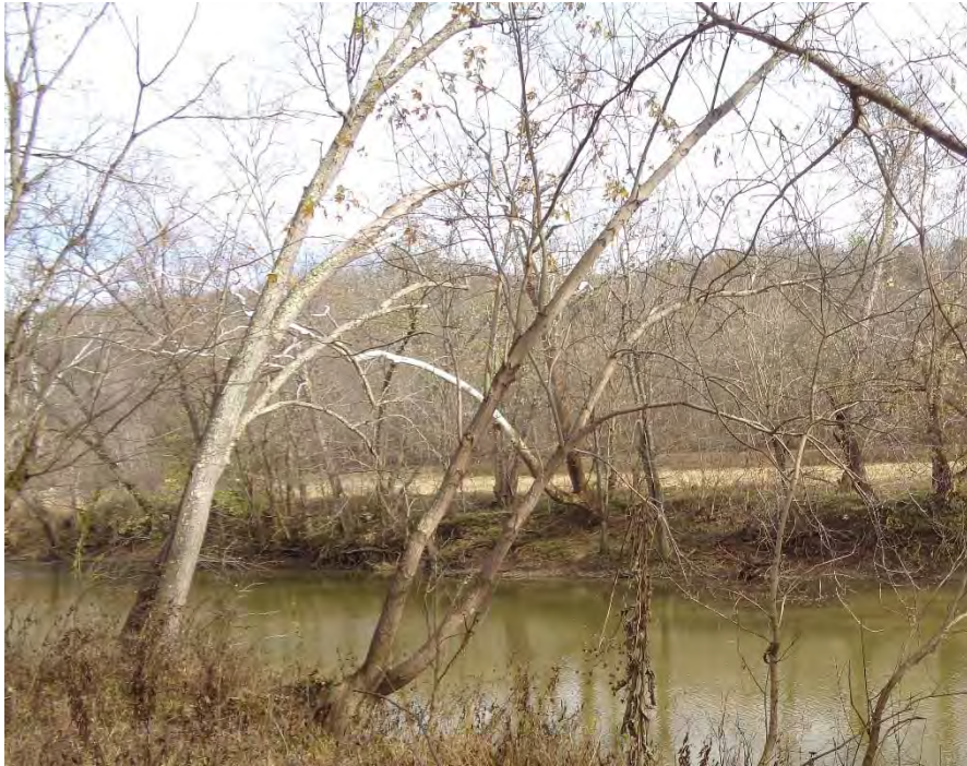
Photo Location 21. View of Stream 18 (Ohio Brush Creek). Photograph taken facing upstream/ north.