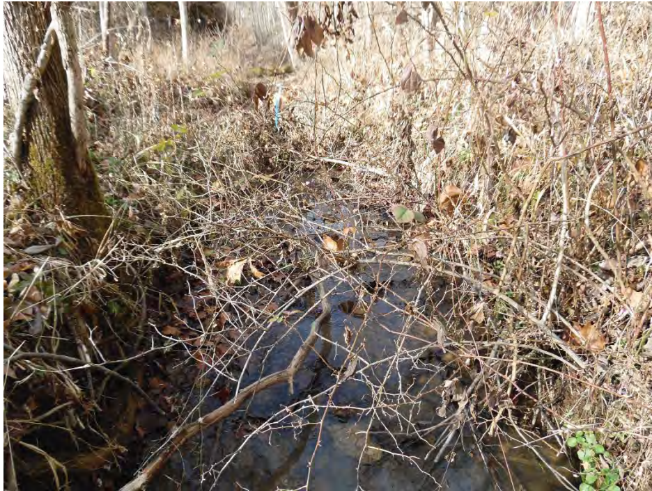
Photo Location 39. View of Stream 30. Photograph taken facing upstream/northwest.