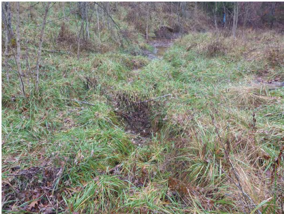
Photo Location 24. View of Stream 21. Photograph taken facing downstream/northwest.