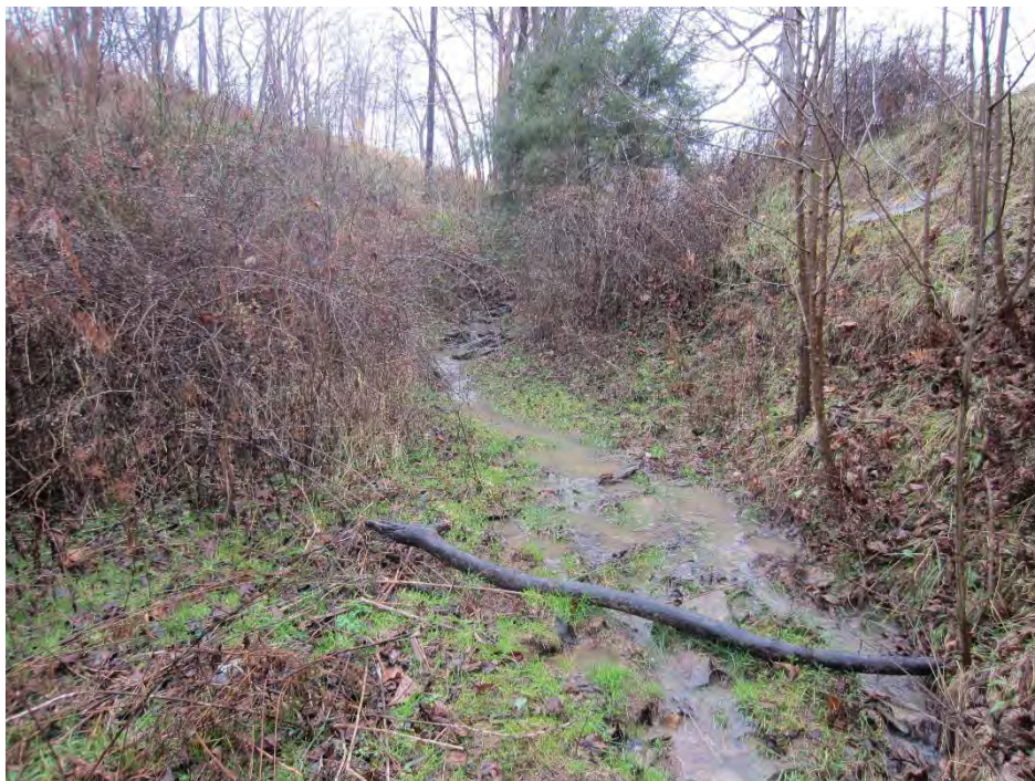
Photo Location 2. View of Stream 1. Photograph taken facing upstream/southwest.