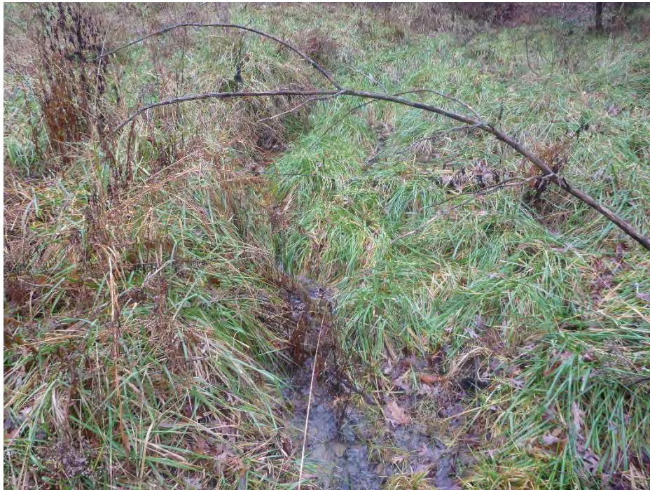
Photo Location 24. View of Stream 21. Photograph taken facing upstream/southeast.