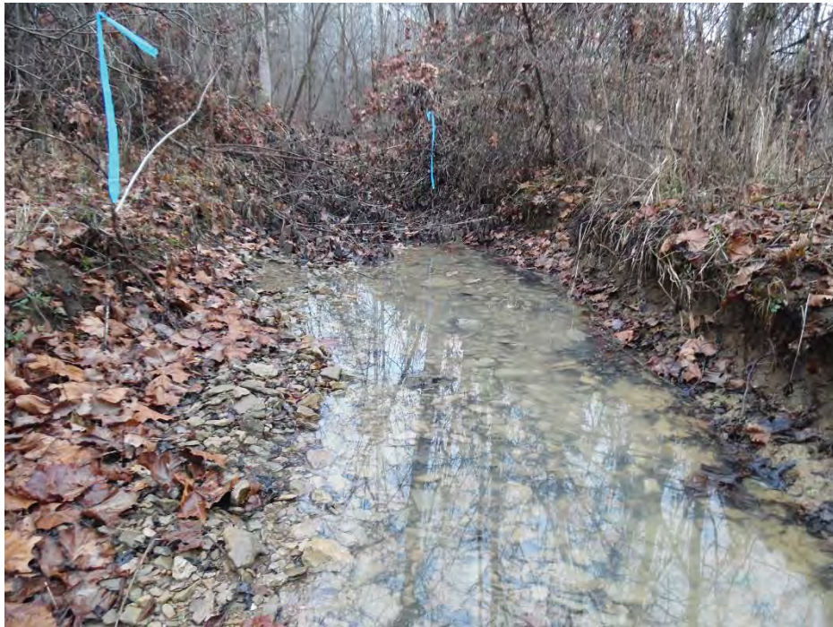
Photo Location 19. View of Stream 16. Photograph taken facing upstream/south.