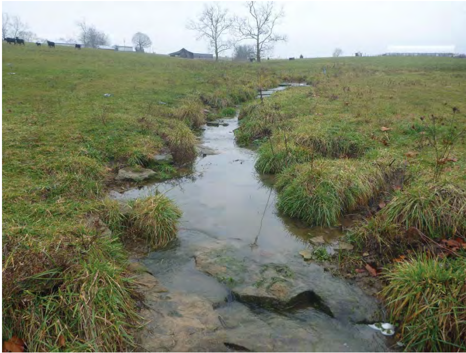
Photo Location 26. View of Stream 23. Photograph taken facing upstream/southeast.