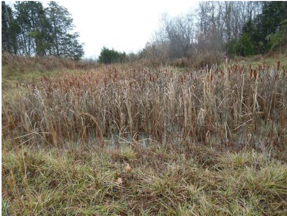
Photo Location 17. View of wetland determination sample point (SP 2) within Wetland 1. Photograph taken facing south.