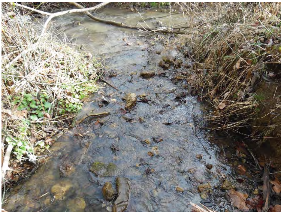
Photo Location 39. View of Stream 30. Photograph taken facing downstream/southeast.