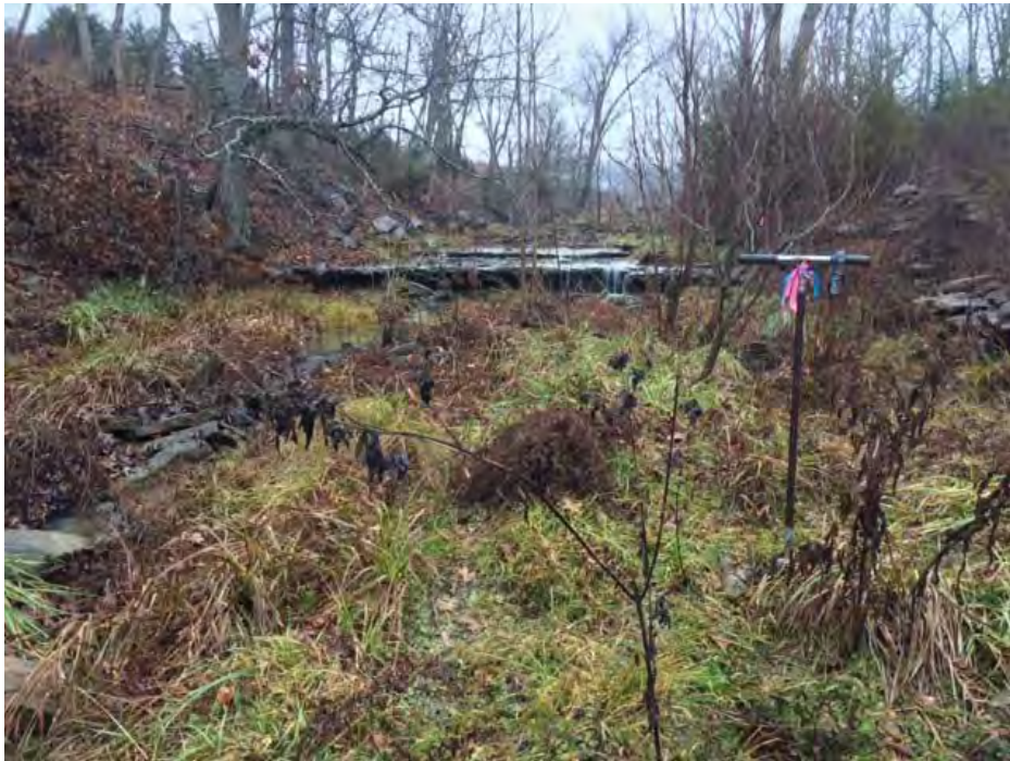
Photo Location 13. View of Stream 11. Photograph taken facing upstream/north.