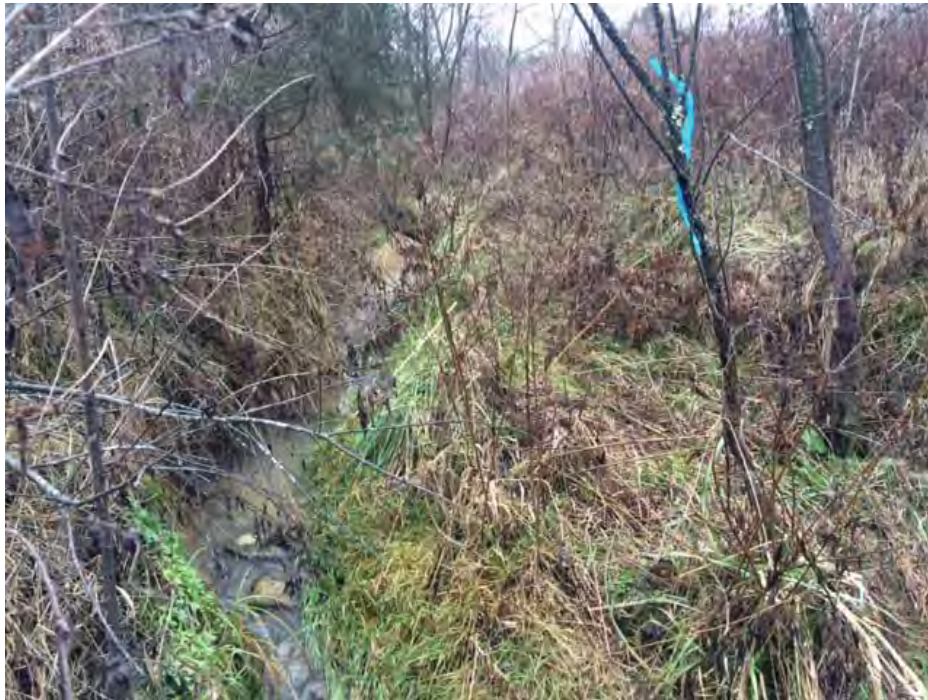
Photo Location 9. View of Stream 7. Photograph taken facing upstream/northwest.