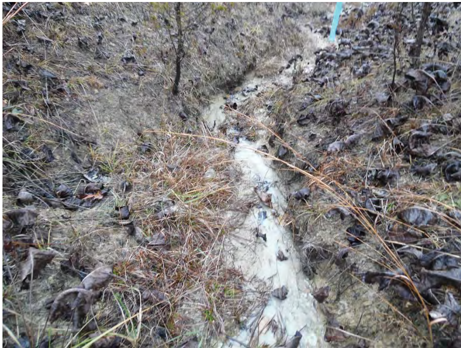
Photo Location 18. View of Stream 15. Photograph taken facing downstream/north.