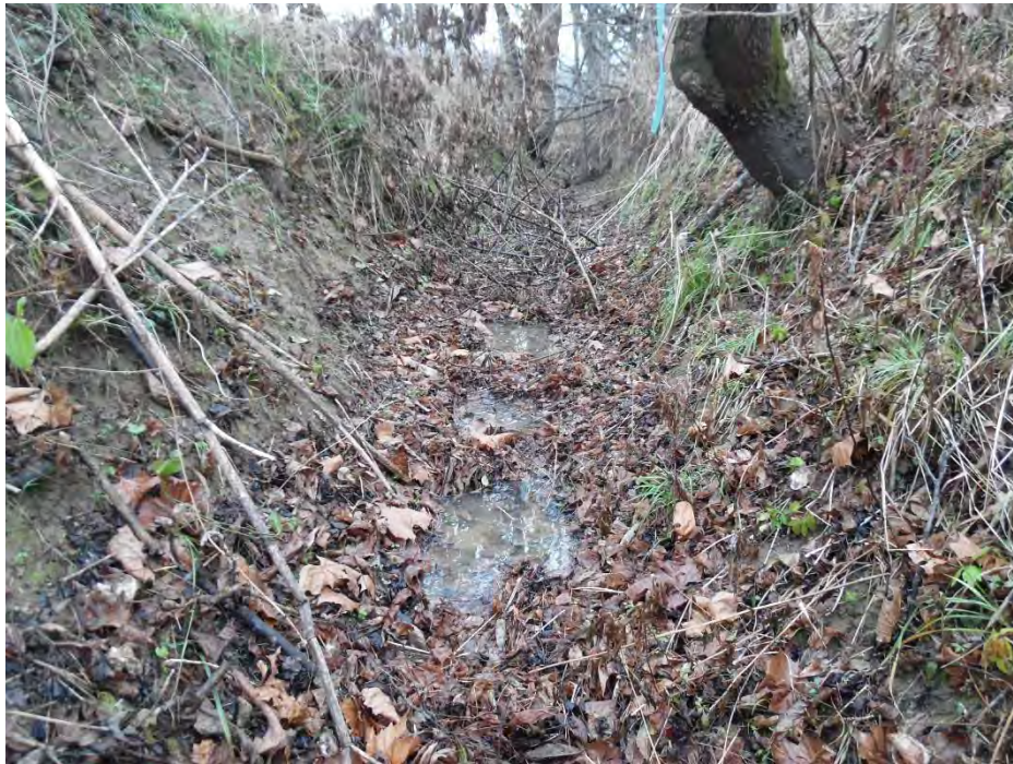
Photo Location 20. View of Stream 17. Photograph taken facing upstream/northwest.