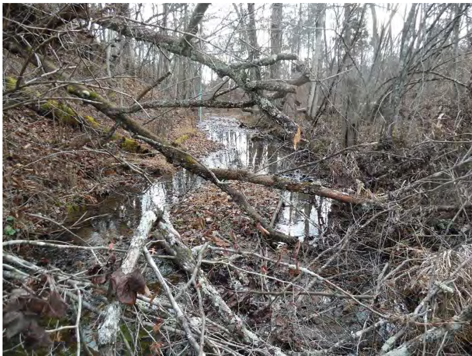
Photo Location 41. View of Stream 31. Photograph taken facing downstream/south.