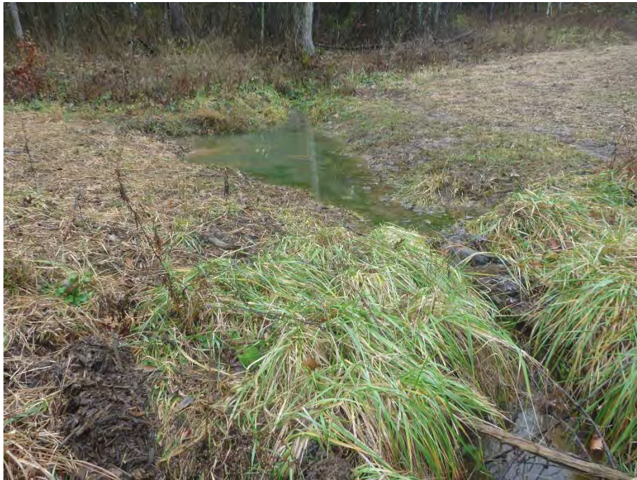
Photo Location 23. View of Stream 20. Photograph taken facing upstream/south.