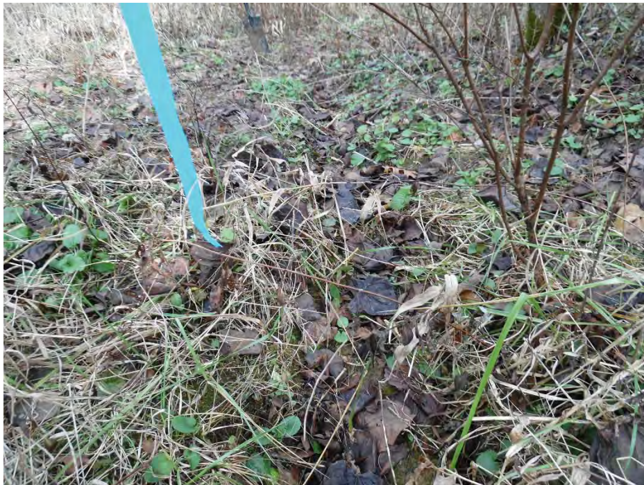
Photo Location 37. View of Stream 29. Photograph taken facing downstream/northeast.