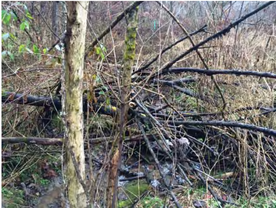
Photo Location 10. View of Stream 8. Photograph taken facing upstream/northwest.