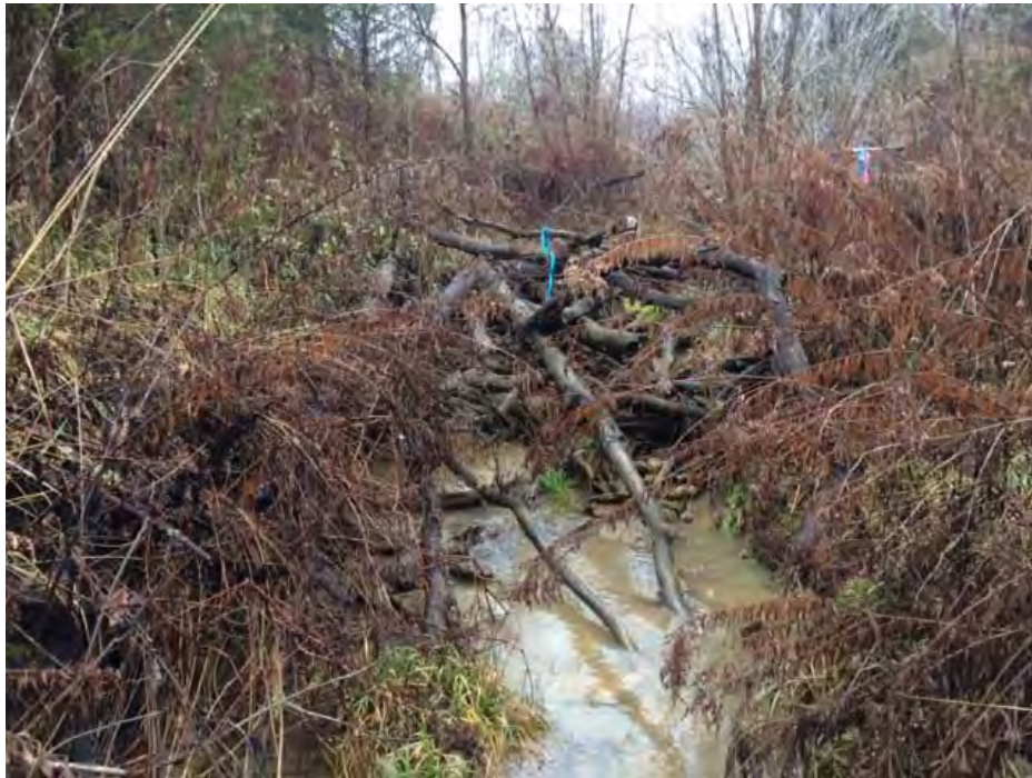
Photo Location 8. View of Stream 6. Photograph taken facing upstream/north.