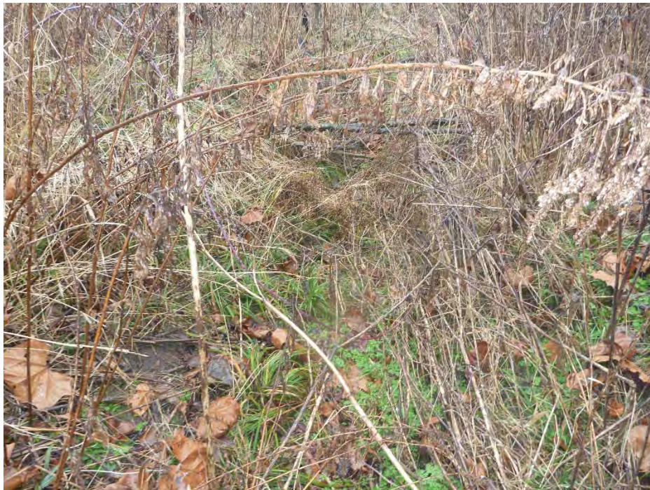
Photo Location 27. View of Stream 24. Photograph taken facing downstream/west.