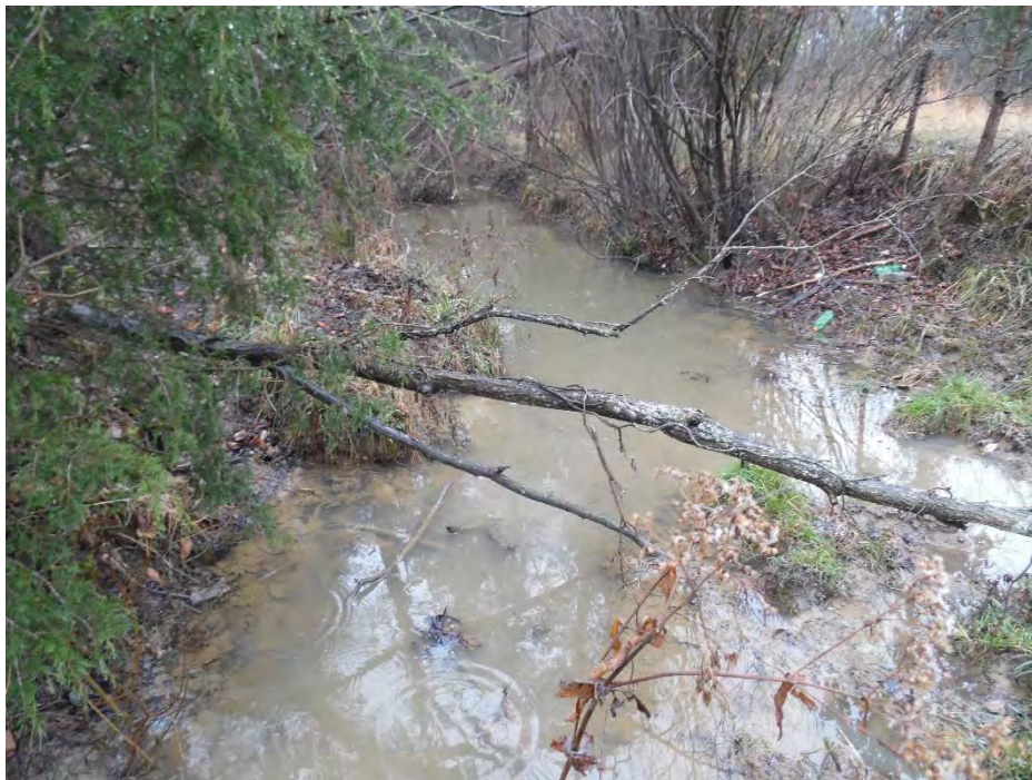
Photo Location 14. View of Stream 12. Photograph taken facing downstream/north.