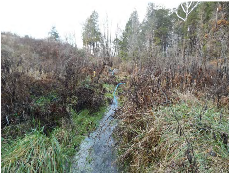
Photo Location 32. View of Stream 26. Photograph taken facing upstream/northwest.