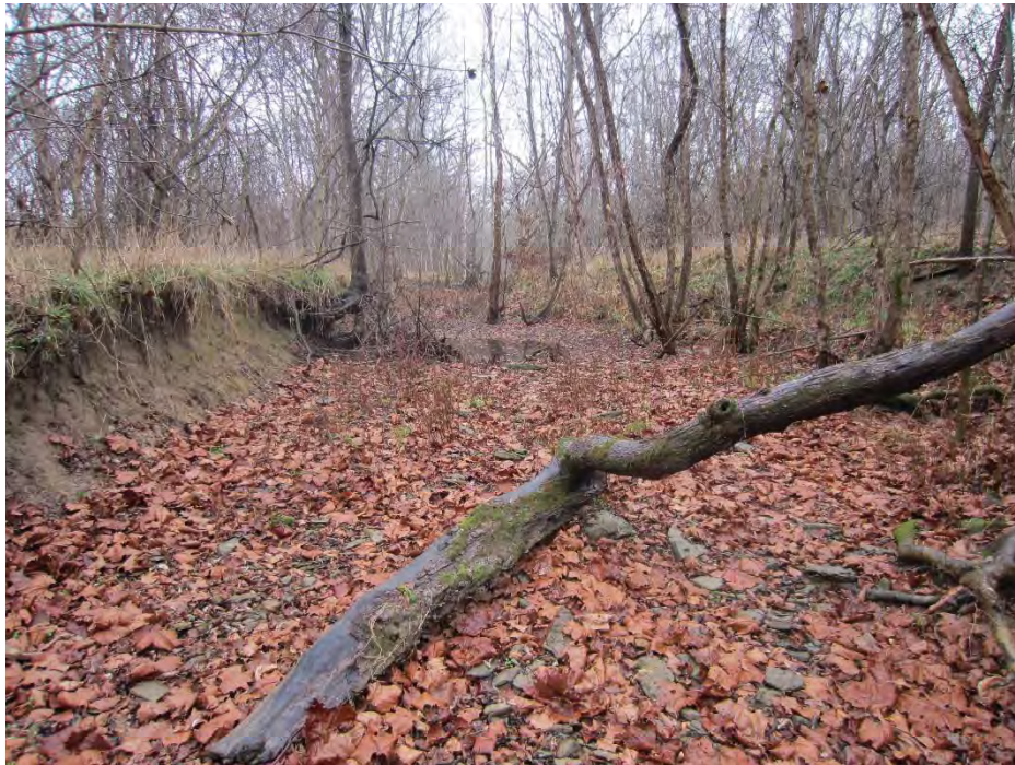
Photo Location 4. View of Stream 2. Photograph taken facing upstream/north.