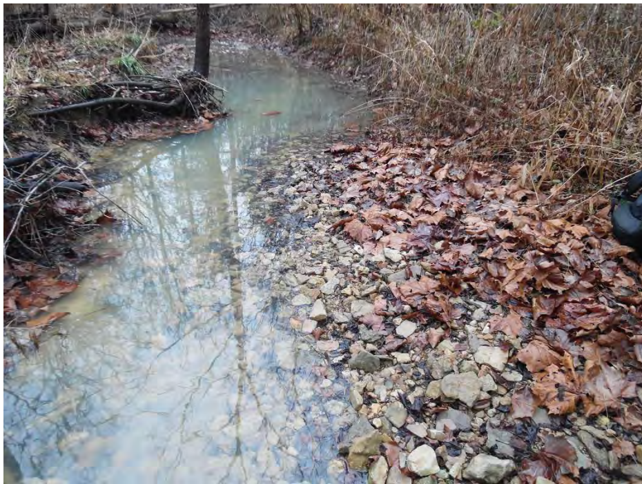
Photo Location 19. View of Stream 16. Photograph taken facing downstream/north.