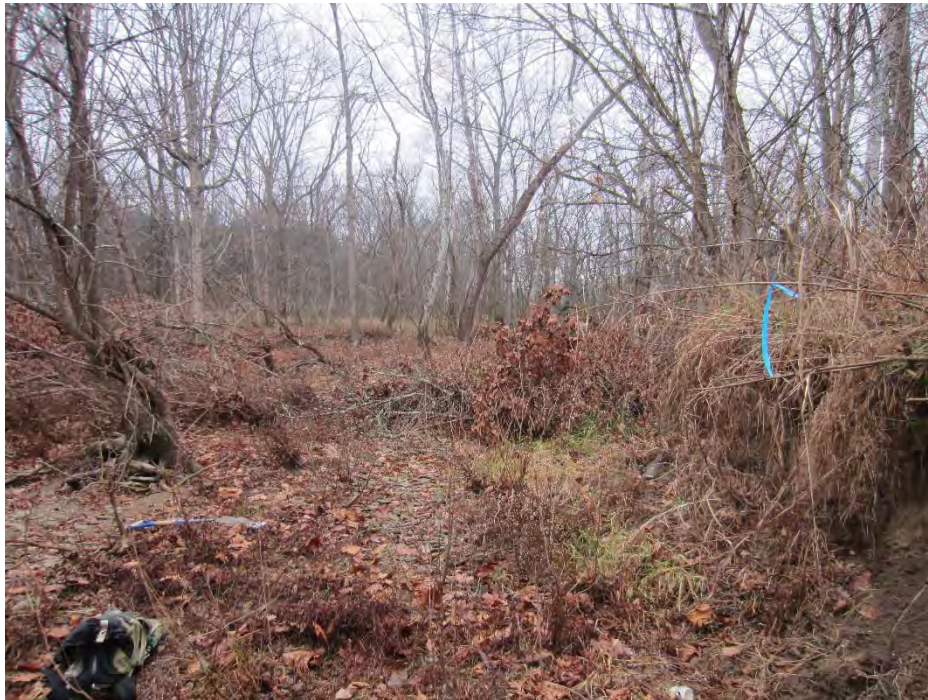
Photo Location 5. View of Stream 3. Photograph taken facing upstream/north.