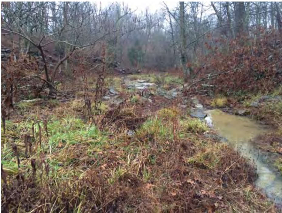
Photo Location 13. View of Stream 11. Photograph taken facing downstream/south.