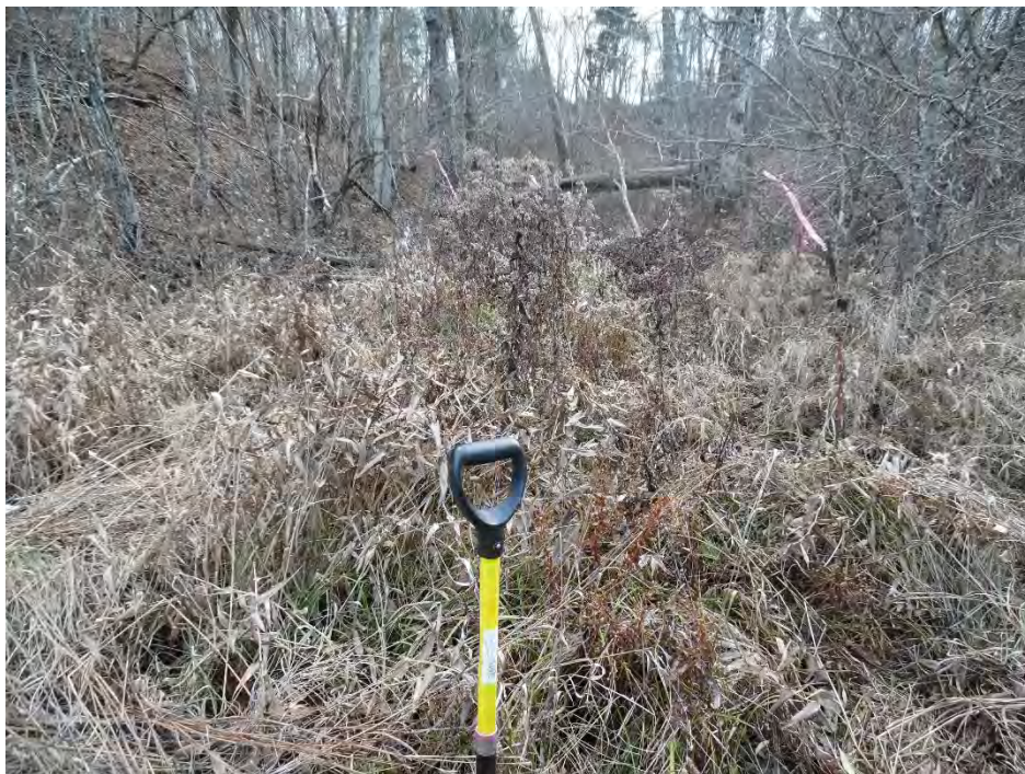
Photo Location 40. View of wetland determination sample point (SP 5) within Wetland 2. Photograph taken facing south.