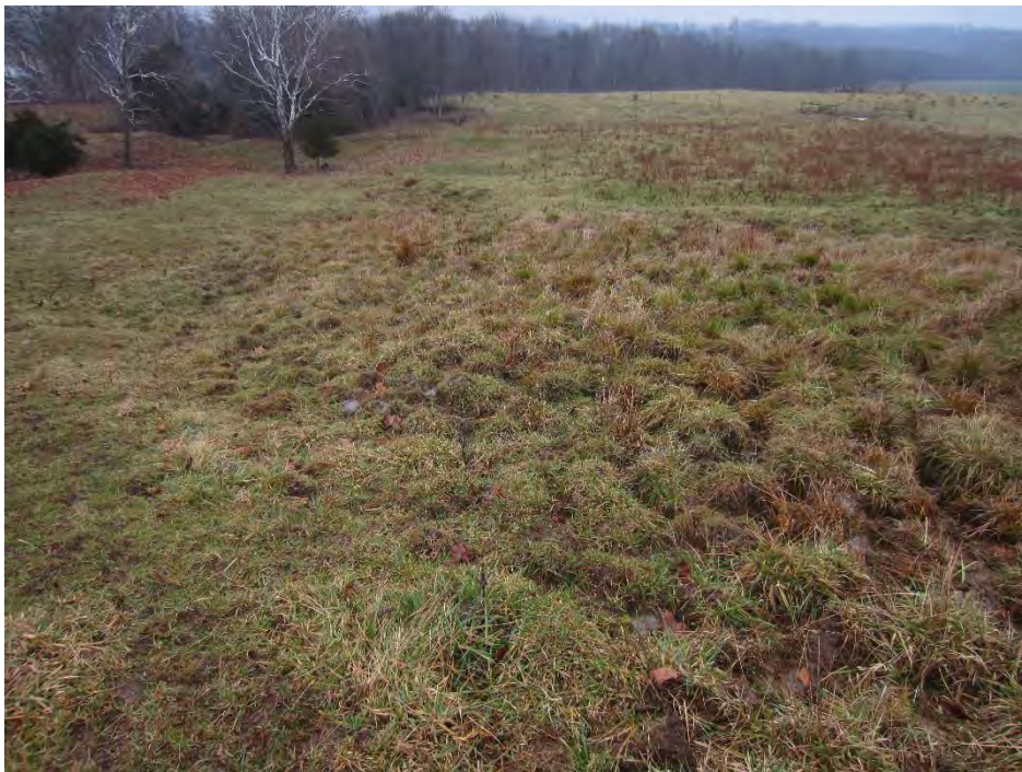
Photo Location 3. View of upland at wetland determination sample point (SP 1). Photograph taken facing north.