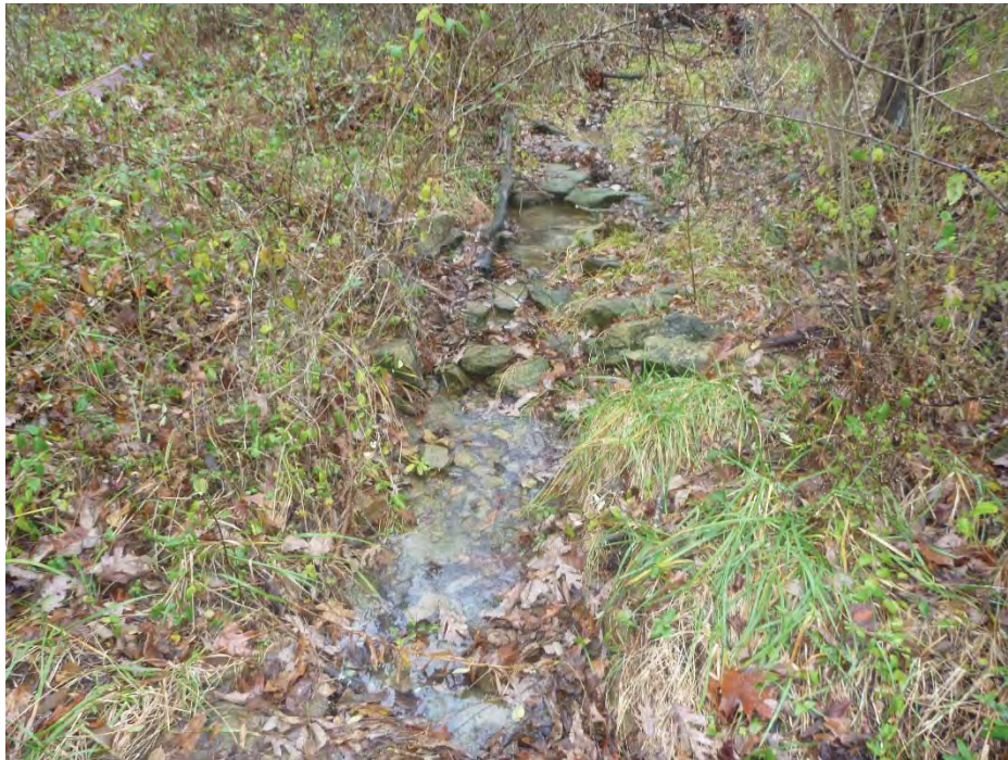
Photo Location 25. View of Stream 22. Photograph taken facing upstream/northeast.