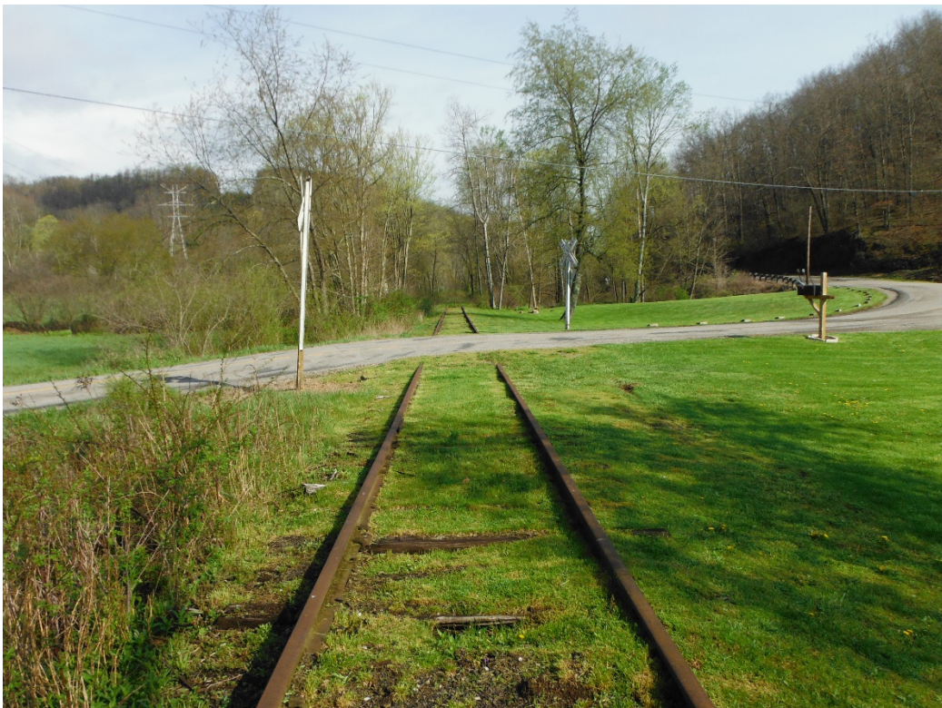
CR 75/Wolf Run Road DOT# 503-286L Crossing looking Northwest.