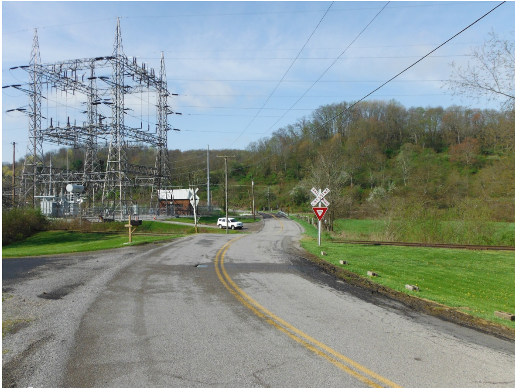
CR 75/Wolf Run Road DOT# 503-286L Crossing looking Southwest.