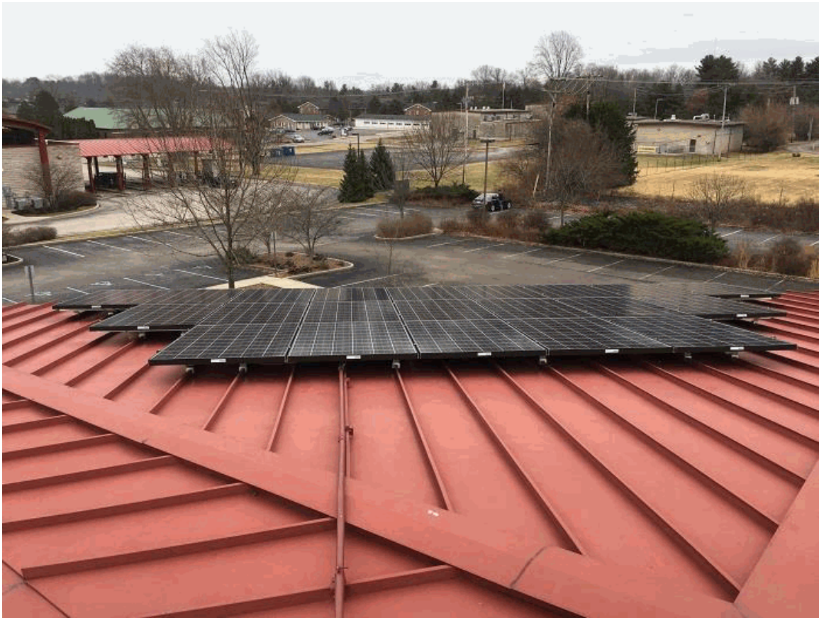
February 03, 2017

RFP Response Update 5-4-16 First United Church Solar Project