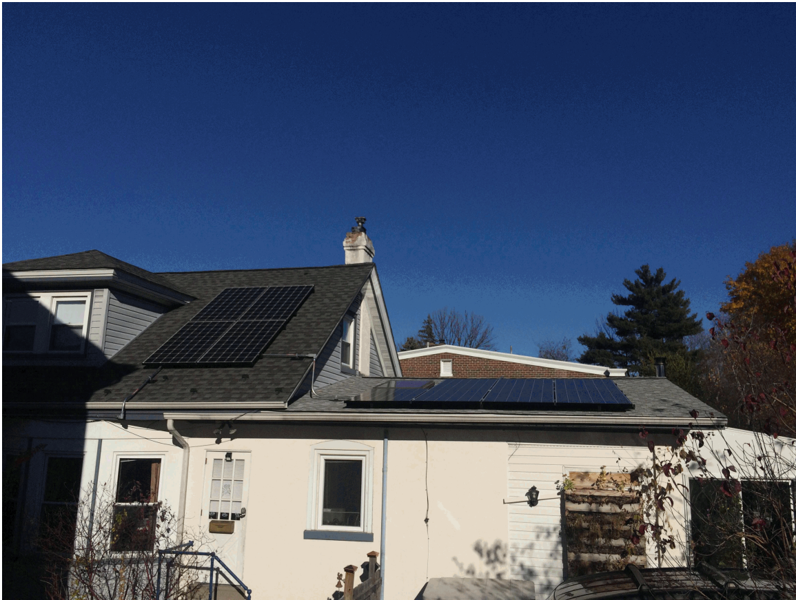
November 28, 2016