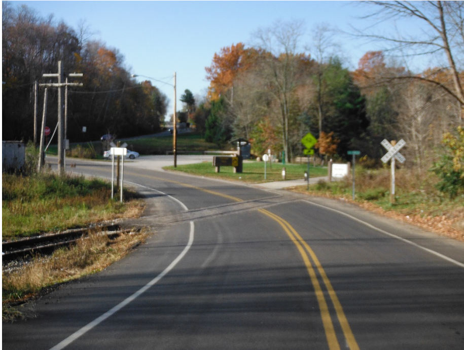
Middlebury Road DOT#264-889X Crossing looking South.