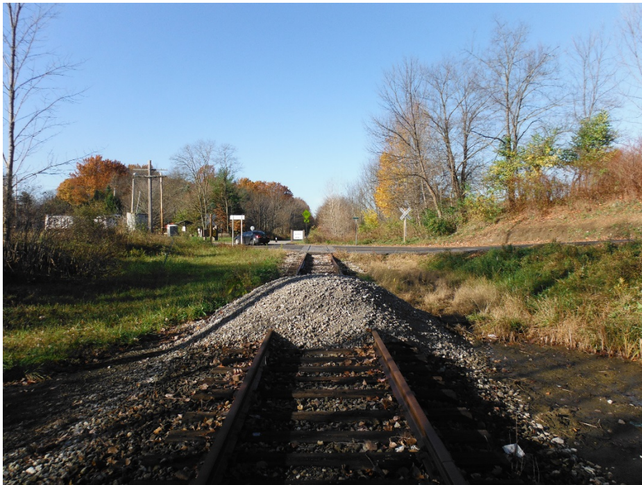
Middlebury Road DOT#264-889X Crossing looking West.