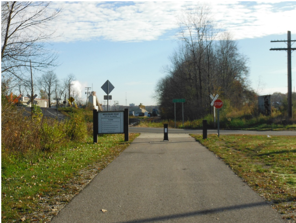
Middlebury Road DOT#264-889X Crossing looking East.