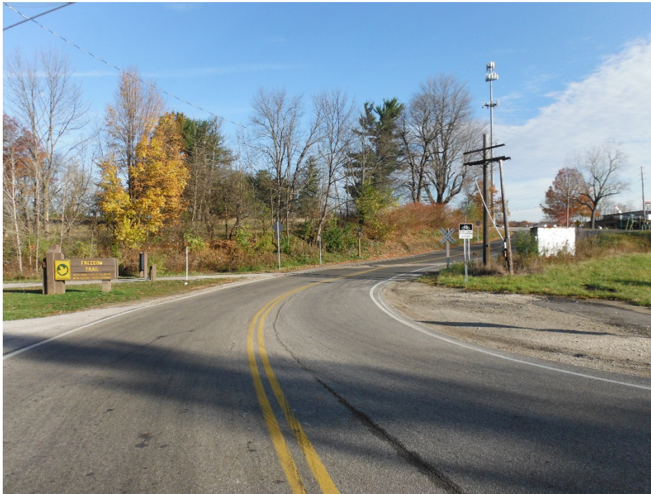
Middlebury Road DOT#264-889X Crossing looking North.