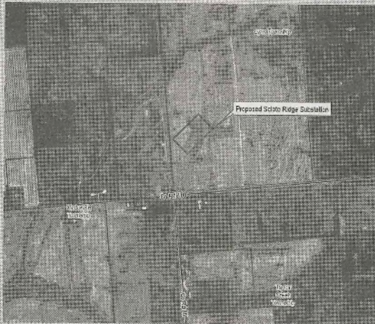
Proposed layout of the facility

Hardin Wind LLC, a wholly owned subsidiary of EverPower Wind Holdings, Inc., is proposing to construct the Scioto Ridge Point of Interconnect (POI) substation in Hardin County, Ohio. The proposed Scioto Ridge POI substation is associated with the Scioto Ridge Wind Farm in Hardin and Logan Counties and the Scioto Ridge Transmission Line, both of which have been certificated by the Ohio Power Siting Board ("Board"). This POI substation is being built in conjunction with the Scioto Ridge