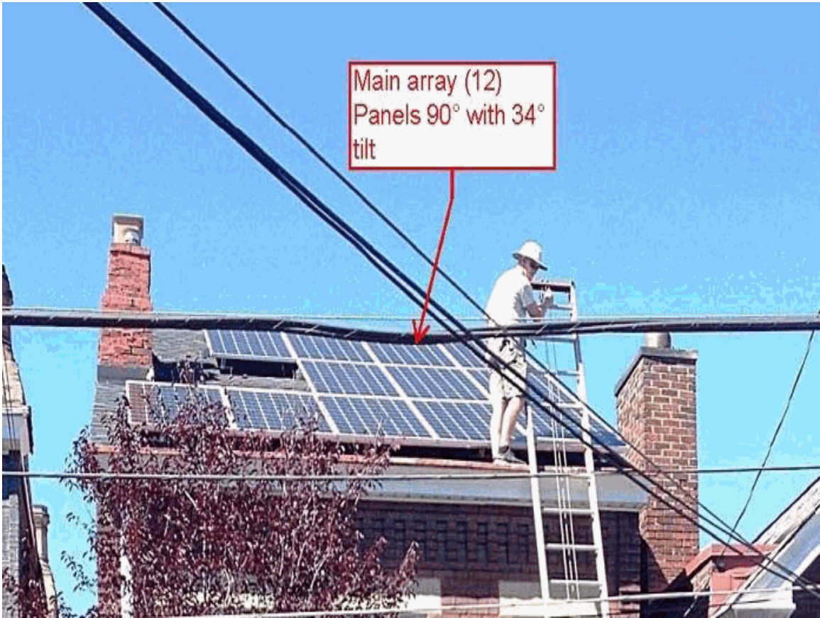
September 25, 2015