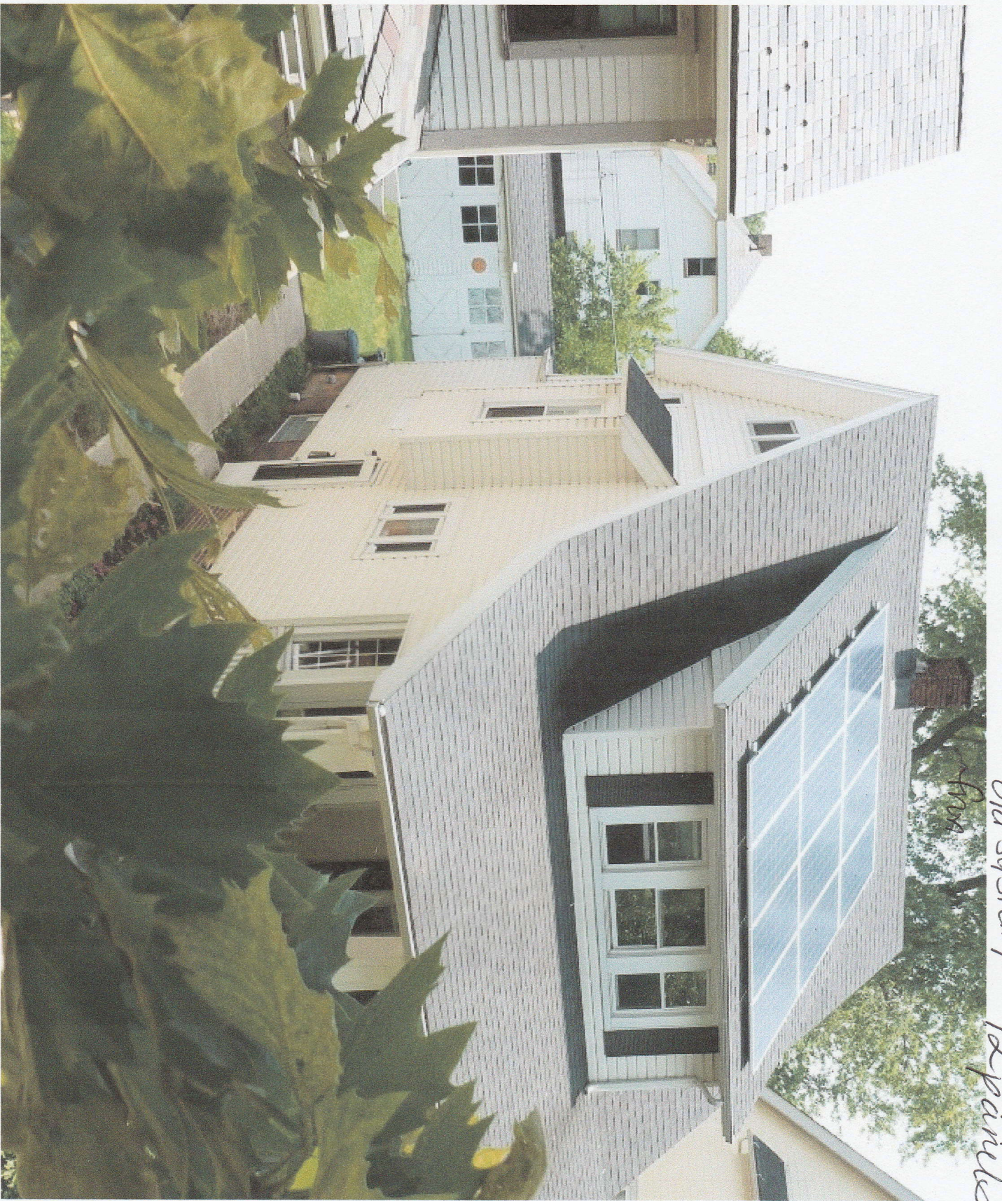
front of house - 12 panels old system - free Murray # 1