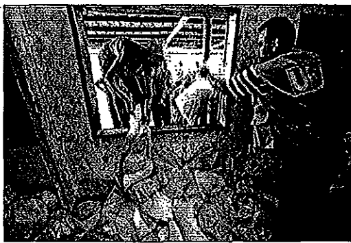
Palestinians crowd a window for food aid at a United Nations distribution center in the Shati refugee camp in Gaza City on Wednesday as a cease-fire between Israel and Hamas continues.

Foreign ministers from Arab countries including Egypt, Jordan and Kuwait will visit Gaza in the coming days as part of an Arab League delegation that will assess what is needed to begin reconstruction of the coastal strip. Arab League Secretary-General Nabil al-Arabi said, according to the United Arab