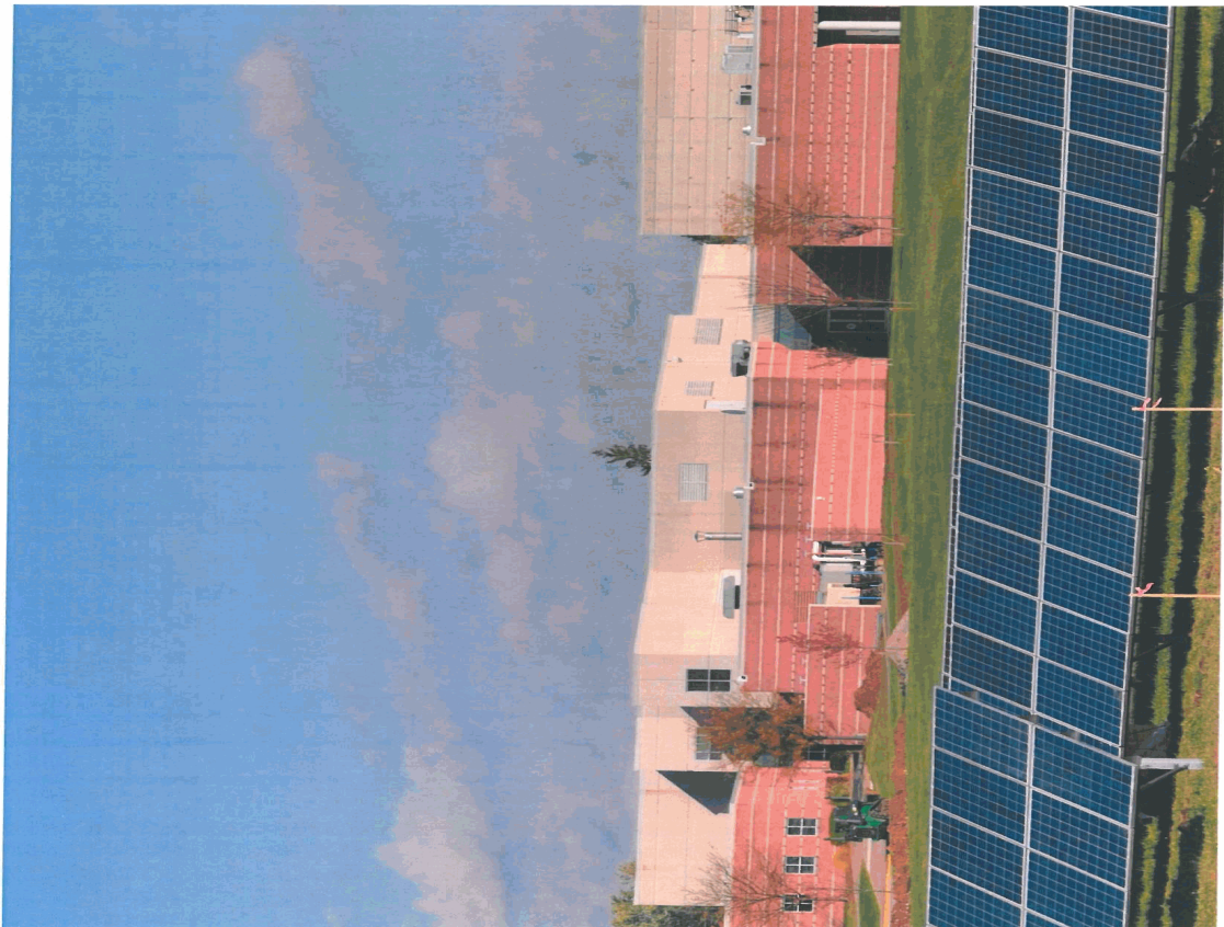
October 17, 2014