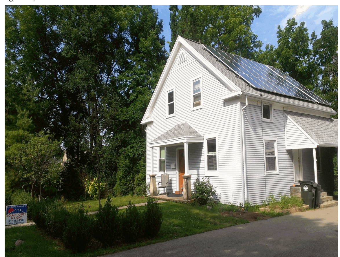
August 19, 2014