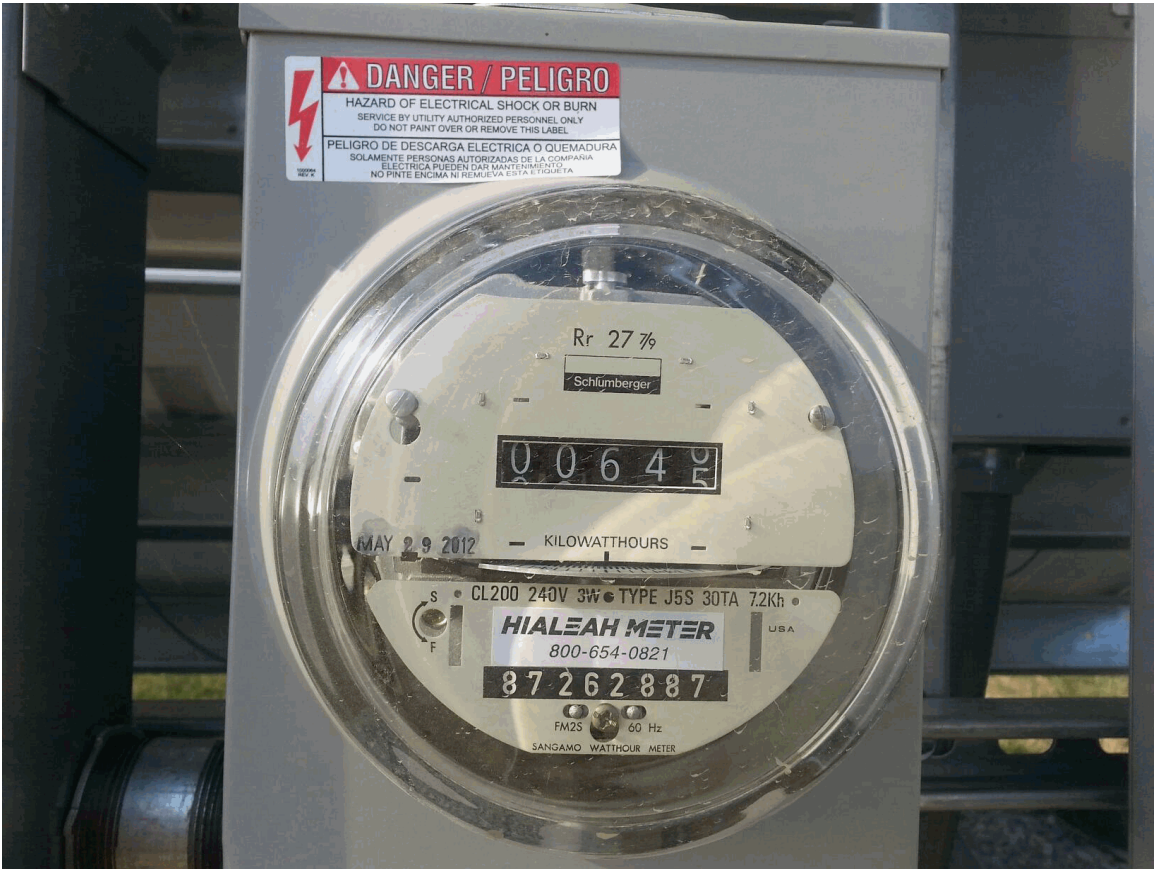
June 25, 2013