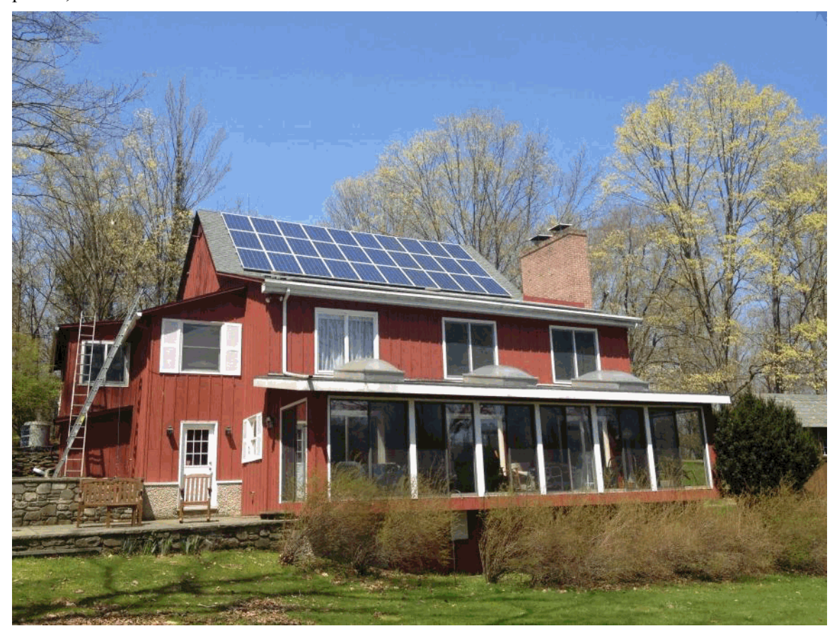
The Applicant is applying for certification in Ohio for a facility using one of the following qualified resources or technologies (Sec. 4928.01 ORC):