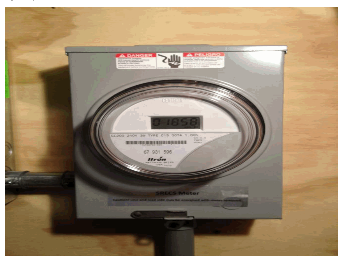
April 24, 2013

N.1.e Report the total meter reading number at the time the photograph was taken and specify the appropriate unit of generation (e.g., kWh): 1858.0 KWH