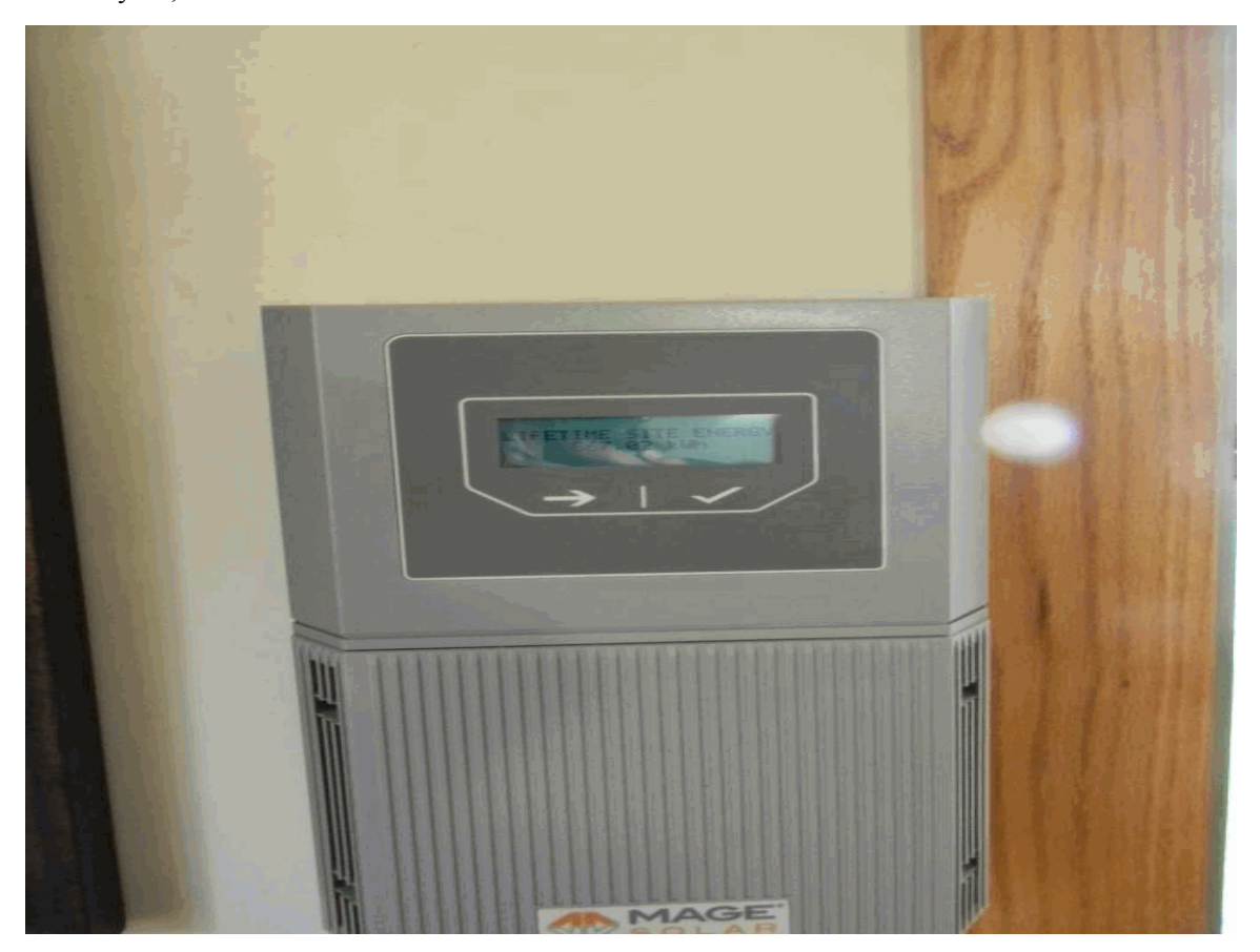
February 26, 2013

N.1.e Report the total meter reading number at the time the photograph was taken and specify the appropriate unit of generation (e.g., kWh): 863.0 KWH