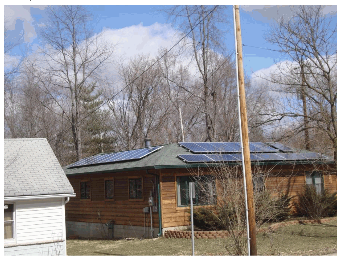
The Applicant is applying for certification in Ohio for a facility using one of the following qualified resources or technologies (Sec. 4928.01 ORC):