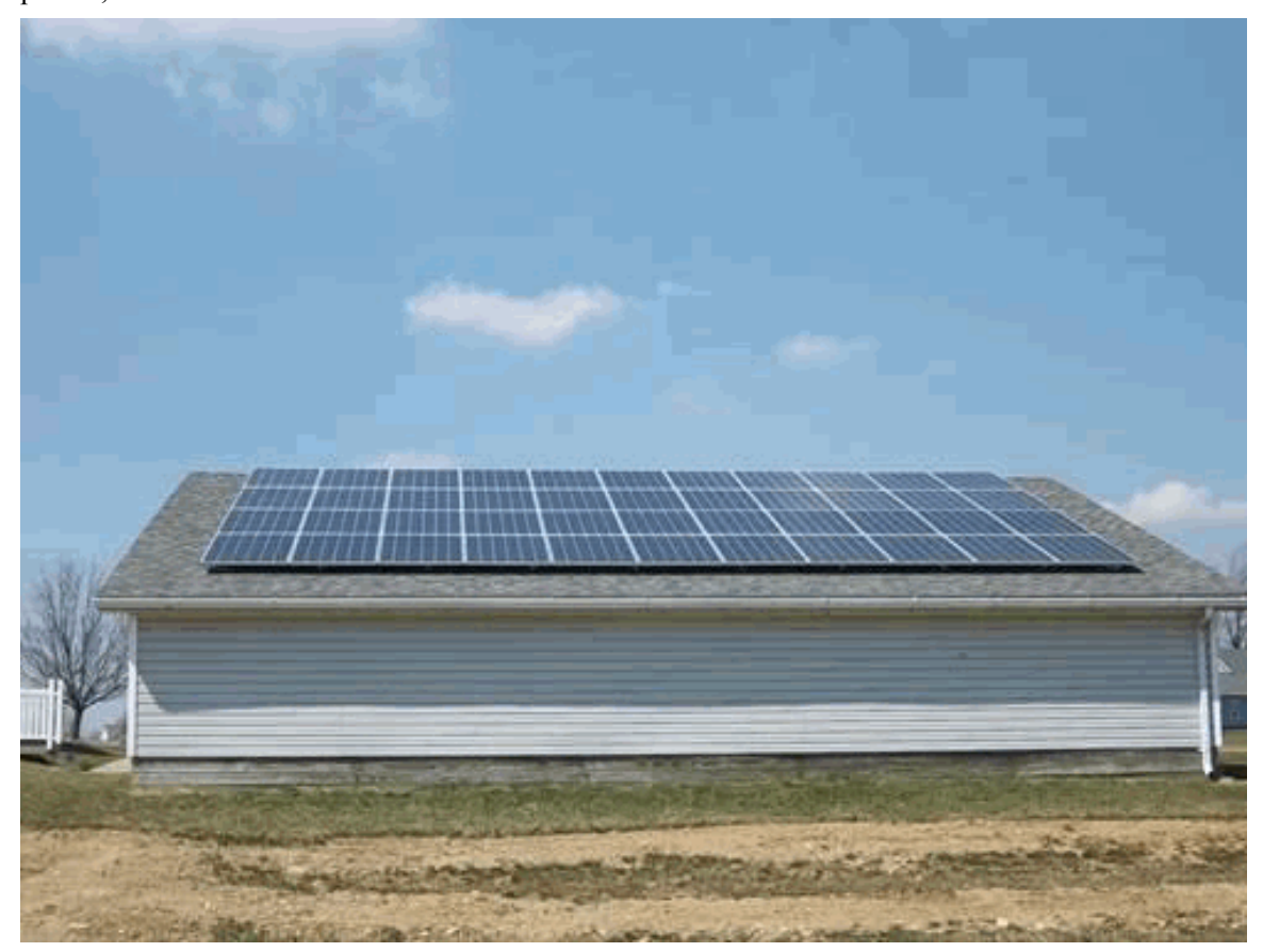
The Applicant is applying for certification in Ohio for a facility using one of the following qualified resources or technologies (Sec. 4928.01 ORC):