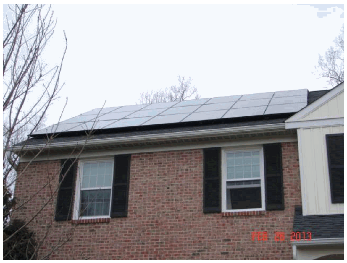
February 26, 2013

The Applicant is applying for certification in Ohio for a facility using one of the following qualified resources or technologies (Sec. 4928.01 ORC):