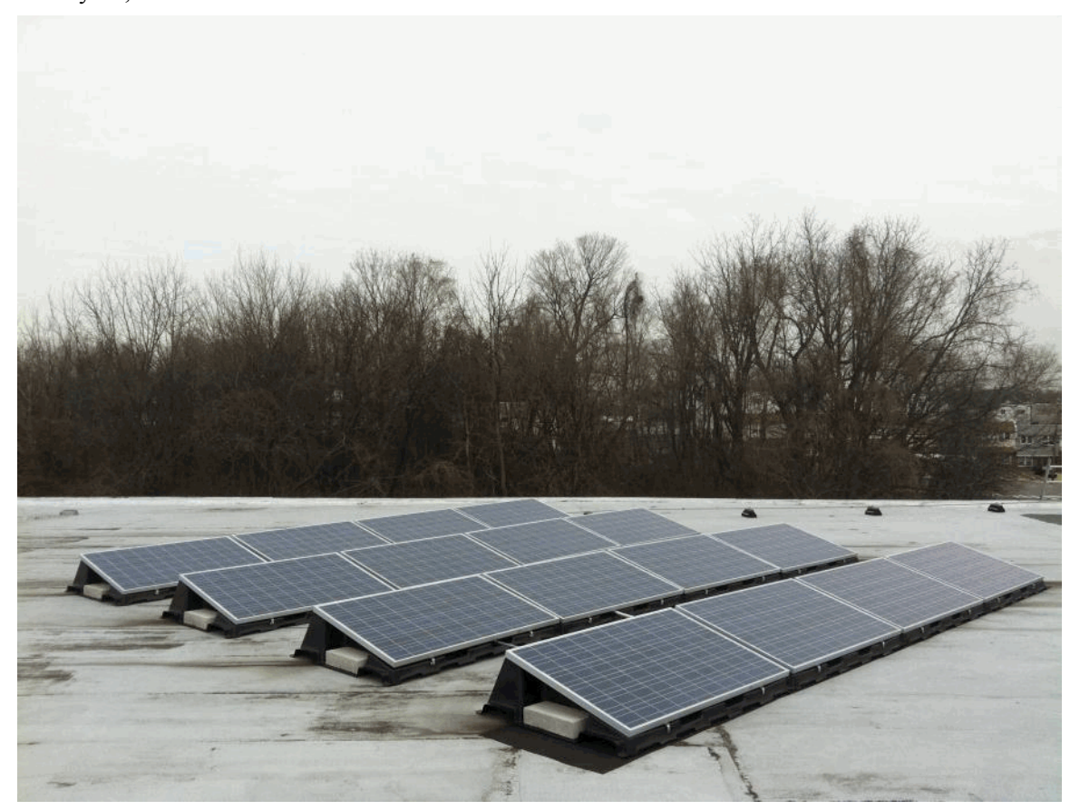
The Applicant is applying for certification in Ohio for a facility using one of the following qualified resources or technologies (Sec. 4928.01 ORC):