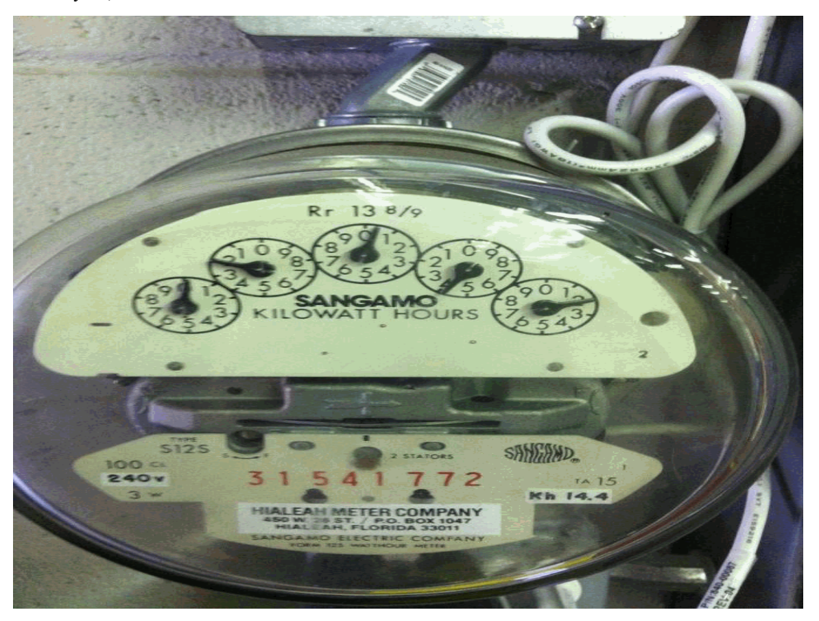
February 13, 2013

N.1.e Report the total meter reading number at the time the photograph was taken and specify the appropriate unit of generation (e.g., kWh): 2042.0 KWH